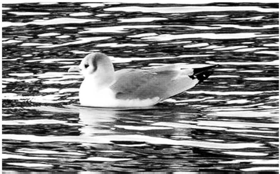
This adult Black-legged Kittiwake lingered until 2 Jan 2016 at L McConaughy (photo here 1 Jan by Justin Rink). Adults are rare in Nebraska.

Black-legged Kittiwake: The only report was of a very late ad at LO 1 Jan (JR, photo) and present the next day for the LM CBC (fide SJD). Last expected dates are 6-9 Dec, but there are 5 later records through 3 Jan. Ads are rarely-reported in Nebraska.