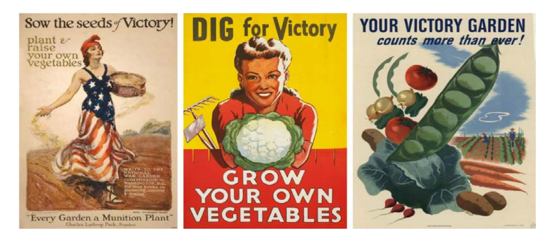
Fig. 1. Propaganda to encourage urban agriculture in programs such as "Liberty and Victory Gardens" and "Dig for Victory", during the world wars.

After World War II, some gardens remained, and many others started to appear in Europe. The need to produce food for subsistence continued throughout the economic recovery after the wars and, at the same time, its function of being a green space for leisure grew (TURNER; HENRYKS; PEARSON, 2011; GONÇALVES, 2014).