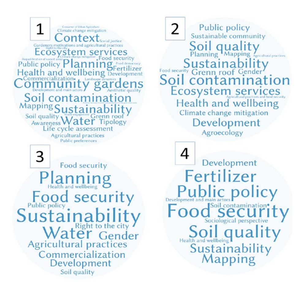
Figure 3. Main themes of the case studies on urban agriculture in countries 1) with very high HDI; 2) with high HDI; 3) with an average HDI; 4) with low HDI. The size of the words represented in the diagram is proportional to the number of times they are the main theme of the studies.

From the 164 selected articles, 107 were developed in countries with HDI considered very high. The United States leads the ranking of published articles in this field, with New York being the biggest study focus. This was a foreseeable result, not only because of the country's history and continuous development of urban gardens to this date, but also because the country leads in the number of scientific papers published in the world, according to the Nature Index 2015 Global. Moreover, the studies regarding urban gardens are being broadly conducted in developed countries and the main subjects approached are summarized in Figure 3.