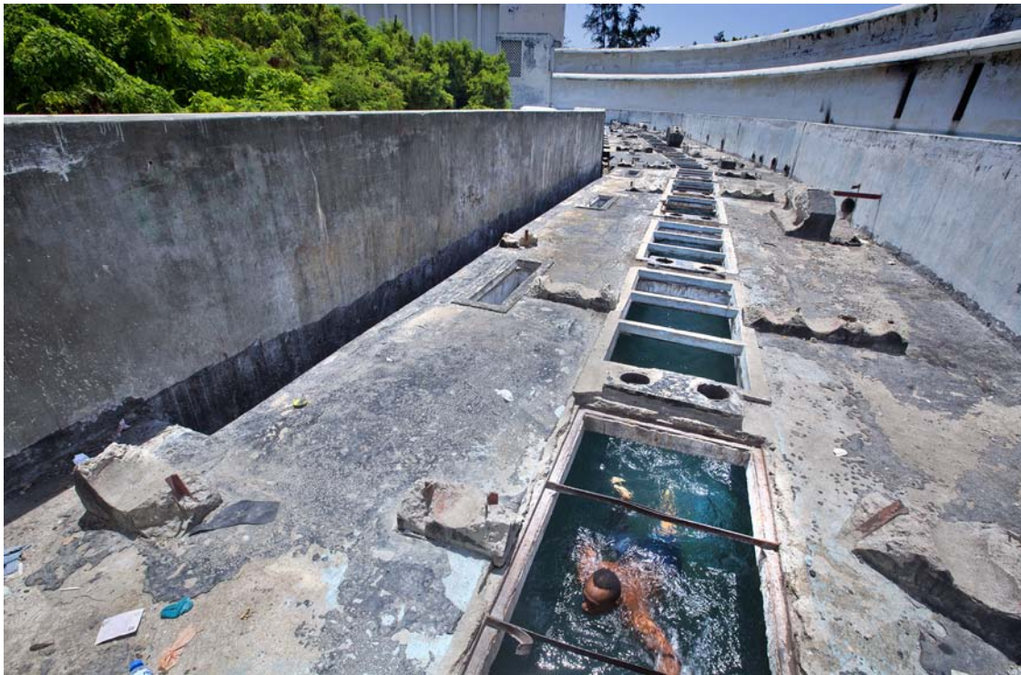
FIGURE 6. A man swims through the obsolete water channels that used to power the dancing fountains at the Water Light Theater in Santo Domingo. Fausto Fontana, Modern Ruins: Abandoned Teatro Agua y Luz used as Lap Pool , 2014.

spectacle, which sought to induce awe at the modernity realized under Trujillo. In this sense, the Teatro participated in the visual culture of what I theorize elsewhere as “spectacular modernity”: the materialization of political power relations through spatial politics and cultures of display. 35 As they witnessed the cavorting cabaret acts, the public was encouraged to acknowledge that behind the scenes it was the power and authority of Trujillo that made the fountains dance.