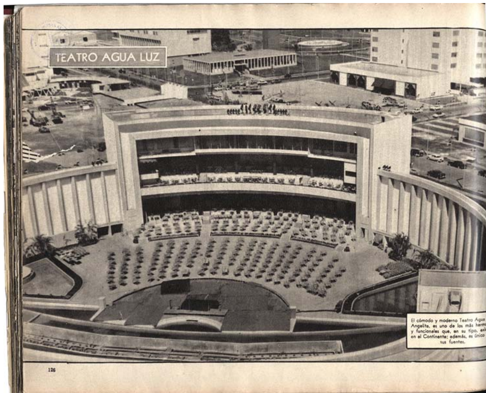
FIGURE 4. The newly-constructed Water Light Theater at the Free World's Fair of Peace and Brotherhood in 1955.

auditorium equipped with 355 fountains that spurt vertical or arching jets of water lit in different colors in time with orchestras that played for cabaret shows performing on a large stage (figs. 4–5). The Teatro was completed in 1955 at the entrance to the Feria de la Paz y Confraternidad del Mundo Libre (Free World's Fair of Peace and Brotherhood), an ultra-modern urban complex built west of the colonial center. For the first year, the complex functioned as a fairground of pavilions and entertainment facilities to host celebrations of a quarter century of the era of Trujillo. Later it became the new hub for government ministries and institutions. The Teatro's dancing fountains were the high-water mark of both urban modernity and hubristic hydraulics. 31 During the festivities, the Teatro was the Feria's largest entertainment attraction, open nightly when it hosted international cabaret groups such as the Paris Lido and International Follies. The lavish state propaganda publication, the Álbum de oro de la