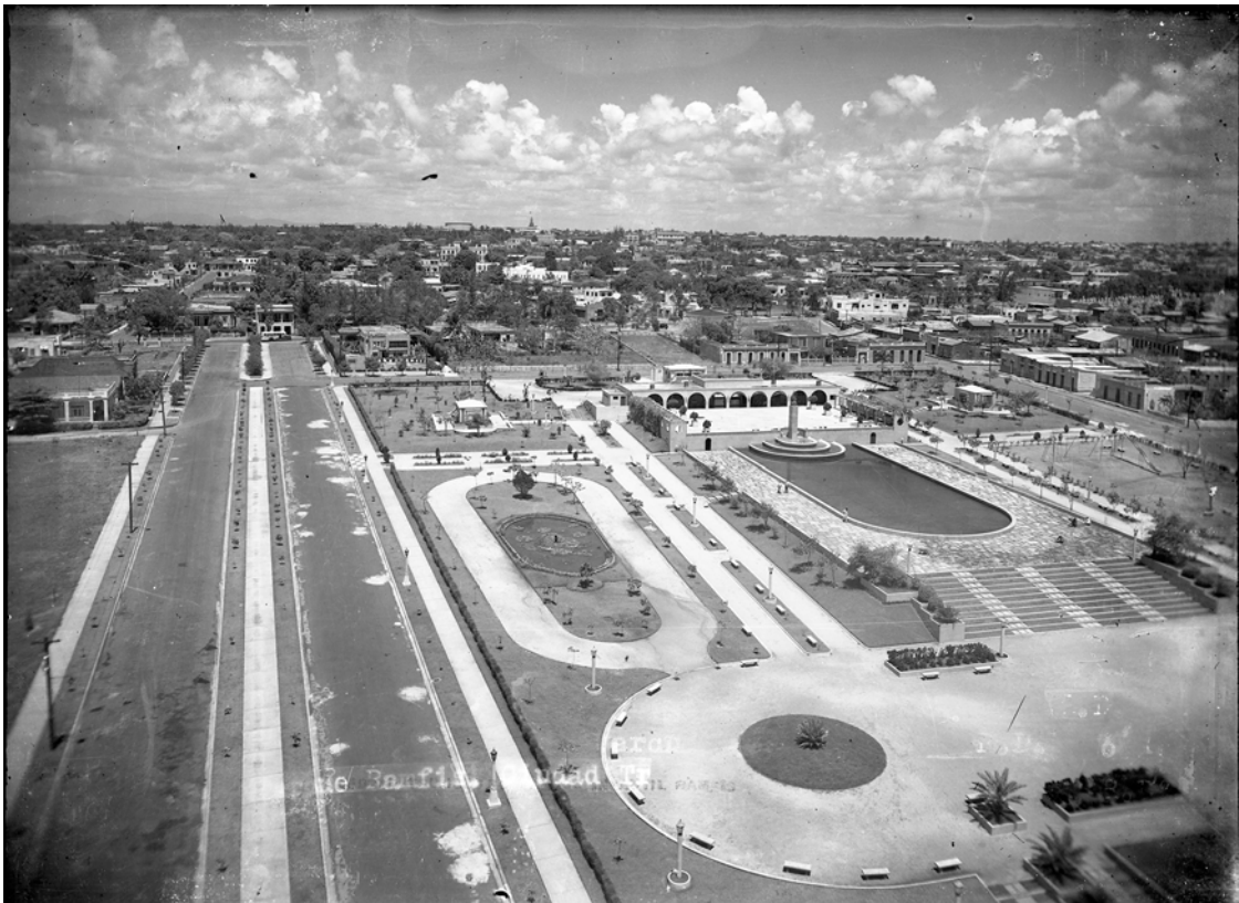
FIGURE 2. Aerial photograph of Parque Ramfis, Ciudad Trujillo, c. 1936.

aesthetics, the park consisted of a large concrete esplanade that opened directly onto the Caribbean. It could be accessed via a series of graded steps from the Malecón or the streets running parallel and perpendicular to the seawall. The park's central feature was a monumental oval reflecting pool that served as a space for quiet contemplation and for bathing. Around it, benches, walkways and gently sloping flights of steps offered circuits for strolling and repose, while covered pavilions provided shade from the tropical sun. Adjacent to the park and the seawall, González Sánchez designed an obelisk that served as a monumental focal point and place of congregation for pro-Trujillo political rallies. The semantic shift of renaming Santo Domingo Ciudad Trujillo and the opening of Parque Ramfis and the Obelisk in 1936–37 cemented the causal link between the city's reconstruction and the dictator's political agency, which was gendered through the phallic monument, whose nickname "Obelisco Macho" tacitly evoked Trujillo's notorious reputation as a womanizer. 20