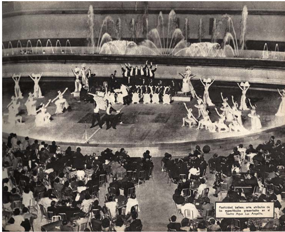
FIGURE 5. Cabaret show at the Water Light Theater in 1955.

indexed state power. This tradition dates back to urbanization in early modern Europe, and specifically to thirteenth-century Umbria, where wealthy secular oligarchies began to regulate city-states through rational city planning. There, the construction of centrally located decorative fountains that surpassed merely functional uses emerged as a means of symbolizing the enduring power of religious authorities and emerging power of secular elites. This trend continued in the ensuing centuries as fountains became central features of iconic sites such as the Villa d'Este in Tivoli and the Palace of Versailles. 33 In a very different historical and geographical context, the Teatro's vertical jets of water similarly represented political power by staging a zenith in hydraulic science that marked the ultimate culmination of the post-hurricane reconstruction and modernization of the Dominican capital that had spanned the twenty-five-year-long era of Trujillo. If Parque Ramfis had inaugurated Santo Domingo's emergence from the rubble left by the 1930 hurricane, the 355 dancing fountains at the Teatro Agua Luz Ángelita confirmed Ciudad