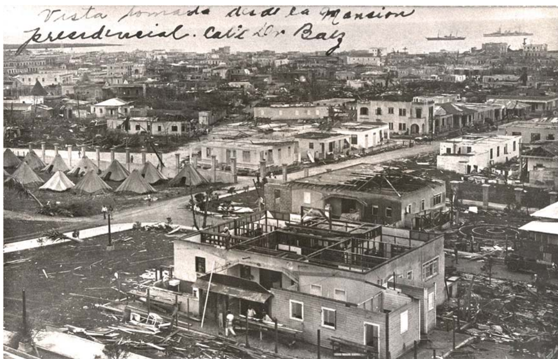
FIGURE 1. Postcard showing the devastation of Santo Domingo after the San Zenón hurricane, 1930.

public buildings took shape, in 1926 the city gained its first aqueduct and sewerage system that serviced the colonial center and a handful of new residential areas. 10