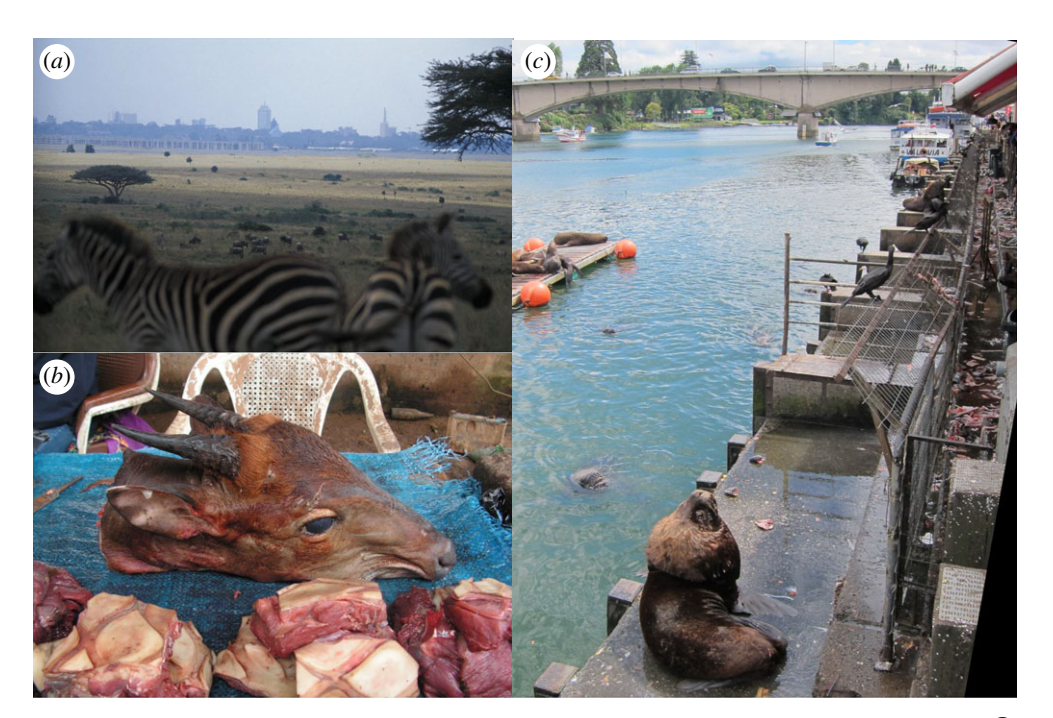
Figure 1. Biodiversity under threat. ( a ) Plains zebra ( Equus quagga ) and blue wildebeest ( Connochaetes taurinus ) by Nairobi, Kenya. ( b ) Carcass of a Peter's duiker ( Cephalophus callipygus ) for sale in Makokou, Gabon. ( c ) South American sea lions ( Otaria flavescens ) in Valdivia, Chile. (Online version in colour.)

priority. This theme issue is motivated by the conviction that the most cost-effective way to obtain conservation impact indeed often involves behavioural ecological study [3–5]. The fact that the most immediate response of animals to environmental change typically is behavioural puts behavioural ecology in a central position to inform natural resource management [6]: not only can behaviour serve as an early warning system of environmental deterioration, behavioural changes also directly or indirectly affect vital rates, i.e. survival and reproduction, the very key parameters determining the dynamics of populations and their aggregate, communities. It is the links between behavioural ecology via population and community ecology to conservation on which this theme issue concentrates.