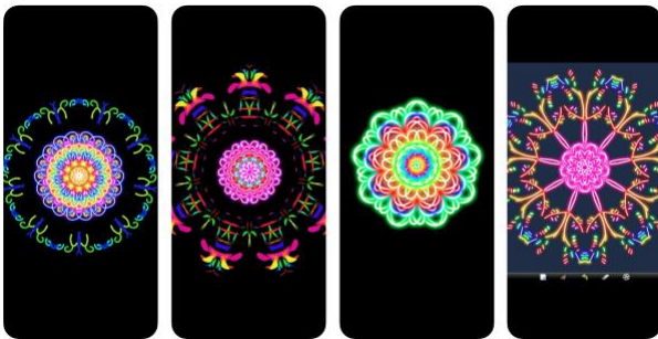
Figure 1. Kaleidoscope Drawing Pad (Bejoy Mobile 2012), a casual creator which involves creation of abstract art through touching the screen.

Casual creators are a genre of software that playfully facilitates creativity which is enjoyed for its own sake, rather than the sake of the quality of the product (Compton & Mateas 2015). Examples include applications for generating visual imagery, combining basic musical elements into music pieces, or choosing an image from a set to generate similar art. For example, in the app Kaleidoscope Drawing Pad (Bejoy Mobile 2012) (Figure 1), touching the screen generates kaleidoscopic images for amusement.