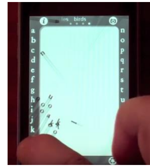
Figure 3. A user swipes the screen in the casual creator abcdefghijklmnopqrstuvwxyz to move the letters.

directs the movement of agents visualised as letters of the alphabet (with musical accompaniment) (Figure 3).