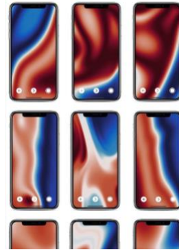
Figure 5. Kandinsky.io (Khosravi 2019) – users select their favourite wallpaper variant.