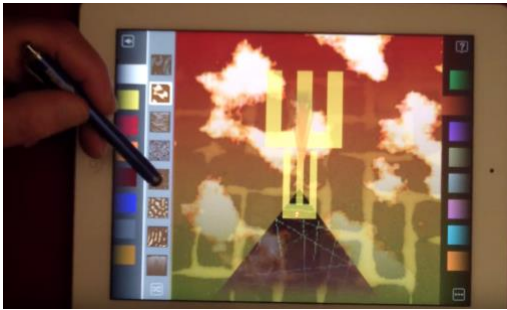
Figure 4. Scape , a musical app in which the user combines shapes to create musical compositions.

This type of casual creator spans the creation of visual art and also music. For example, in the app PendantMaker (Compton and Mateas 2015), the user makes vague patterns and the app makes a pendant from them. Similarly, in Scape , the program recombines musical elements to create new compositions (Figure 4).