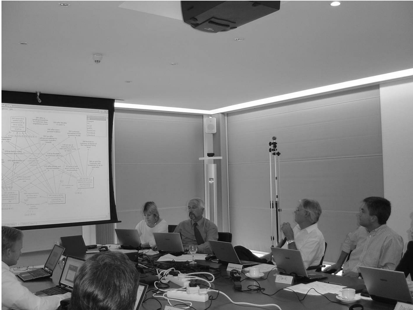
Figure 2: A photograph of a management team using the GDSS