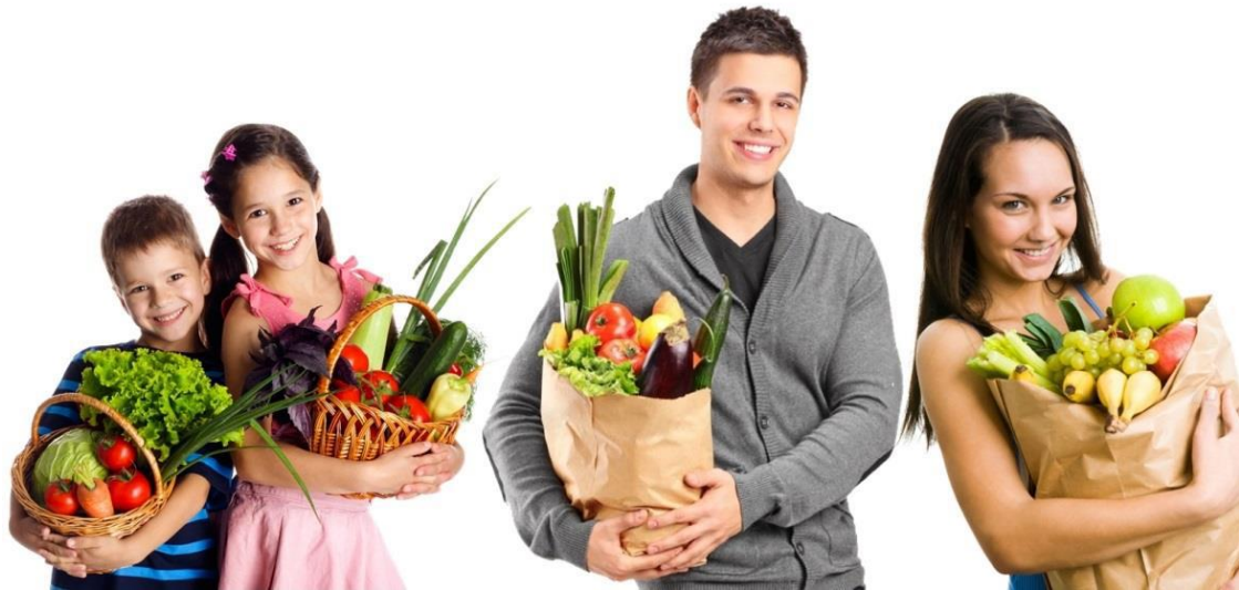
Fig. A2. The poster featuring an injunctive peer norm.*

Wusstest Du, dass die meisten Schüler denken, ihre Mitschüler sollten jeden Tag Obst und Gemüse als Snack essen?