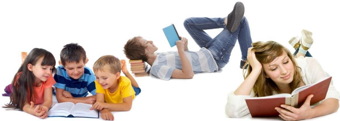
Fig. A4. The poster in the control group.*

*English translation: Did you know that reading is the best exercise for your brain?