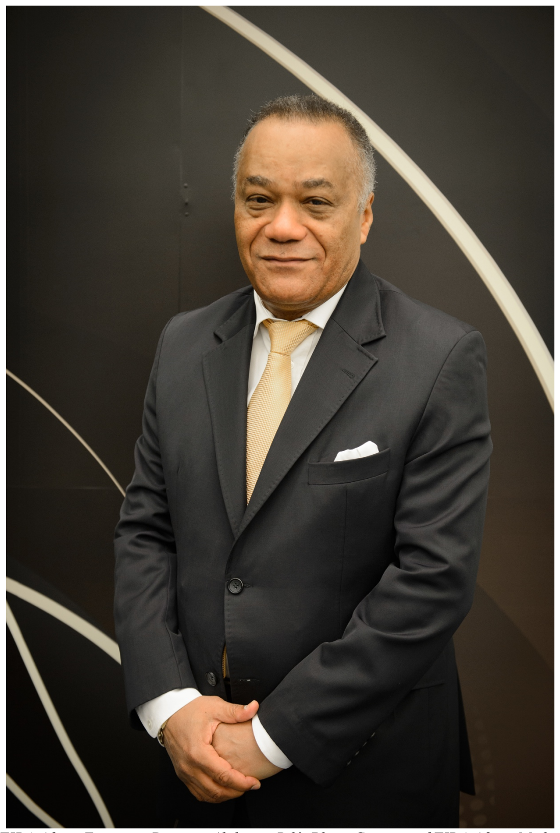
FIBA Africa Executive Director Alphonse Bilé.