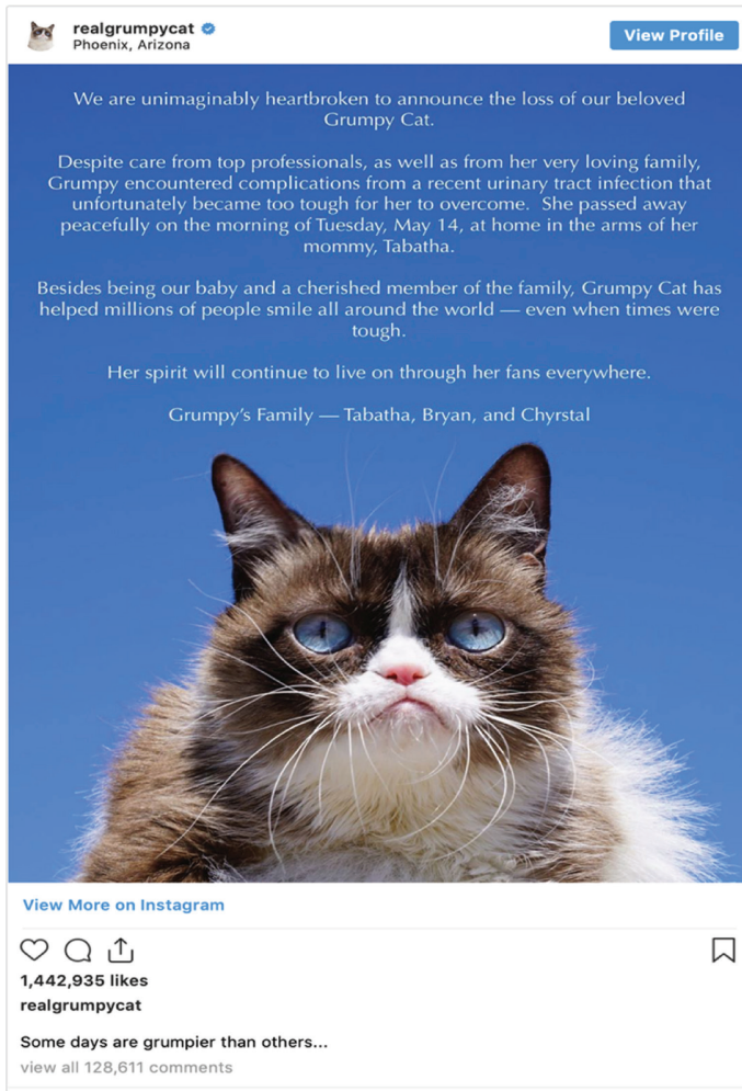
Figure 1. Instagram announcement of Grumpy Cat's death in May 2019.

On Friday 17 May 2019, news of the death of Grumpy Cat was shared via the Instagram account realgrumpycat , which has nearly 2.7m followers (Figure 1). Grumpy Cat, known on social media for her gloomy gaze, was one of the first petfluencers , i.e. pets used by their owners for advertising and publicity purposes. The post announcing her death attracted more