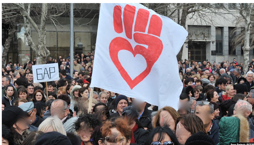
FIGURE 3 Prelević (2017b) [Colour figure can be viewed at wileyonlinelibrary.com ]