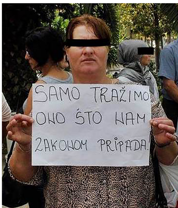
FIGURE 2 ИИ4С Portal (2017) [Colour figure can be viewed at wileyonlinelibrary.com ]

Having lost their 'infrastructure of support' (Butler, 2016, p. 19), the mothers discover an alternative infrastructure — in the form of building an alliance with practitioners. This solidarity is not just underwritten by circumstantial or technical means but encompasses the symbolic and the embodied. It is displayed and enacted through the appropriation of new signifiers from practitioners — infrastructural and relational symbols of solidarity, democracy and feminism — in order to augment their subjectivity. Such augmenting is enacted through a mix of bodies, texts and visual signs and it is difficult to conceptually disentangle any of these.