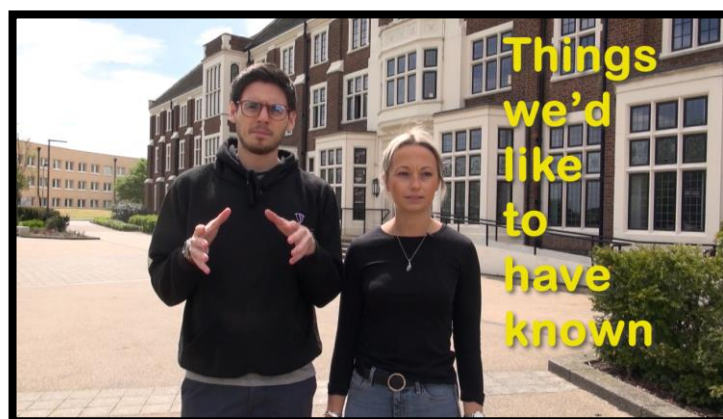
Figure 2. University students helped to make the students feel at home and ‘belong’