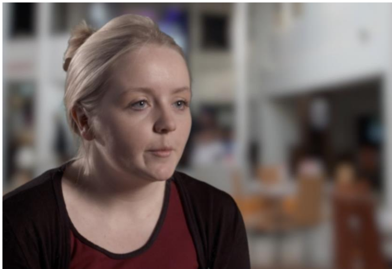
Figure 1. 'Advice to my first-year self' video

As indicated above, the first phase's research data reinforced the need to create an online module to support and improve BTEC students' transition into the HE teaching and learning environment. At Loughborough University, the project team brought in the support of a learning technologist and also called on the skills of the central virtual learning environment (VLE) team to create a module called WARM_UP (Welcome and Academic Resource Module for Undergraduate Preparation). During this stage, it was also decided to bring in former BTEC students who were now in their second year at Loughborough (including those who had taken part in the first phase of the project), to help assist the development of the module. This process also built upon the team's previous experience of creating video content to enhance the curriculum for a first-year study skills module delivered within the School of Business and Economics. 'Advice to my first-year self' (figure 1) was created in collaboration with second-year undergraduate students to help all undergraduate students to learn the skills necessary for successful transition to university, based upon personal experiences voiced by their peers.