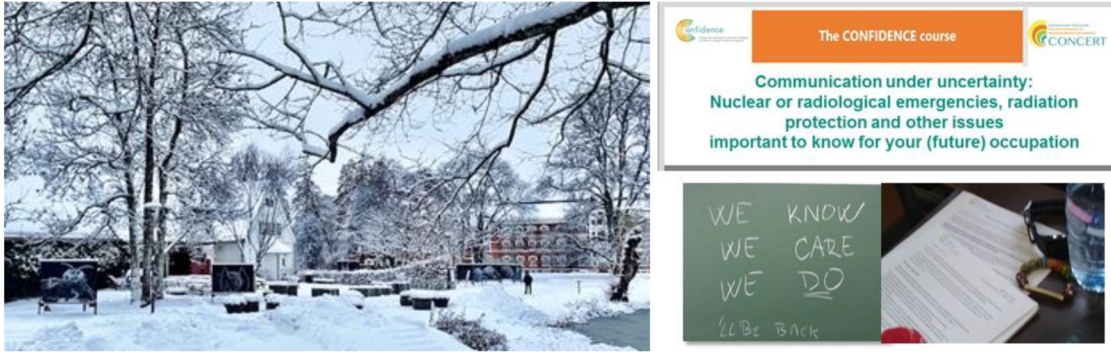
Fig. 2. Course location in Norway and snapshot from realisation.