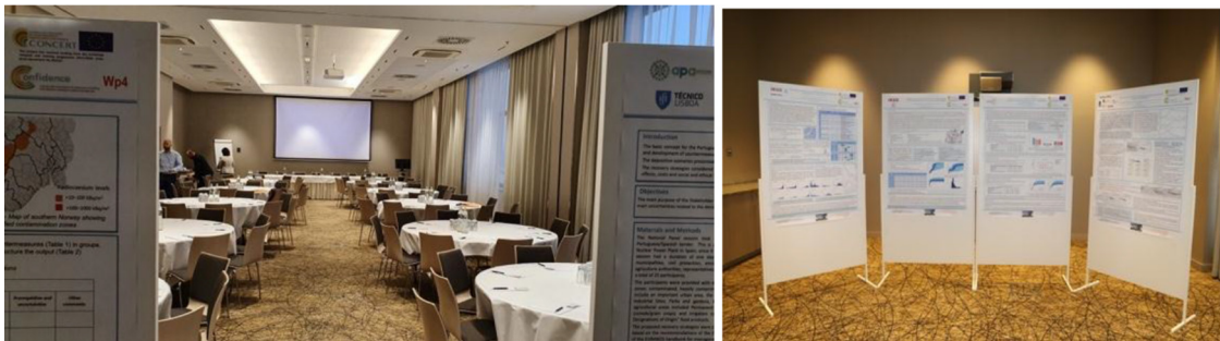
Fig. 3. Dissemination workshop facility.

discussions based on the deliverables of the CONFIDENCE project and adapted to the audience's need and wishes with focus on questions: