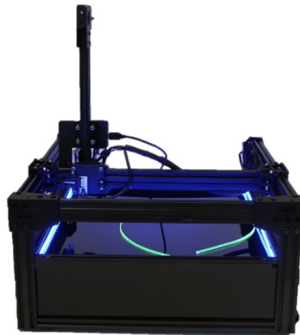
The assembled imaging robot. © 2020 Sophie Jegouic. Licensed under CC BY 4.0

Our Biomedical Technology Lab builds simple low-cost solutions for current and future healthcare problems. These include point-of-care bioassay devices to test for antimicrobial resistance and help tackle antibiotic overuse. Traditional microbiology methods are slow, so we developed a smaller and faster version using microcapillary films where visual cues, such as colour changes, could detect bacterial growth. Because these films cannot be imaged by commercially available readers, we built our own imaging system using the frame of a 3D printer as the base. Our aim was to create a solution that was accessible for other researchers wanting to implement similar systems, and adaptable to a wide range of imaging requirements.