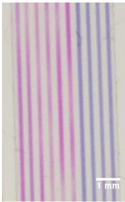
An image of the colour change in a microcapillary indicating bacterial growth