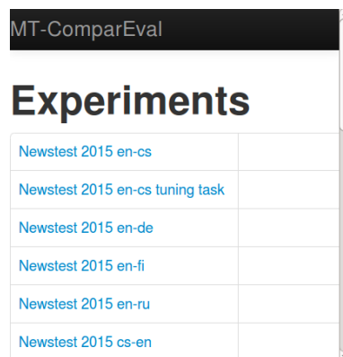
Figure 1. Part of the start-up screen of the evaluation panel with a list available experiments at wmt.ufal.cz .

Once the user selects an experiment, an evaluation table with all relevant tasks (Figure 2) is shown. The table contains (document-level) scores for each task entry calculated by (a selected subset of) the included automated metrics. The panel also includes a graphical representation to monitor the improvement of the scores among different versions of the same system. 6 The metrics currently supported are Precision, Recall and F-score (all based on arithmetic average of 1-grams up to 4-grams) and BLEU (Papineni et al., 2002). 7 MT-ComparEval computes both case-sensitive and case-insensitive (CIS) versions of the four metrics, but the current default setup is to show only case-sensitive versions in the Tasks screen. Users are able to turn the individual metrics on and off, to allow for easier comparisons.