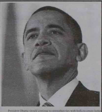
Obama should continue to strengthen fies with India to create bette economic and educational opportunities .

dents sent to the United States. There are many bright minds on both sides that would be more than willing to cross over and learn new methods and ideas. Only with the establishment of stronger ties and with larger and improved fellowship programs