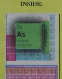
Science Discoveries Page 3

"UCompost" is continued to Features, page 5