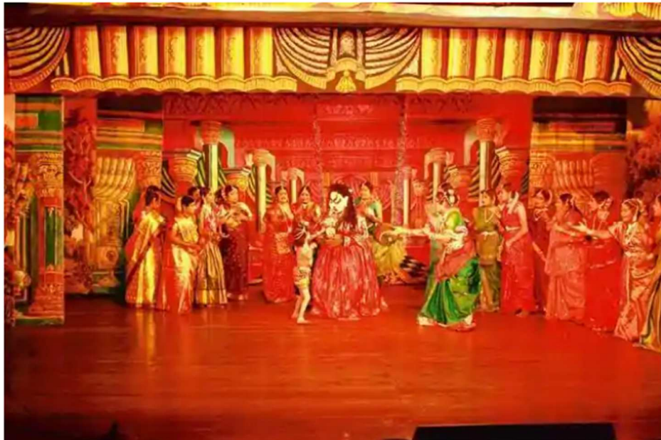
B. Production photo from the play Sri Krishna Leelalu.