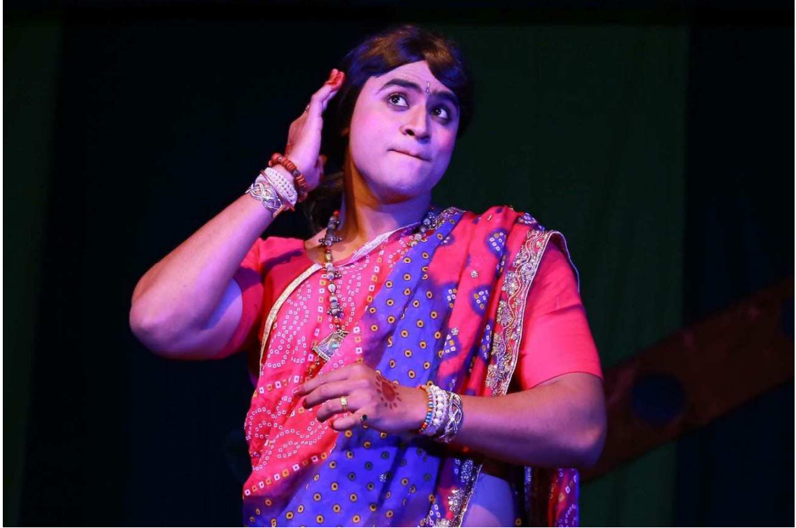
Picture from the play Being Eunuch .