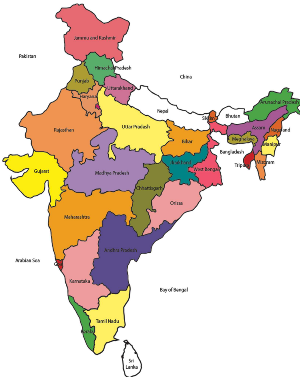
India Map. Web. 4 Apr. 202