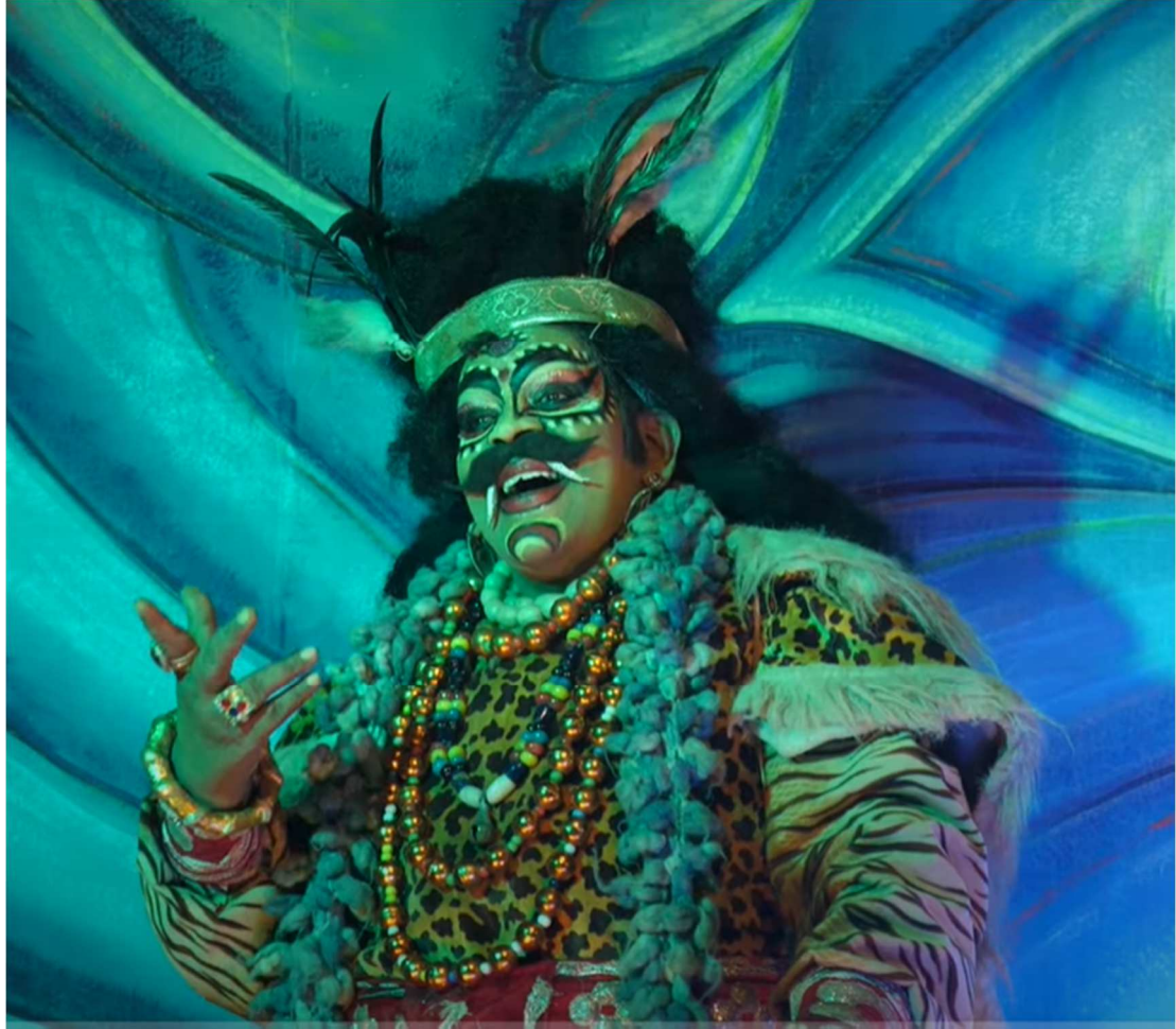
Picture of “Gototkhacha” from the play Mayabazaar .