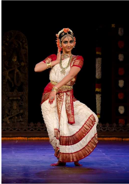
A. Kuchipudi Dance form. Web. 4 Apr. 2020