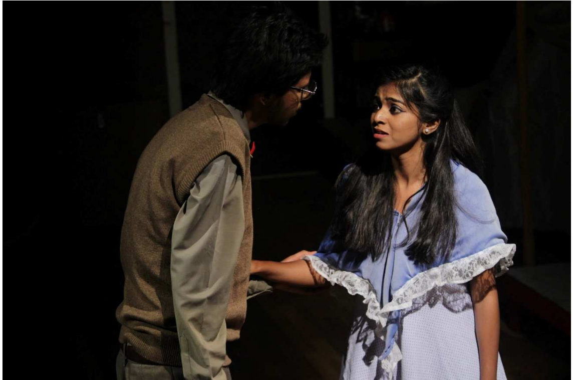
Picture from the play The Cherry Orchard .