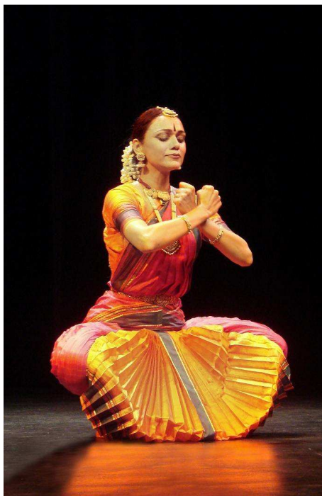
B. Bharata Natyam Dance form. Web. 4 Apr. 2020