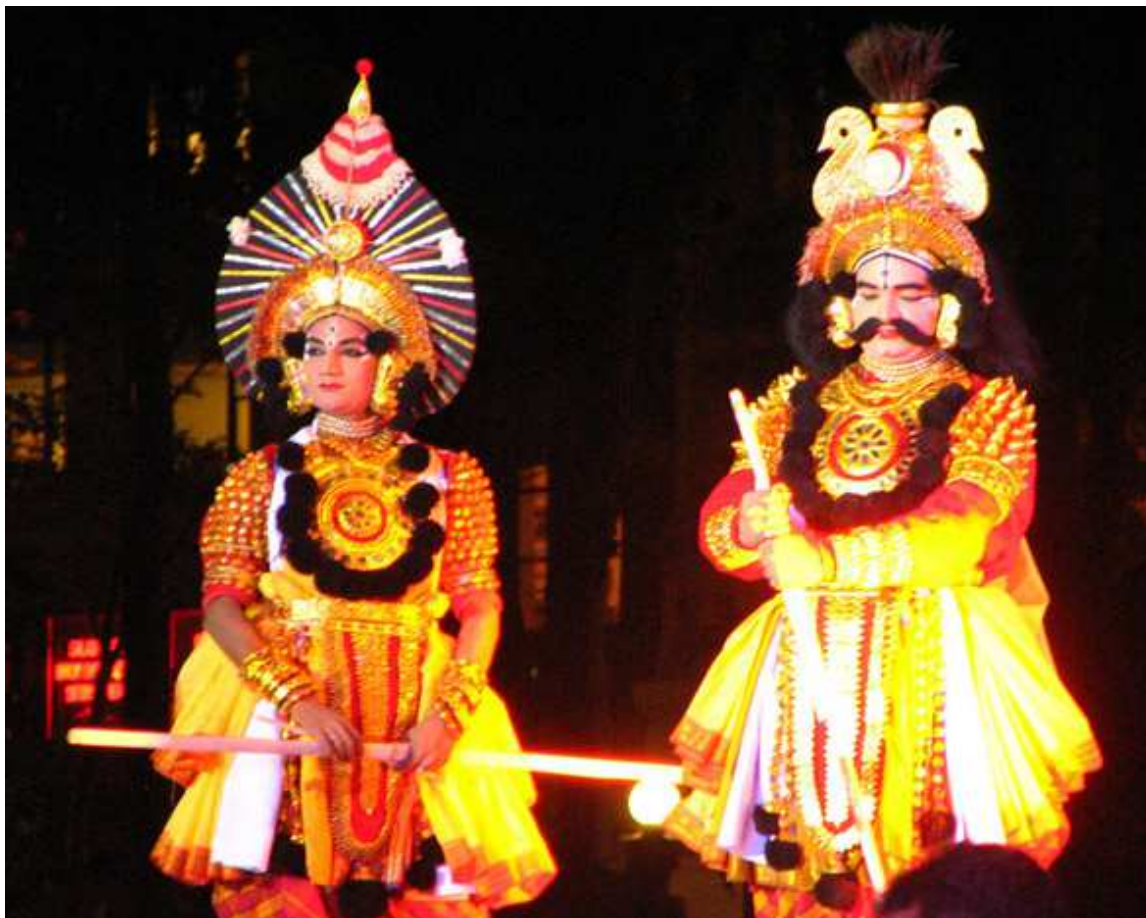
Yakshaganam Dance form. Web. 4 Apr. 2020