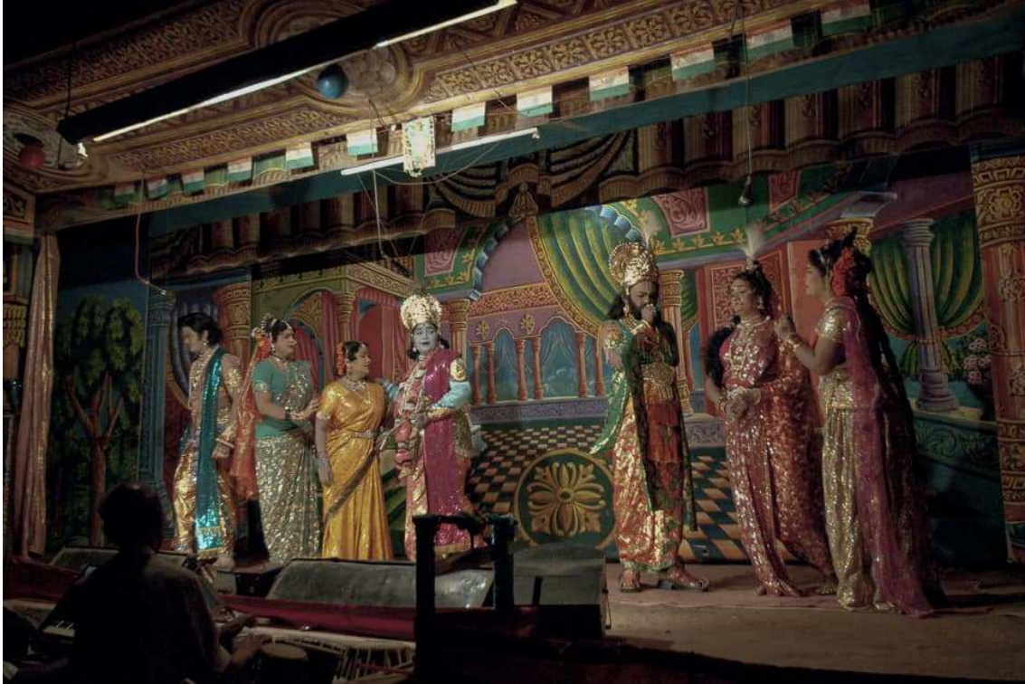
Picture from the play Sri Krishna Leelalu.