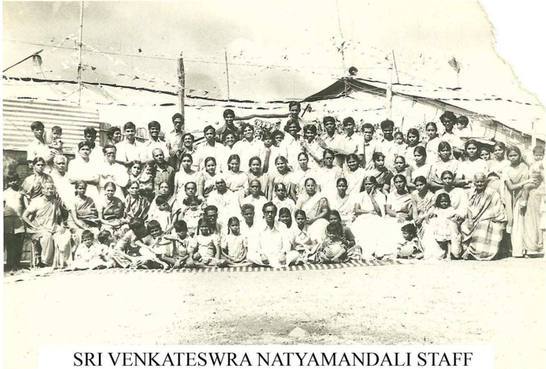
SRI VENKATESWRA NATYAMANDALI STAFF

An old photo of Surabhi family.