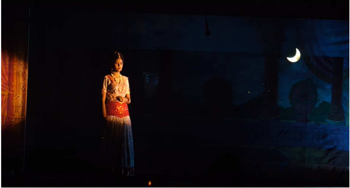
Production photo from the play Mayabazaar .