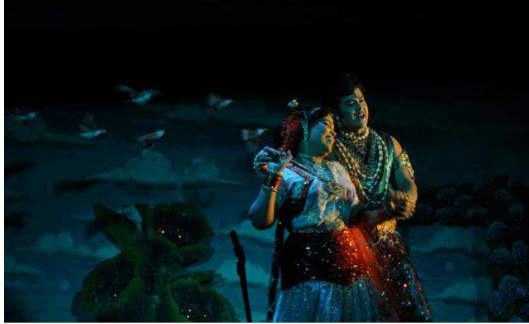
A. Production photo from the play Mayabazaar .