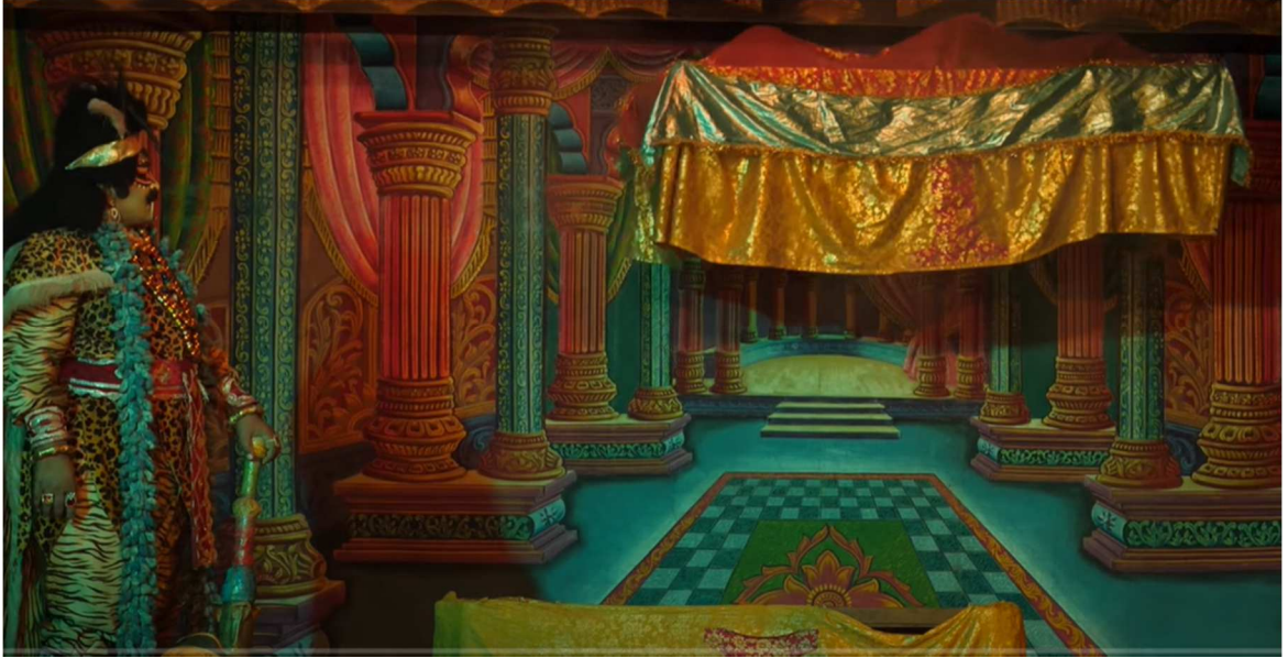
Flying mattress in the play Mayabazaar .