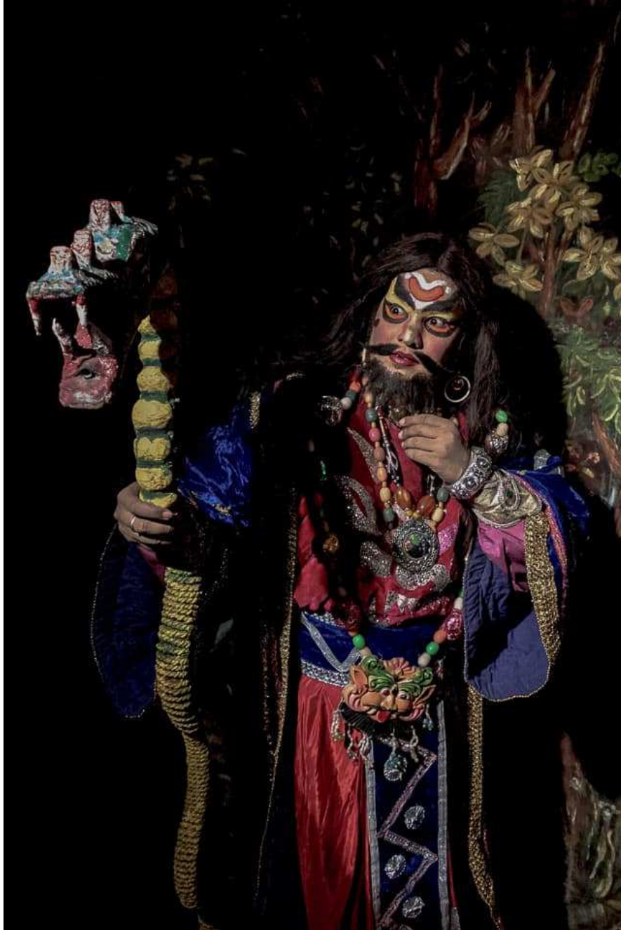
Makeup and Costumes of an antagonist in a Surabhi Play.