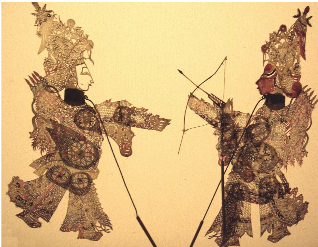
Shadow Puppets in the play Ramayana . Web. 4 Apr. 2020