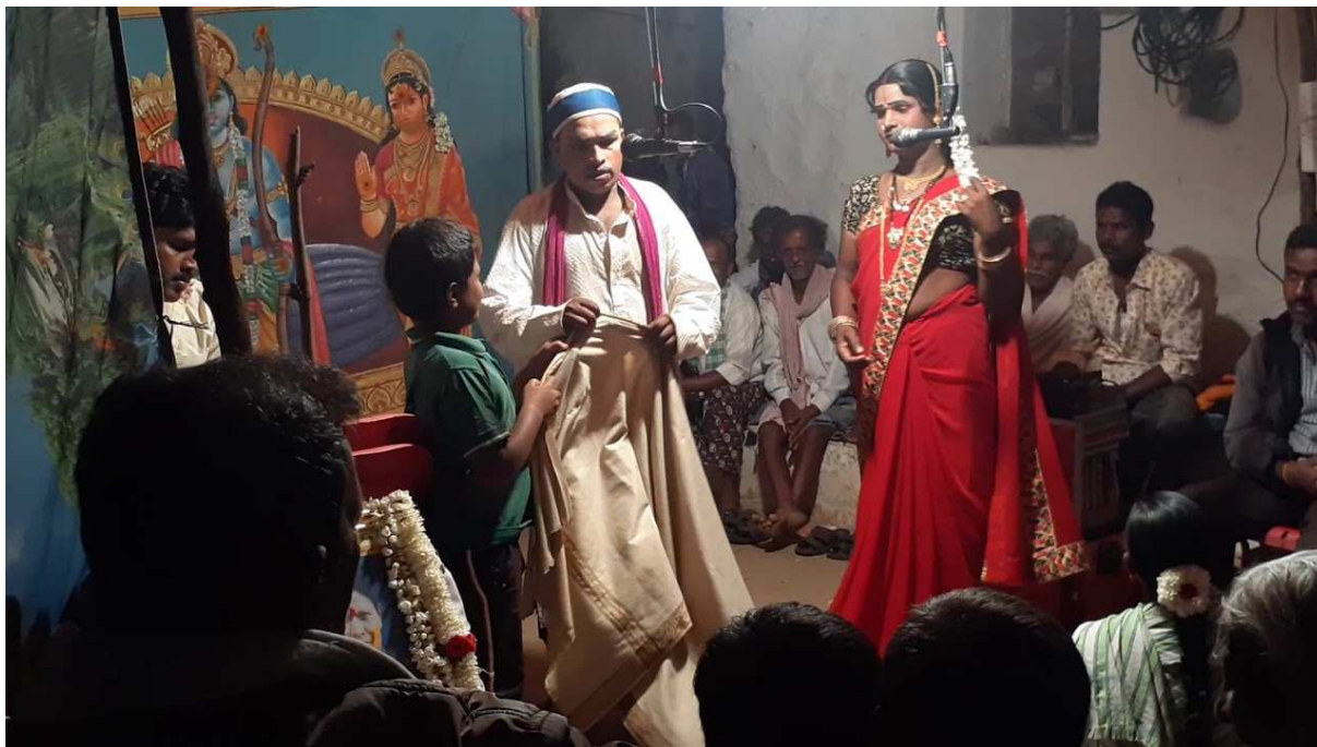
Street Theatres in Village. Web. 4 Apr.2020