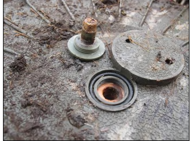
AT mines were examined and then defuzed in the minefield. The condition of detonators was noted