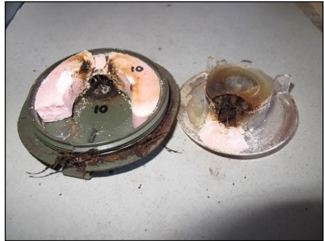
Examination revealed that the detonators had exploded, but failed to initiate the main charges