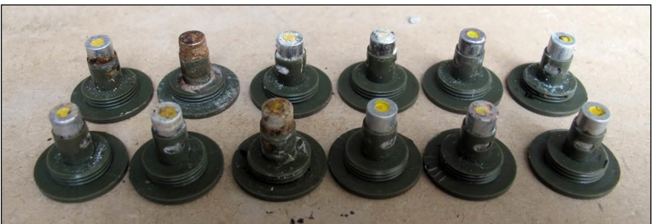
Detonators from the SB-81 mines, some of which show signs of deterioration

Most detonators appeared to be in good condition; however, some had white crusting (probably aluminium oxide from the detonator capsule) while others had a brown gelatinous exudation from the stab receptor.