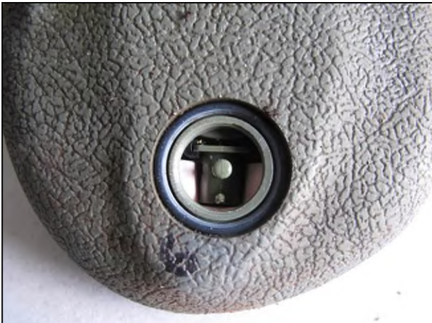
An SB-33 detonator plug removed to reveal the detonator still in position, impaled on the firing pin

The presence of the firing pin in the stab receptor of the detonator is a major and unexpected hazard, since further movement could cause initiation. During disarming, the detonator is withdrawn from the mine body at right angles to the firing pin, meaning that the two components scrape together. If the detonator is still active, this could initiate the mine in the hands of the deminer.