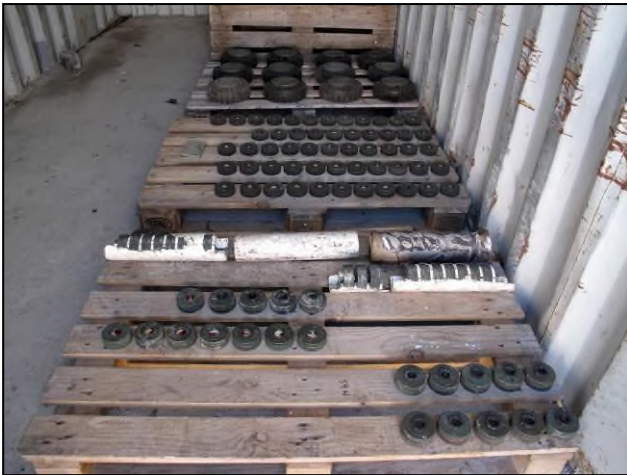
Storage of recovered mines