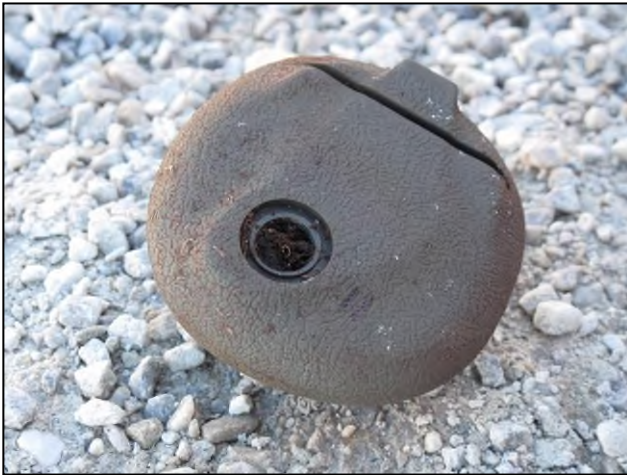
Several SB-33 mines had detonator plugs missing and were initially assumed to be unarmed