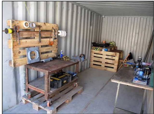
The APB was basic but functional

The following sequence of events was then followed ( Annex B ):