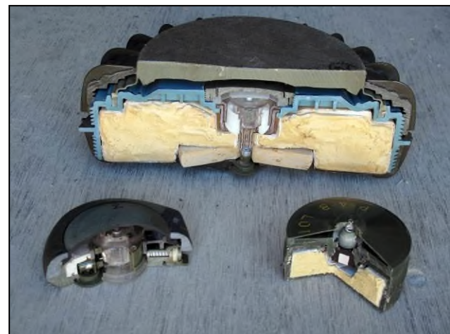
Sectioned models were made for each mine type