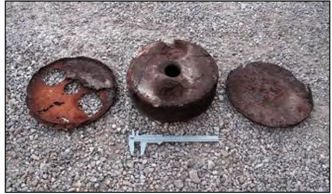
A 'new' mine type was identified