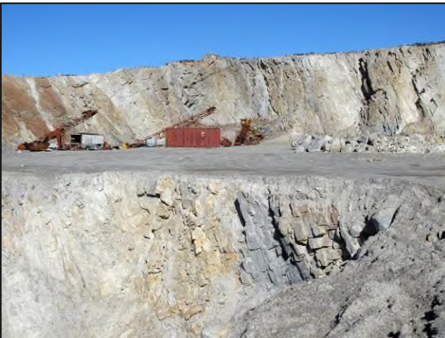
The APB was established in a disused section of the quarry at Pony Pass

Exploitation was carried out in a remote area of the quarry at Pony Pass, adjacent to the site used for the destruction of mines by burning. Access to the area was controlled to minimise the risk during the disassembly process.