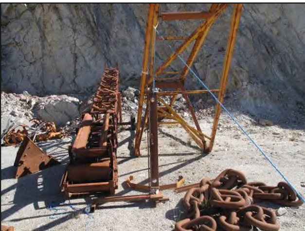
The explosive test rig used a rope and pulley to lower a girder onto the mine fuze

P4B fuzes, complete with detonators, were placed between two blocks for actuation. In order to test SB-33 and SB-81 detonators, SB-81 fuze mechanisms were reassembled and detonators attached; the assembly was then placed in an adapted SB-81 casing. The number of tests that could be conducted this way was limited because the fuze was destroyed each time a detonator functioned.