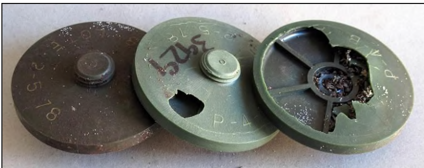
A range of degradation was present among P4B fuze casings

Any corrosion of the striker spring reduces its metallic mass and makes it even less detectable.