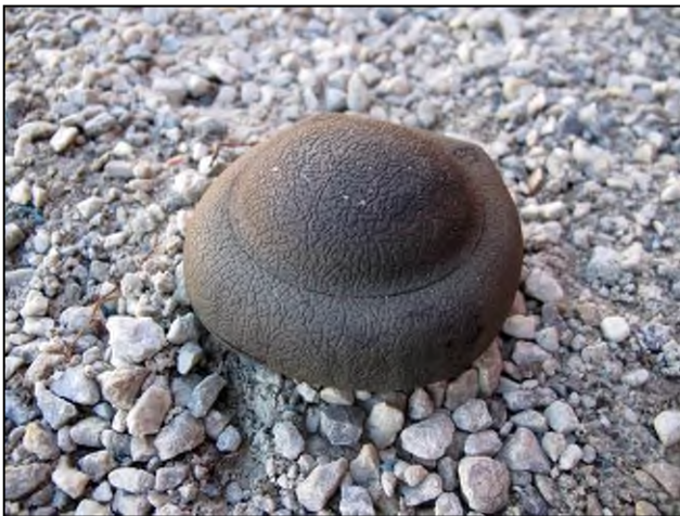
The rubber domes on the SB-33 mines have swelled and allowed some moisture to enter

Moisture was also present in most of the SB-81 mines, despite the integrity of the rubber pressure plate. The SB-81 fuze is actuated pneumatically, so the seal and flexibility of this plate are critical to its function; both aspects appeared to be unaffected in the mines examined 3