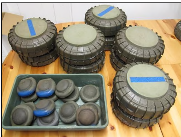
A number of mines were reassembled, inert ('FFE')