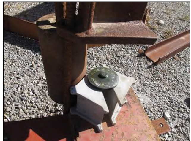
A P4B mine fuze placed on the test rig, ready for the girder to be lowered