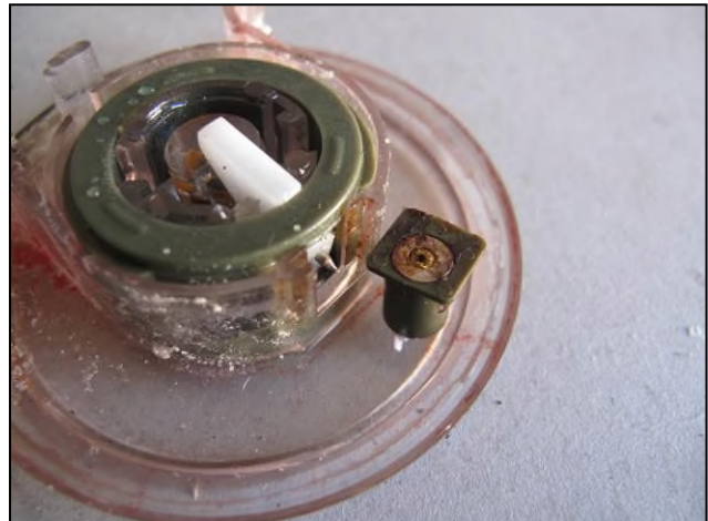
An SB-33 disassembled, showing the pin in the fired position and a hole visible in the detonator

A further 4 mines were recovered with no detonator plugs present. It was initially assumed that these mines had been laid unarmed, without plugs, but examination showed that all had been actuated.