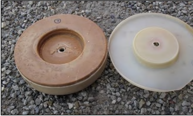
SB-81 charge were retained for demolition