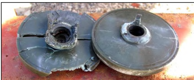
Results from P4B detonator testing. The fuze on the left was one of the few that detonated fully; the one on the right barely had the energy to break the housing and would not have detonated the main charge

Out of those that exploded, the majority produced a weak effect that would probably fail to propagate to the main charge. In other words, actuation of mines in this category would be unlikely to cause injury.