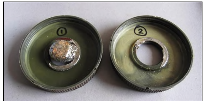
View of the foils from the inside of the casing