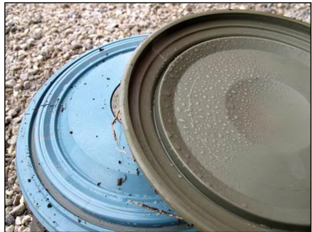
The pressure plates (right) of the SB-81 mines were in good condition; most were wet on the inside