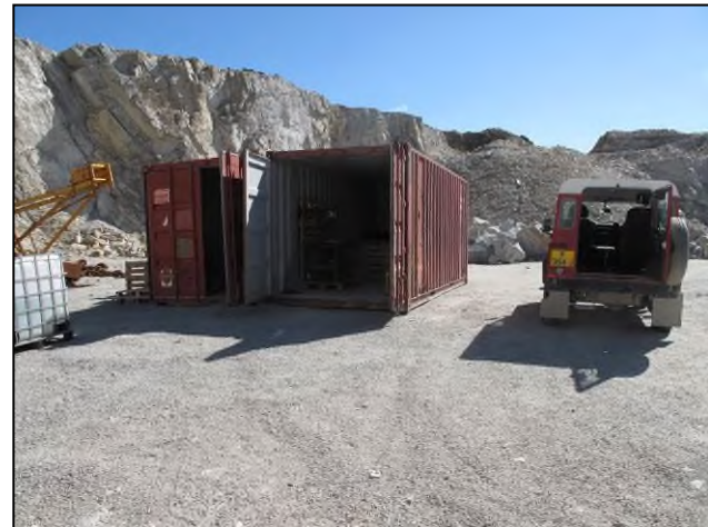
Explosive storage was in the left hand container, with the APB to the right

Two Iso containers were positioned side-by-side. One was used for the storage of recovered mines and fuzes (the assemblies being safely separated from one another). The other container was converted for use as an Ammunition Processing Building (APB).