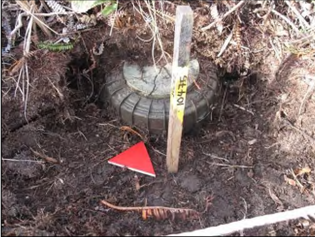
SB-81 mines were located and partially exposed by deminers, then recovered by CK

AT mines were located, identified and partially uncovered by the deminers, but left in place. CK photographed each mine in position before fully uncovering and lifting. The mines were then assessed to establish that it was safe to disarm them, and were defuzed inside the minefield.