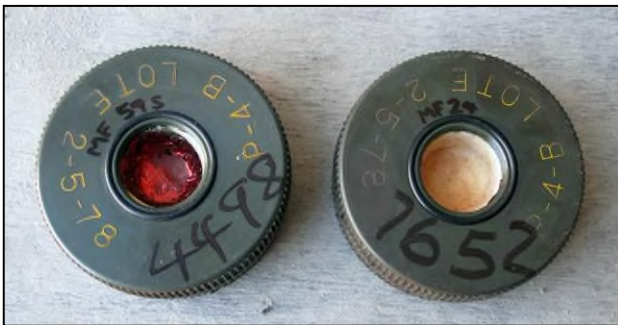
Variations in the foil covering the main charge

The foil is installed in the P4B body as a flat disc, but is broken when the fuze is fitted. In most cases, the foil ruptures in several places, creating 'fingers' that protrude into the fuze well. In some examples the foil remains virtually intact, while in others a portion is absent, but every P4B mine examined (including previous phases) has had some foil present.