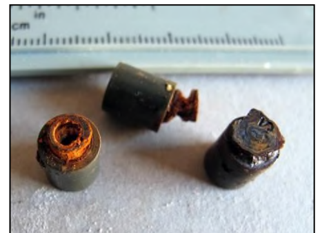
Many springs were corroded