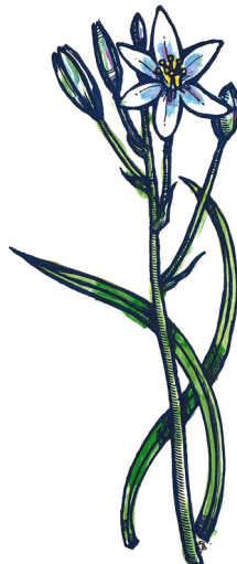
Star of Bethlehem