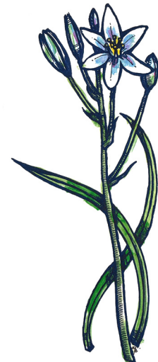
Star of Bethlehem