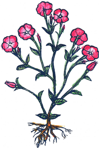
Our Lady's Rose