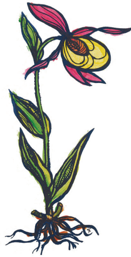
Yellow Lady Slipper