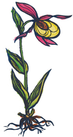
Yellow Lady Slipper