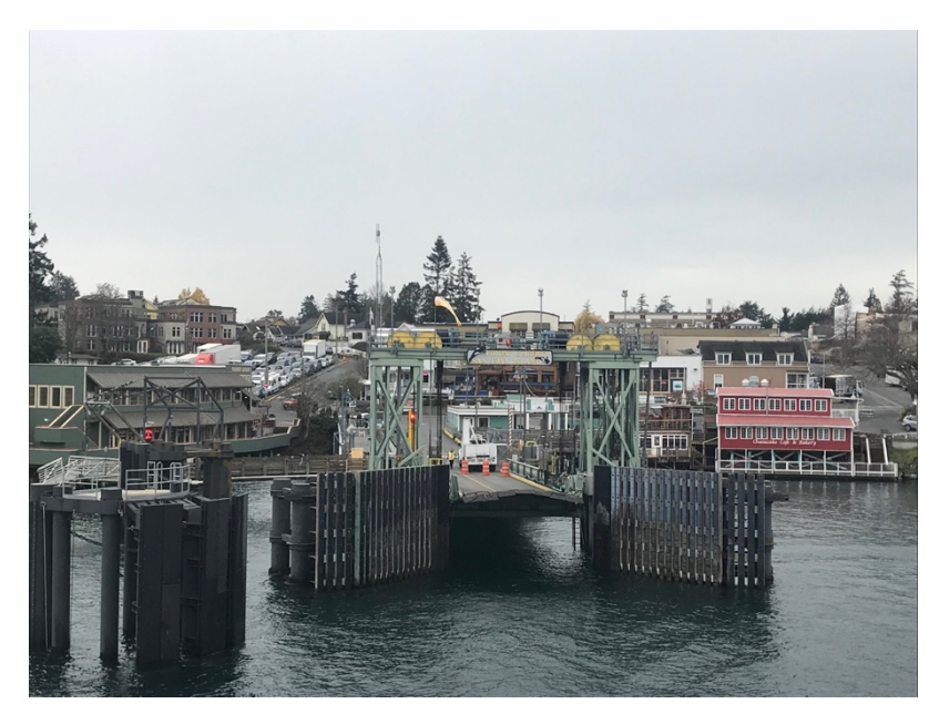
FIG. 3: SIDNEY, BC-ANACORTES, WA FERRY STOP (FRIDAY HARBOR, U.S. SAN JUAN ISLANDS)

Several people also said that they do not want to cross the border often because of border bureaucracy, customs issues, waiting times, or other obstacles due to administrative/legislative differences. Also, disagreement with President Trump's (environmental) politics was named as a reason for less cross-border travel.