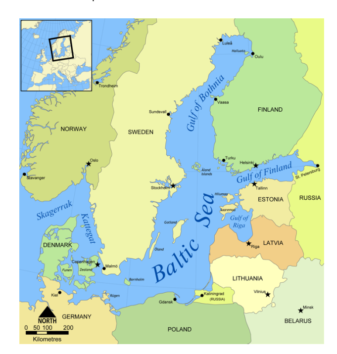
FIG. 5: BALTIC SEA

The region is special also for the very different backgrounds of the states in the basin — just 30 years ago the Baltic Sea was divided by the so-called Iron Curtain between the Soviet Union (and its satellite Poland) and the "West." There are "old" established democracies such as Germany, Denmark, Sweden, and Finland, as well as new EU countries like Estonia. Latvia, Lithuania (which re-gained its independence in 1991) and also Poland, which all have nascent civil society experience. At the same time, in Russia, democratic efforts towards are more open society have faced ongoing threats and challenges during last decade. For example, Freedom House rates Russia's civil liberties at 6 points and the other Baltic Sea