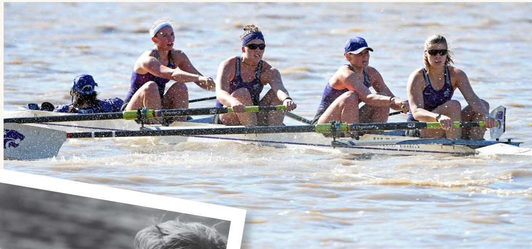
Above: K-State Rowing team competing in the 2018 Jayhawk Jamboree.