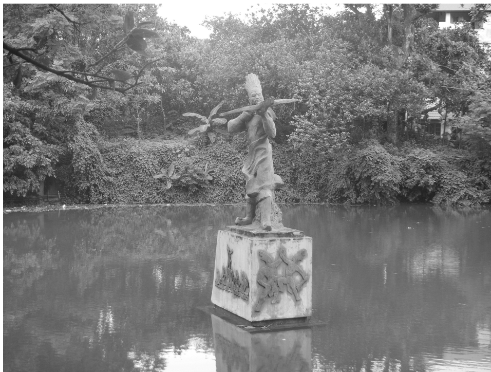
Fig. 6. Photograph of the Cao Lo statue at the Co Loa site. Cao Lo purportedly furnished King An Duong Vuong with a powerful and innovative crossbow trigger mechanism.

of Co Loa to formulate and maintain centralized power, thus using both physical and ideological constructs as political strategies. Essentially, Co Loa's uses in defense and politics made the site a landscape and symbol of power, aiding in the production of legitimized authority.