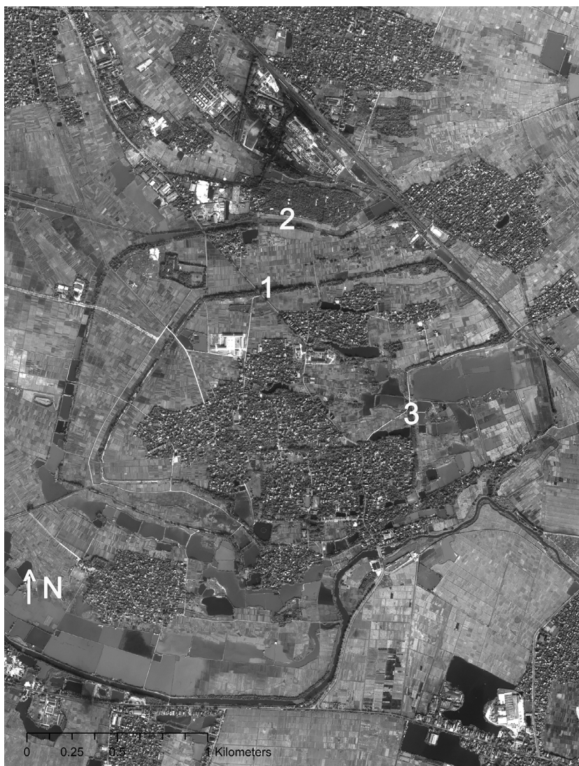
Fig. 1. Satellite photograph of the Co Loa site. Also marked are the locations of the recent excavations and of the bunker dug into the middle rampart enclosure. 1: middle wall excavation (2007–2008); 2: outer wall excavation (2012); 3: location of bunker.

ture lay on sterile subsoil and consisted of a clay wall and a clay platform with an associated structure and ditches. This set of features appeared to be architecturally unrelated to the larger rampart that followed. These early features may also have been defensive, though on a much smaller scale. Dongson Culture artifacts and radiocarbon determinations suggest this smaller set of features was put in place sometime between the fifth and third centuries B.C. The stratigraphic evidence suggests a period of dereliction followed. The presence of possible defensive features constructed by a smaller-scale society before the emergence of the Co Loa polity suggests that the militarization