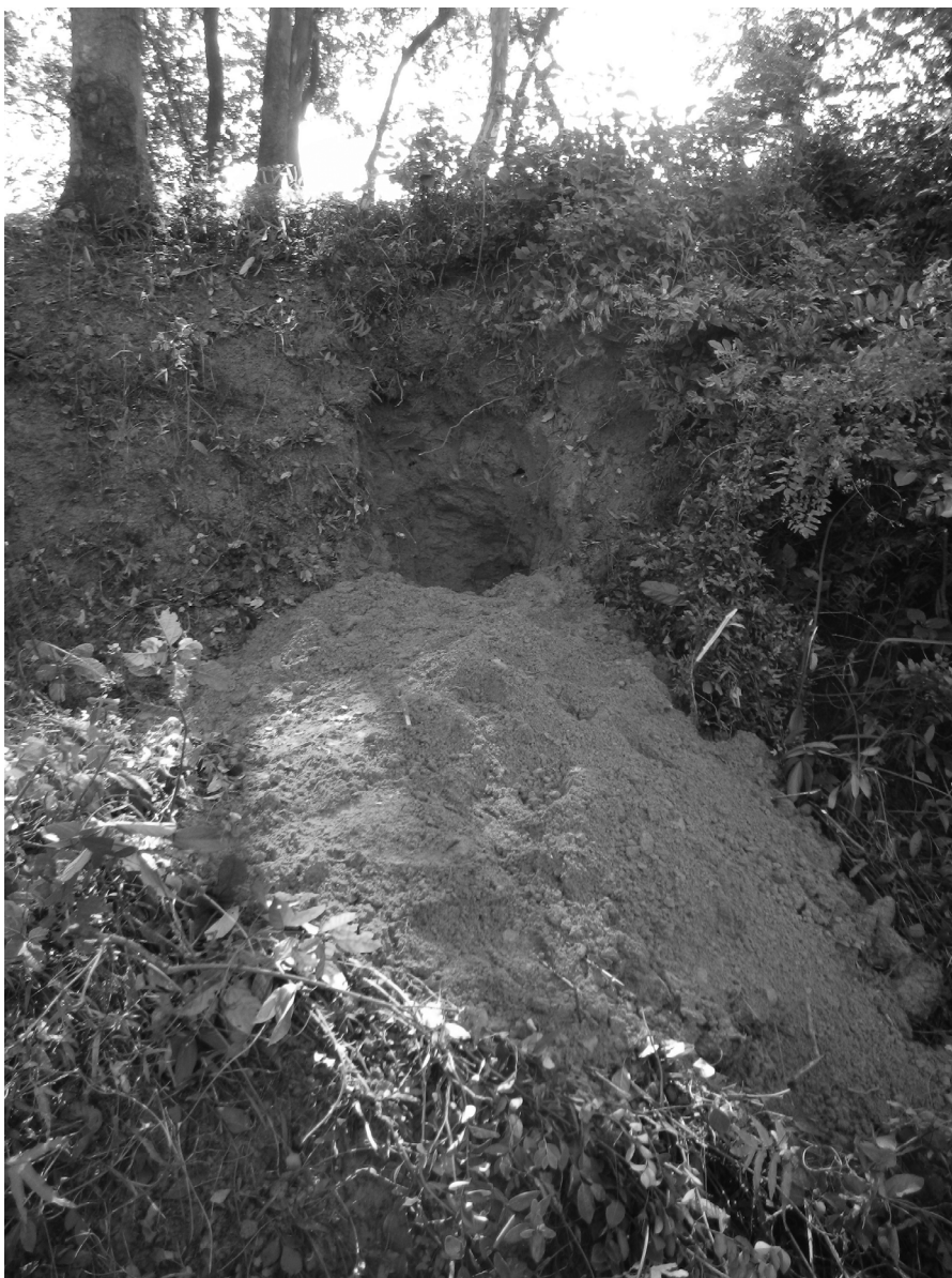
Fig. 5. Photograph of the collapsed portion of the middle enclosure where a bunker was dug by Vietnamese soldiers approximately forty years ago.

that sense, the locale was probably viewed as what Hill and Wileman (2002: 14) refer to as sacred or ancestral space, thus at least partially accounting for its selection as a capital site.