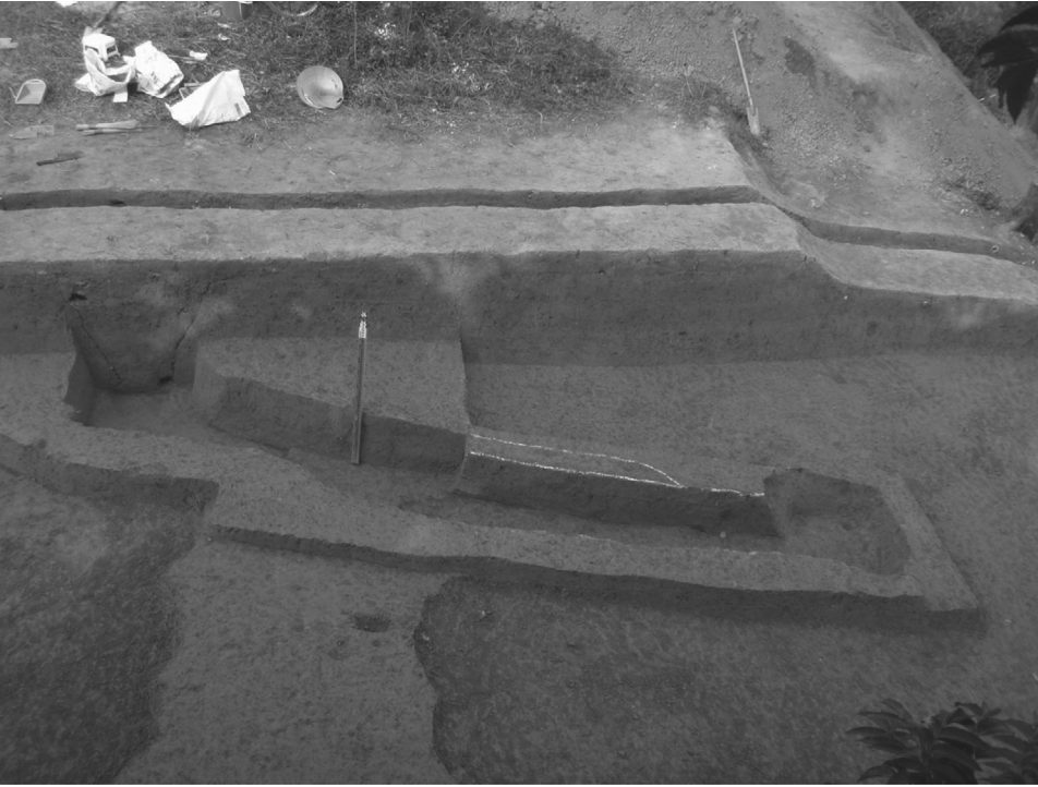
Fig. 4. Photograph of the slit trench from above, facing west. The slit trench enters the excavation trench and moves toward the north before ending.

patterns of political and historical change centered in the region reveals how a militarized landscape can reflect shifting patterns of cultural significance, specifically in how it impacts leadership strategies and political regeneration.