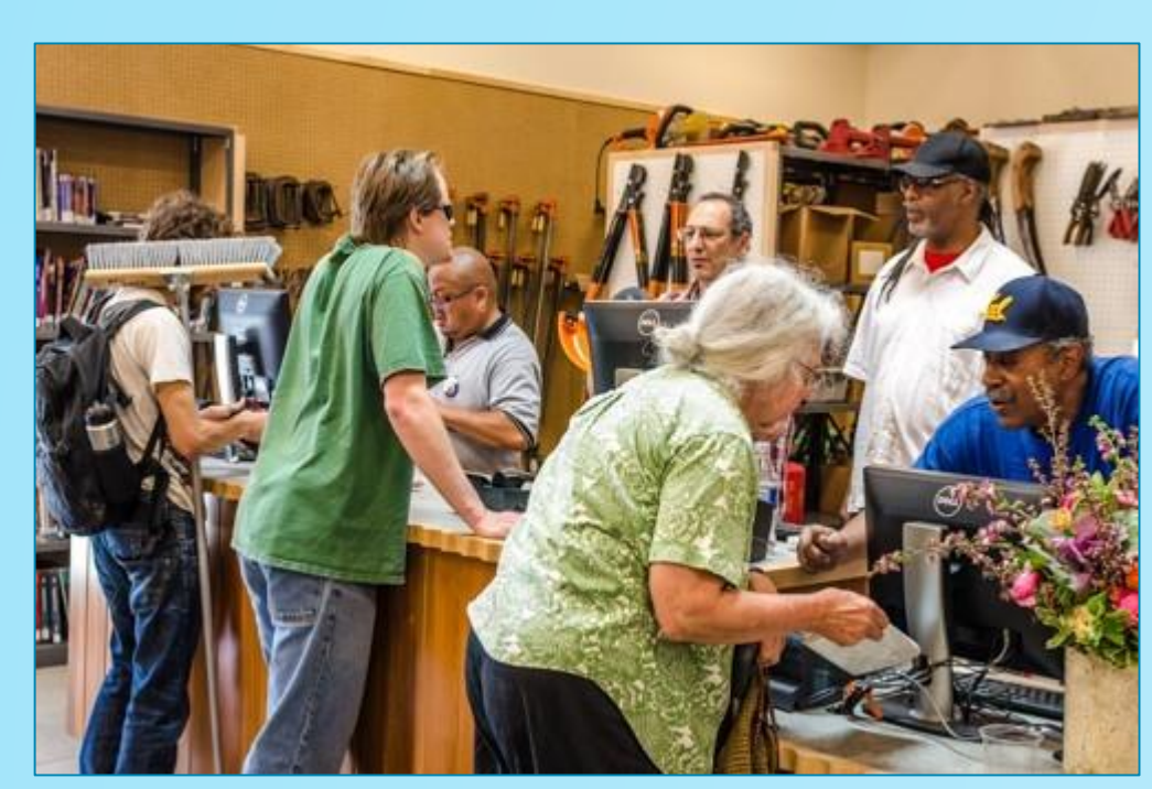
• Established in 1979 with a $30,000 federal Community Development Block Grant

Started with 500 tools, a portable trailer, and one full-time employee