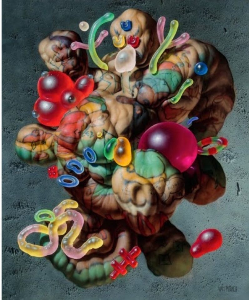
Figure 11. Shitstorm Genie . 2018. Oil on linen by Christian Rex van Minnen

In this respect I find sympathy with the work of contemporary American painter Christian Rex van Minnen (figure 11) whose paintings emulate Dutch 17th century master genre painters in their vibrant luminosity and tangibility. Riffing on floral still life and portraiture themes he dazzles the viewer with an array of textures and colors - of wrinkled flesh marked with fading tattoos and fresh razor blade slits, lush hair adorning mutated and mutilated heads, jewel-like gummy candies, fabric, leaves, meats, organs and turds. His masterful paint technique belies an almost confessional sense of violence and perversity coalescing in a finely tuned tension of attraction and repulsion.