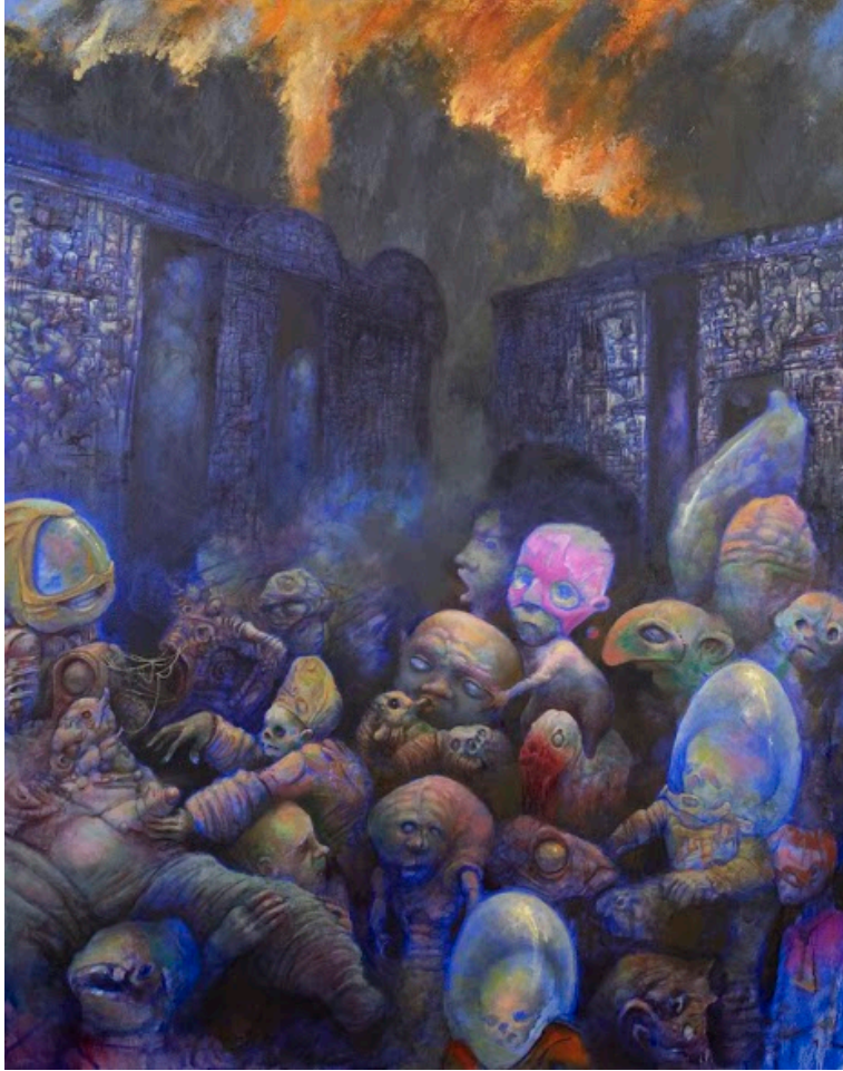
Figure 14. Cleft . 2019. Oil on canvas by Nicholas M. Raynolds

in this context, they serve to integrate another time frame or incident into the otherwise singular view of the painting/picture plane itself.