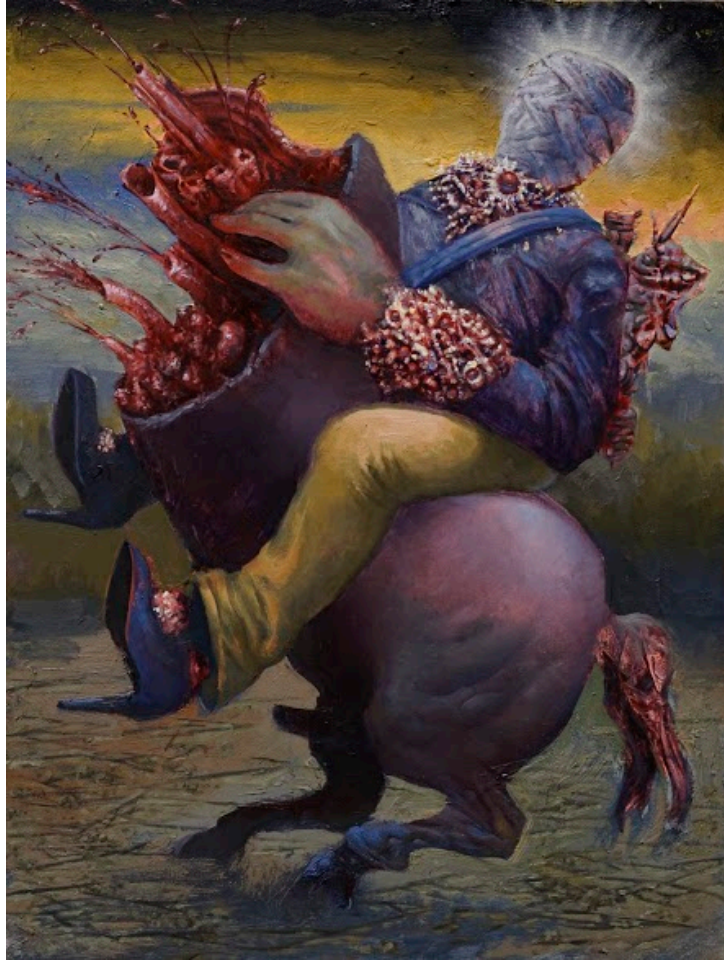
Figure 6. Equestrian Portrait . 2020. Oil on panel by Nicholas M. Raynolds

These two figurative works were mined from my own automatic explorations having found resolution through an improvisational and interpretive working method. Though narrative in sensibility, they more accurately reflect an assemblage of arbitrary elements whose cumulative effect resembles or mimics an intentionality. In 'Equestrian Portrait', a rider in the garb and trappings of some fantastic aristocrat, sits astride a sturdy horse. Though rearing up, the poor creature instead of making a bold lunge, sits stolid and paralyzed, its front end an exotic bloody stump pumping gore like some visceral fountain. The glorious halo around the rider's head radiates despite his less than holy visage which is obscured by the malformed wrapping of bandages. His oversized hand gently washes itself in the horse's wound, while his impractically stilettoed boots stab forward in a menacing attitude echoing the shadowed member of his impassive steed.