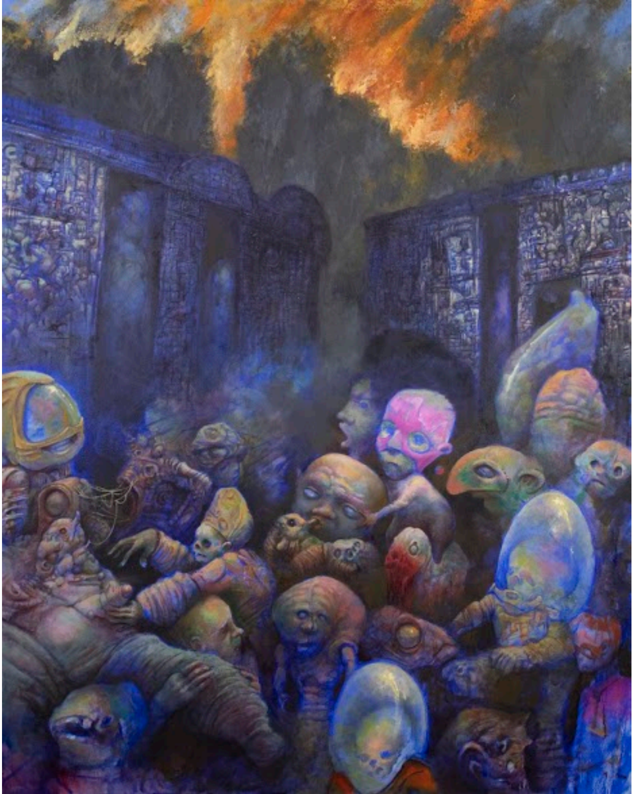
Cleft Oil on Canvas, 59"x47" 2019