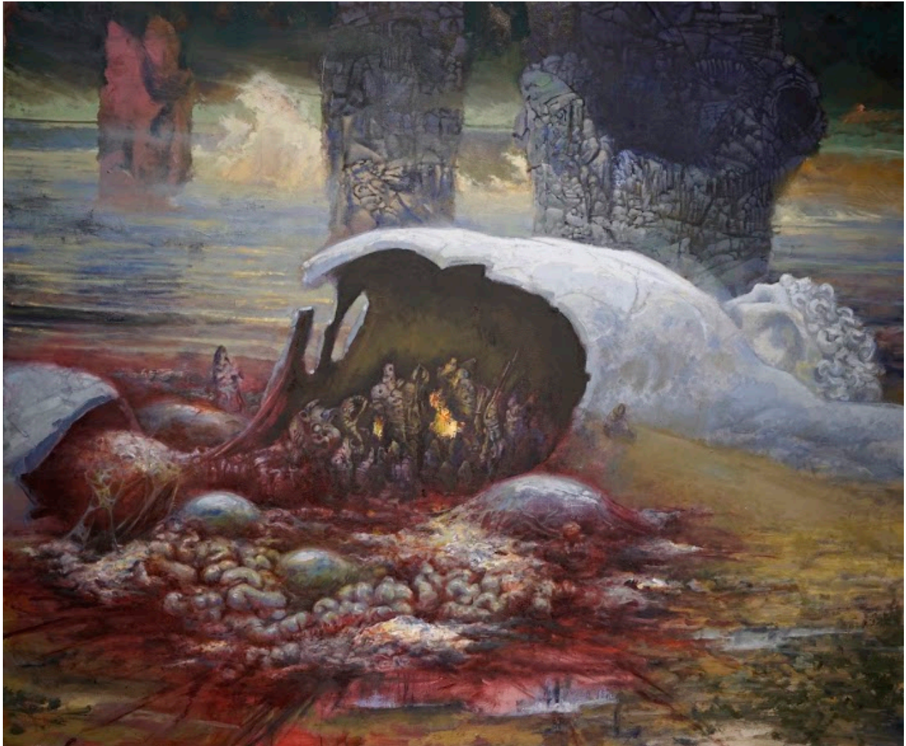
The Drowned Giant Oil on Canvas, 60"x72", 2020