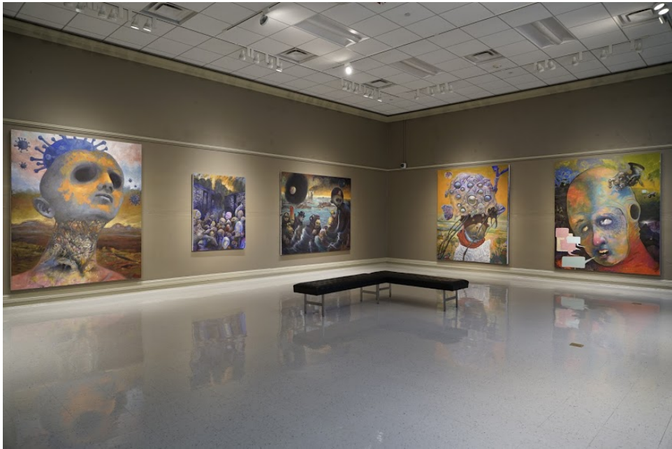
Installation View of the emotional plague