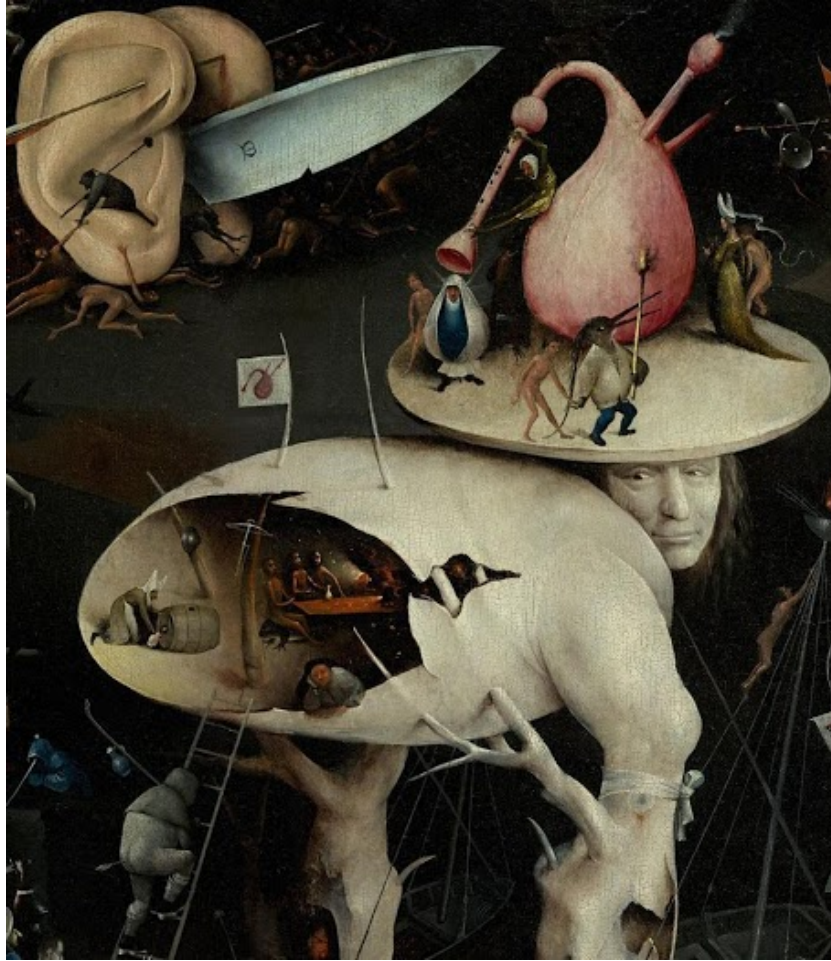
Figure 20. detail of The Garden of Earthly Delights. 1490-50. Oil on oak panel by Heironymus Bosch

The creatures that have taken up residence in the giant's carcass stand around fires which cast shadows on the walls behind them as though in Plato's 'Allegory of the Cave' (Plato). In embellishing my picture with classical iconographies I've considered this figure as analogous to the sculpture of "River God of the Nile" (figure 21) in the Vatican in Rome, and in so doing to the classical canon.