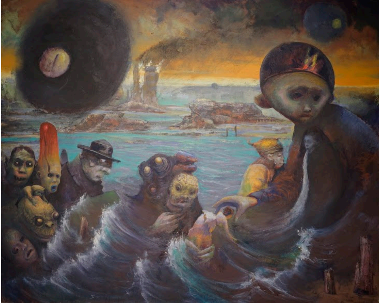
Roadside Picnic Oil on Canvas, 75"x93" 2019