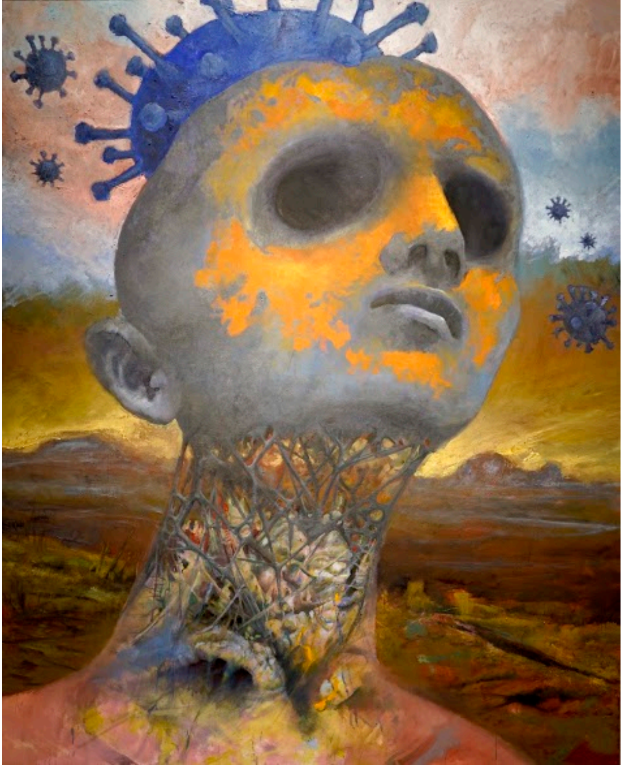
Corona; Hail to the Thief Oil on Canvas, 93"x75", 2020