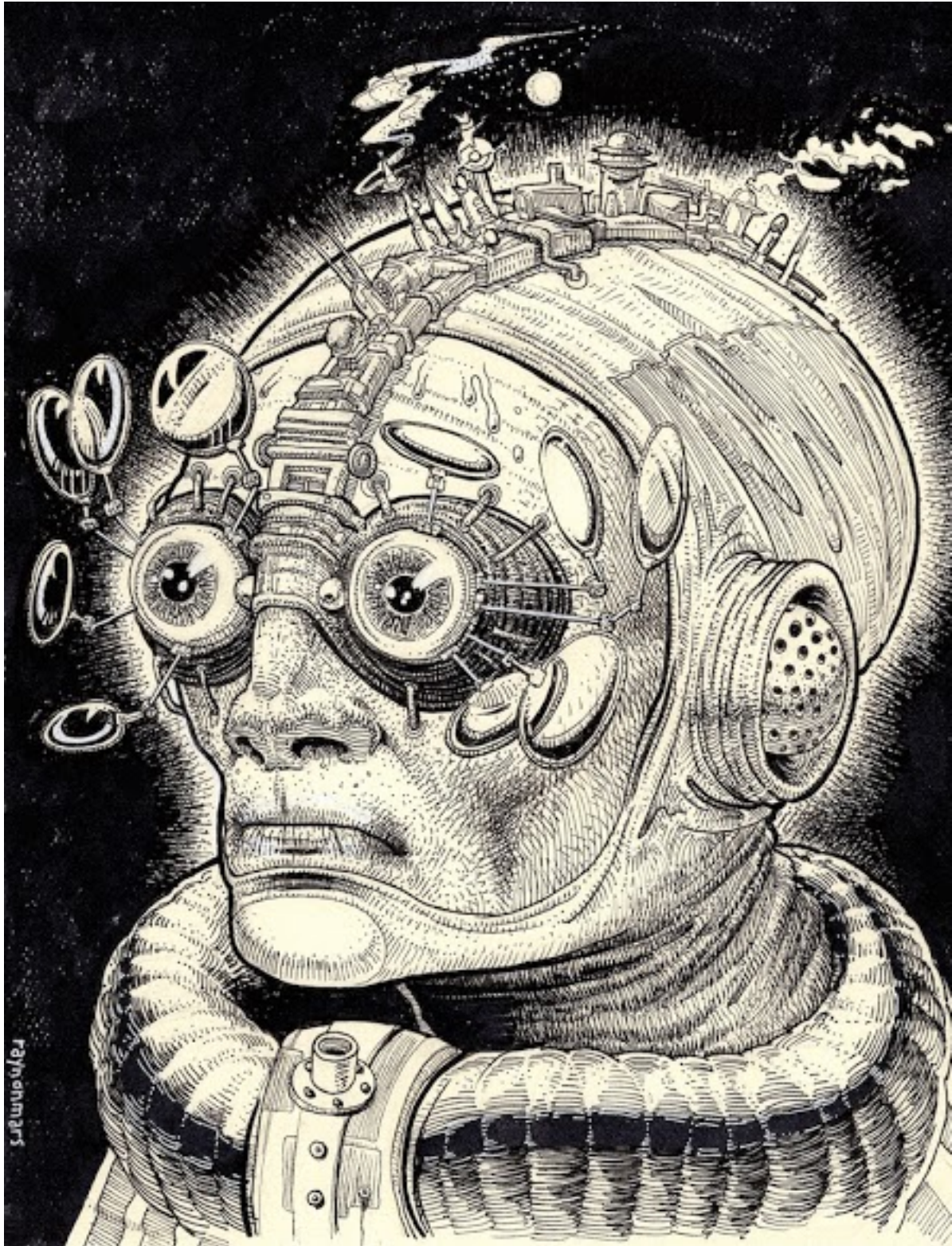
The Scrutinizer Pencil on Paper, 11"x8.5", 2020