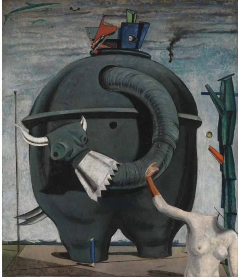
Figure 5. The Elephant Celebes .1921. Oil on canvas by Max Ernst

cylinders and tubes in front of which she stands. The ambiguity of the image generates a confounding agitation in that we seek out a narrative of sorts but are endlessly thwarted from discovering a resolution. The elements of the painting function as abstract components. Using recognizable elements like this and arranging them according to aesthetic terms instead of by linear, literary, narrative methods reiterates the idea of ‘narrative abstraction’. Two of my paintings that reflect the direct influence of Max Ernst are “Equestrian Portrait” (figure 6) and “Fire Starter” (figure 7).