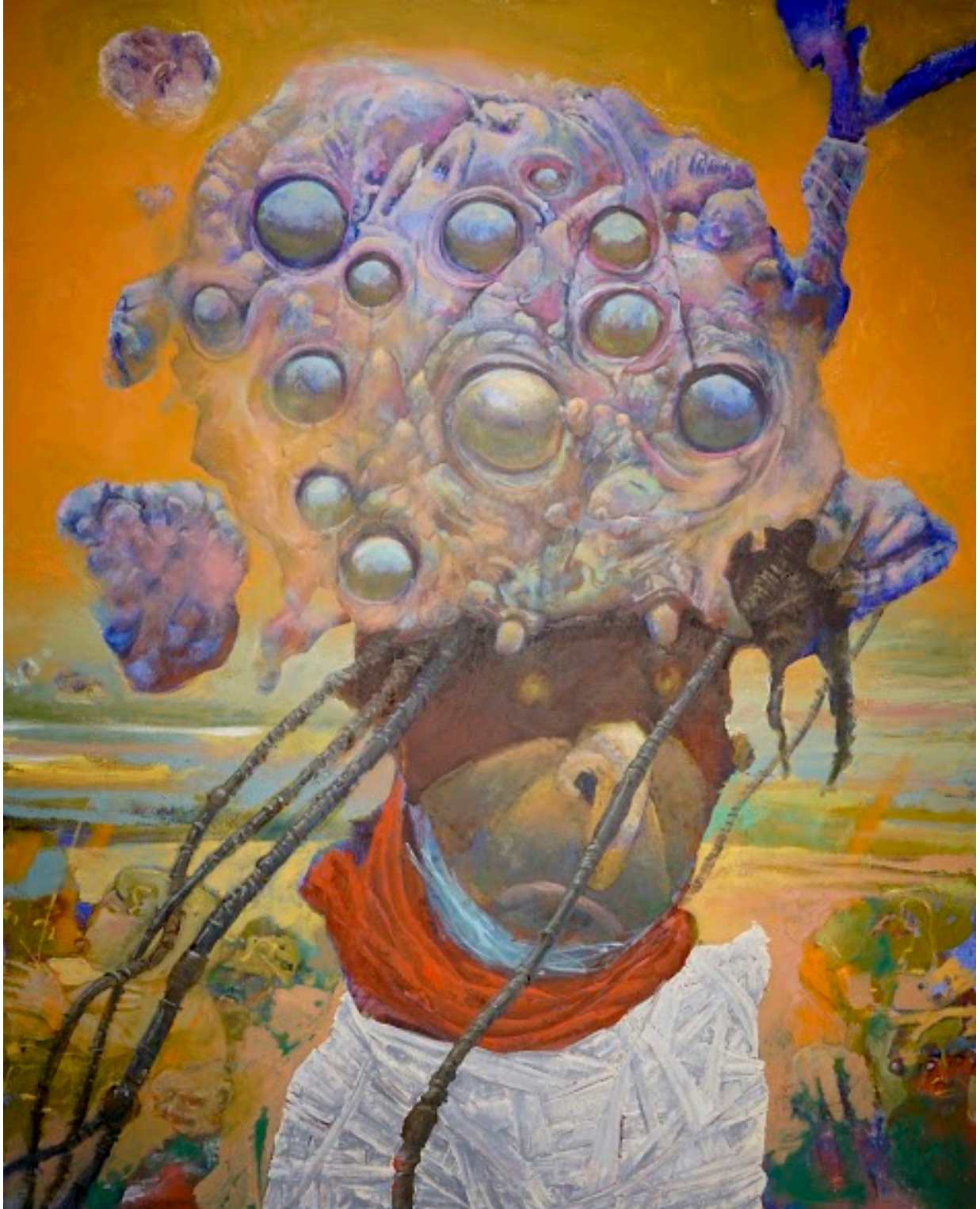
Homo Algorithmicus: The Hackable Man Oil on Canvas, 93"x75" 2019