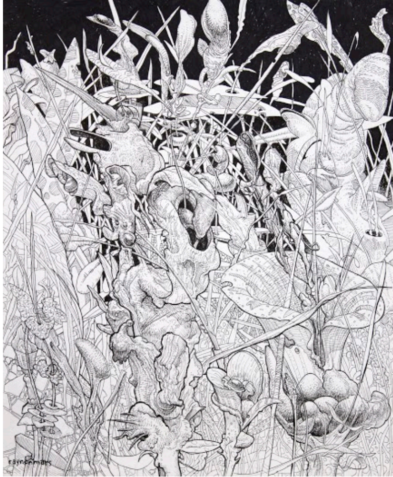
Figure 13. Plague Flowers. 2018. Pen and ink on paper by Nicholas M. Raynolds