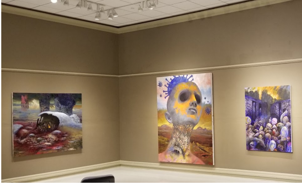
Installation View of the emotional plague