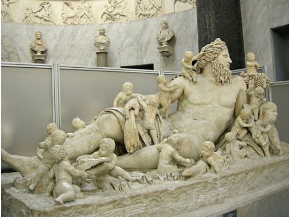
Figure 21. The Nile . Date unknown. Marble artist unknown