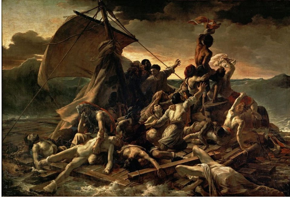
Figure 1. The Raft of the Medusa . 1819 Oil on Canvas by Theodore Gericault