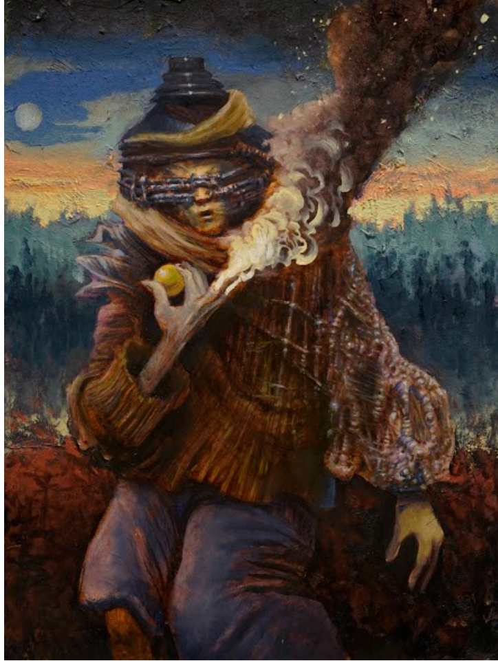
Figure 7. Fire Starter . 2020 Oil on panel by Nicholas M. Raynolds

'Fire Starter' on the other hand, presents a strangely clad figure striding across the desolation of a once treed landscape. Turning slightly towards the viewer, the figure reveals a small golden orb in his right hand which reiterates the moon through the break in the clouds. From his knuckles sprout extra digits emitting a blast of flame and smoke. He seems to hoot or gasp at the sight, his head clad in an alien armor, its scarves twisting in the wind as though an appendage from the grotesquely jeweled sleeve of his left arm. These picture's precarious balancing act between intentionality and obscurity offer examples of my idea of a 'mediated automatism'.