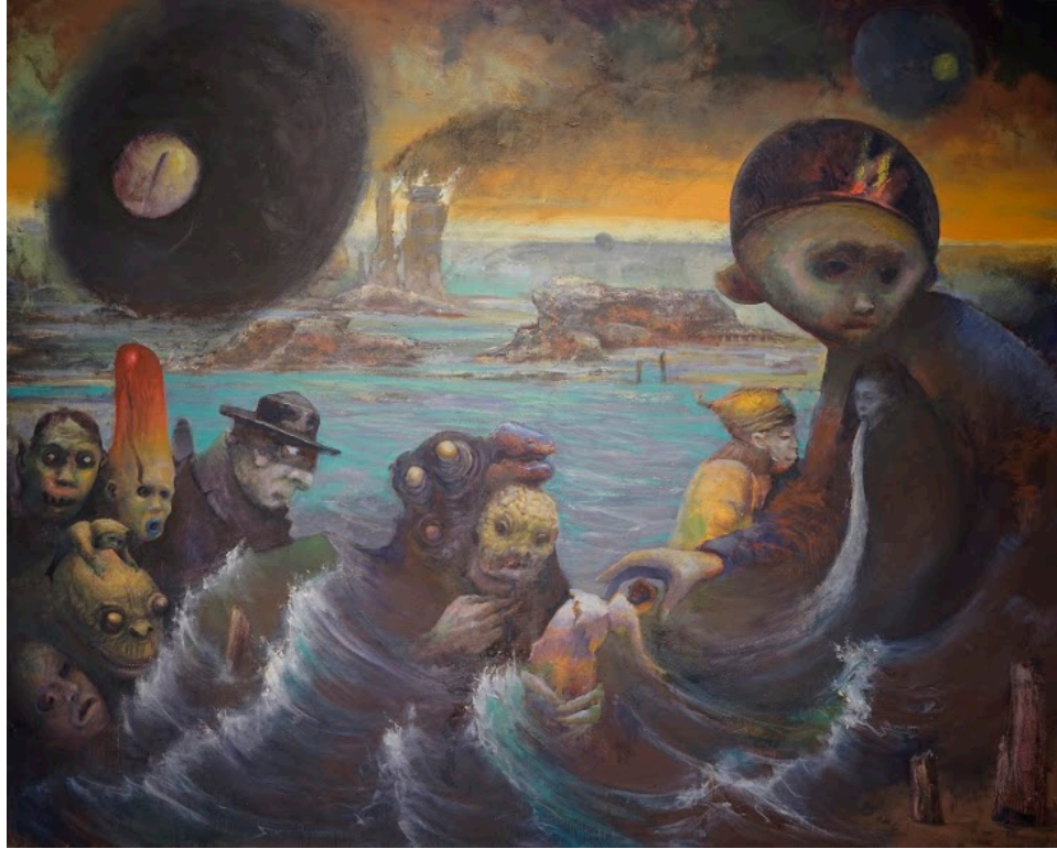
Figure 8. Roadside Picnic . 2019. Oil on canvas by Nicholas M. Raynolds

Like Paula Rego's nursery rhymes, my final picture is ". . . a derivation, not a transcription . . ." (McEwan 75) of the Strugatsky Brother's novel. In fact the title "Roadside Picnic" had nothing to do with the original theme when the painting began but was discovered along the way. By extension, the final painting would seem to reflect very little on the Strugatsky novel by an objective reader and viewer; a repoussoir of monstrous characters of varying scale and demeanor are set off against a remote and desolate watery landscape. In the front right foreground an unusually large figure perhaps part ape or human child has an unsettling innocence about it. Nestled in its lap is a darkened female figure from whose mouth spews a fountain of water, perhaps the source of the deluge that laps upon the shore just barely visible in the right foreground. Spanning out across the canvas are a cacophony of tricksters, witches and creatures some demonic in tone, which arch up to the left leading to a large black whirling mass containing a cat's eye - a kind of blind spot. This strange, dark object echoes out across the landscape like so many alien incantations, leaving desolation and instability in their wake. This picture has come to represent for me a period in my artistic development in which I (re)opened my painting practice to more free associative strategies involving fantastic elements and invented