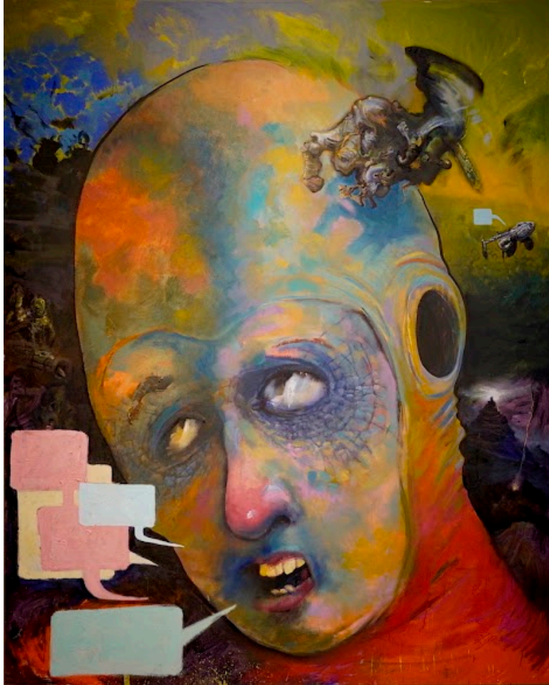
Figure 17. Moon Calf . 2020. Oil on canvas by Nicholas M. Reynolds

serve as another anatomical extension: from bone to nerve to psyche to soul, seeking and rejecting, adjusting and accepting the histrionics of the landscape of the face. How completely cumbersome simplicity can be. Which version of the self, is best refused in order to express acceptable traits to another? A colossus or a puny one? Where but in the face resounds the traction one has or lacks in one's life? Here, two large heads in heroic scale; two broken hearted creatures in majestic idiocy. Remarkably persistent, the fool again makes an appearance in the painting "Moon Calf" (figure 17). By definition a moon calf is "...a congenitally grossly deformed and mentally defective person; a foolish person; a person who spends time idly daydreaming". His enormous head proclaims self-negating statements in the form of comic book speech bubbles before a backdrop of vignettes of barely complete tales of adventure. Floating above him is a 'Knot' or some alien life form, perhaps this is the abortive, shapeless, fleshy mass