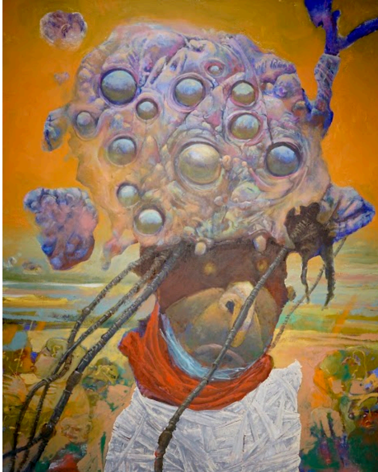
Figure 9. Homo Algorithmicus; The Hackable Man . 2019. Oil on canvas by Nicholas M. Raynolds

to fit the most utopian, derelict and flat of all worlds), “Homo-Algorithmicus” is a new and now derelict dream that has been dislocated and secured in its amorphousness by blindness and numbness, to be molded anew. Evolved from a homogeneous mono-topia to a bio/digital multi-topia and overwhelmed by a glut and guilt of possibilities. “Homo Algorithmicus” is our own epoch’s manufactured citizen/consumer/individual: trapped, groomed and controlled by our own desires.