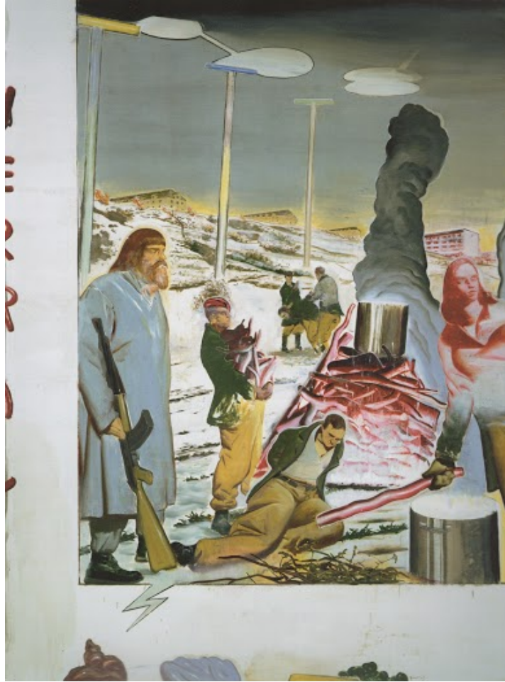
Figure 3. Verrat . 2003. Oil on paper by Neo Rauch

German artist Neo Rauch conflates pop-pulp tropes with modernist painting's 'object-ness' in using the device of the comic book panel. In his painting "Verrat" (figure 3) for example, the objective and narrative picture planes have been separated by the device of an internal frame. As Donald Kuspit points out, "Verrat" "...is rich with narrative ambiguities and implications" (Kuspit). In viewing the 'picture within the picture' we pass through the border of word/text and paint/matter, represented by the cropped title on the left, and blobs of paint along the lower border. Like Max Ernst, Neo Rauch's works are activated in a kind of inverted-narrative, the paintings engage us in an absurd interaction in which the figurative is abstract and the abstract, representational. He seems to "...invent narratives, but he doesn't tell stories" (Saltz). Kuspit wonders whether Rauch is "... a true dialectician, 'living with live opposites', or is he indulging in nihilistic absurdity?" (Kuspit). In most of his works it is often difficult how to answer this, and I'm not so sure that the question would be one of interest to the painter, who