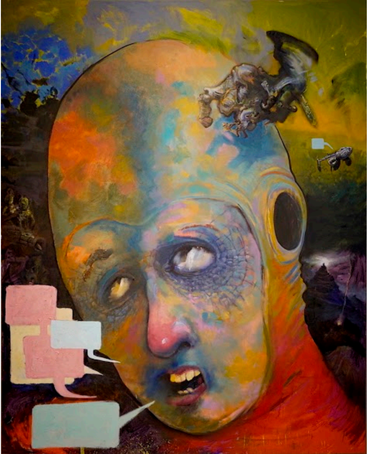
Moon Calf Oil on Canvas, 93"x75", 2020