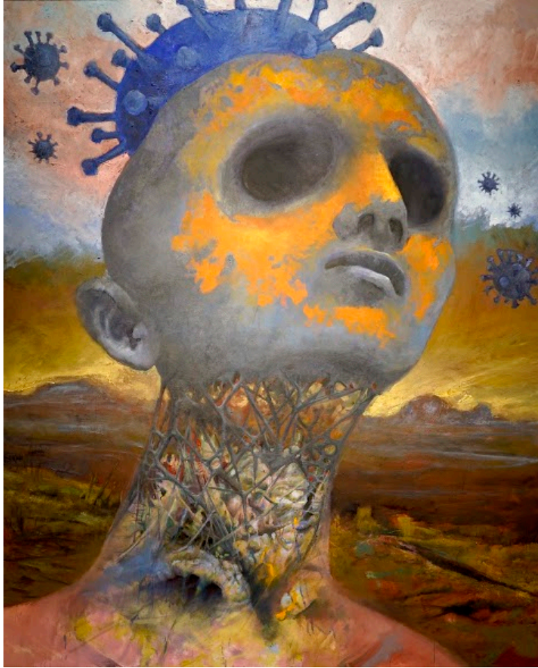
Figure 18. Corona; Hail to the Thief . 2020. Oil on canvas by Nicholas M. Raynolds

suggested by the title? The idiot is at once a scapegoat and recipient of ridicule but, as suggested in “The Fool” card in the Tarot (Waite), “He is a prince of the other world on his travels through this one. . .”. Another type of fool, this time an innocent or naive one appears in “Corona; Hail to the Thief” (figure 18).