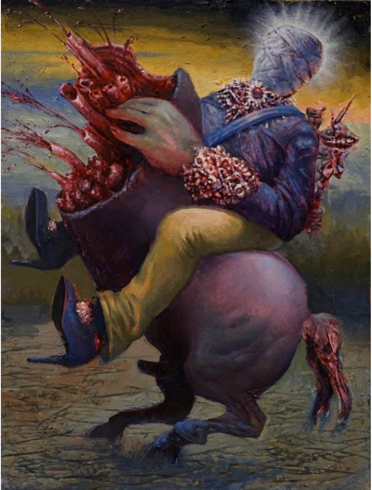
Equestrian Portrait Oil on Panel, 12"x9", 2020