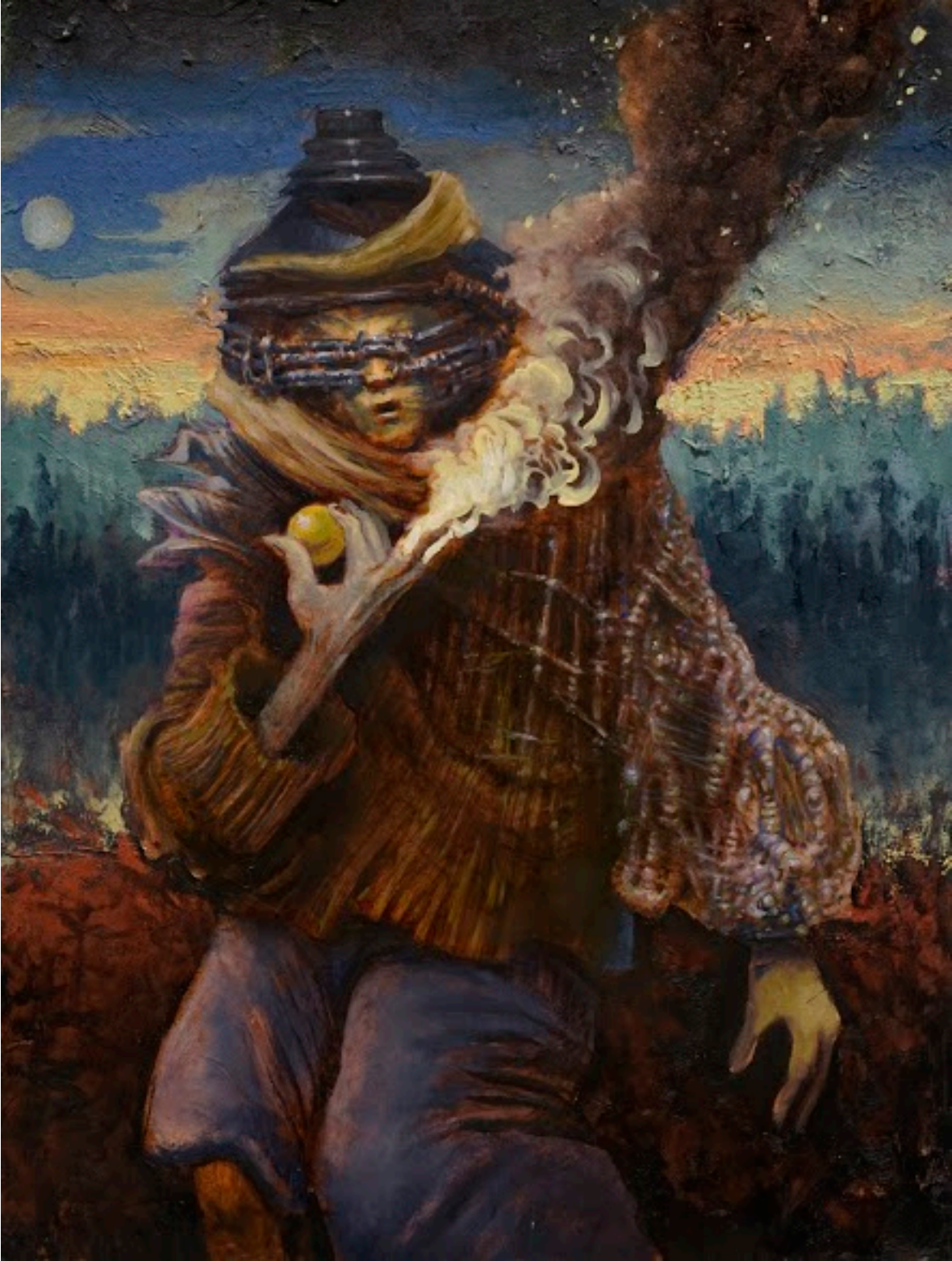
Firestrarter Oil on Panel, 12"x9", 2020