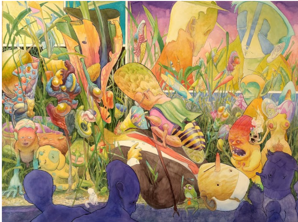
Figure 10. The Oligarch's Garden . 2019. Pen and ink and watercolor on paper by Nicholas M. Raynolds

The small background characters are supposed to be related to the psyche of the larger main character but also suggest a hieratic perspective.