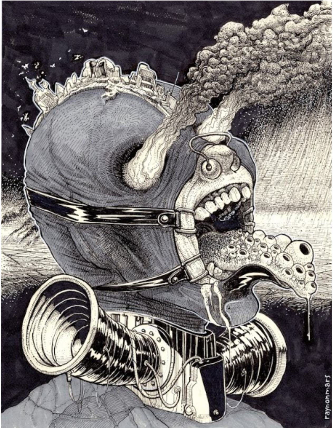
Taste Pencil on Paper, 11"x8.5", 2020