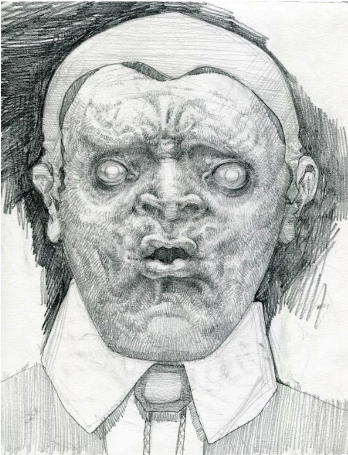
A Scandalized Bamboozler Pencil on Paper, 11x8.5, 2020