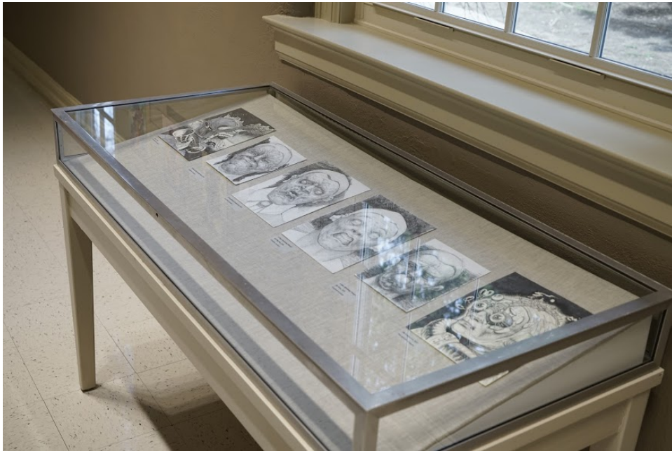
Installation View of the emotional plague