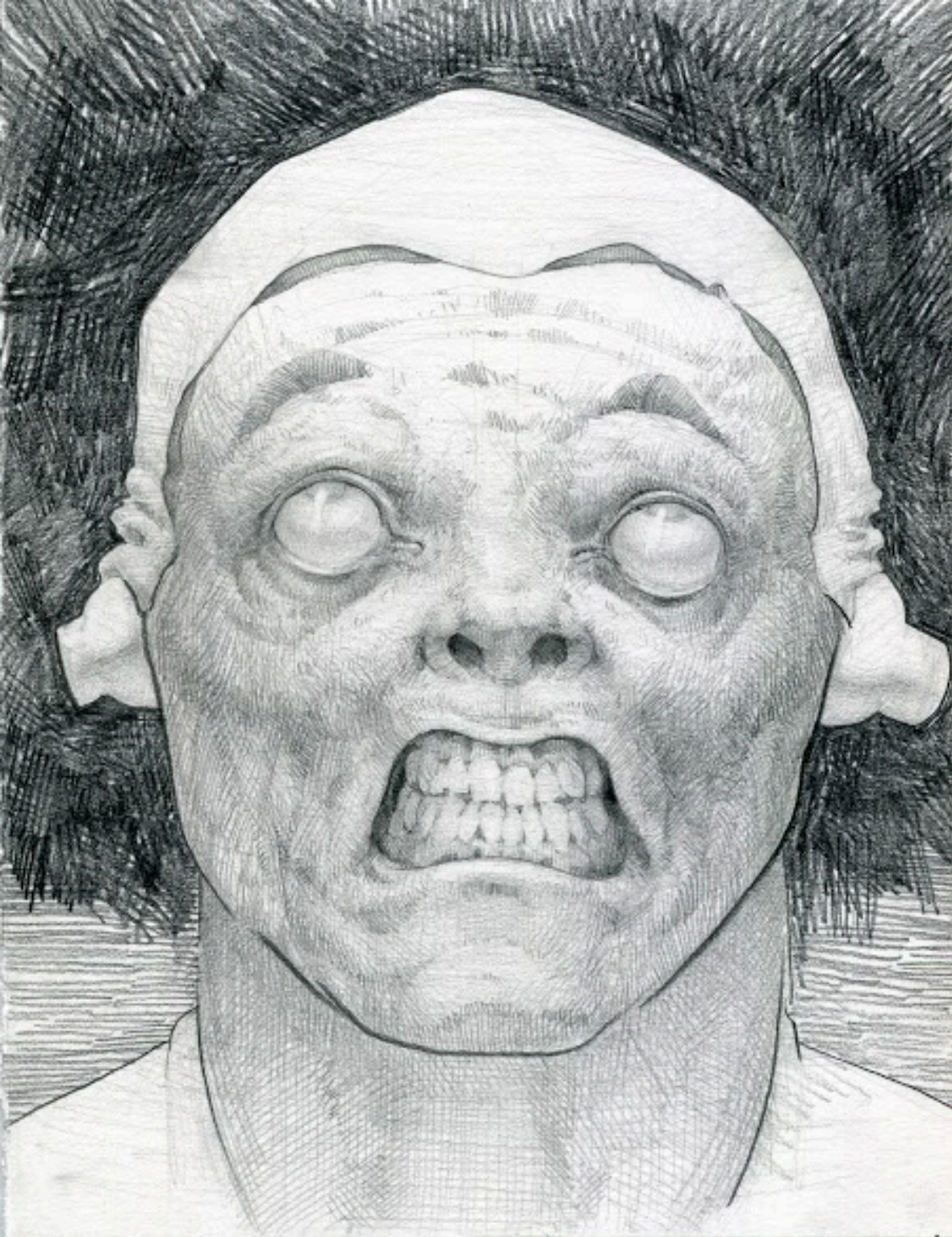
A Man Convincing Himself of a Big Idea Pencil on Paper, 11"x8.5", 2020