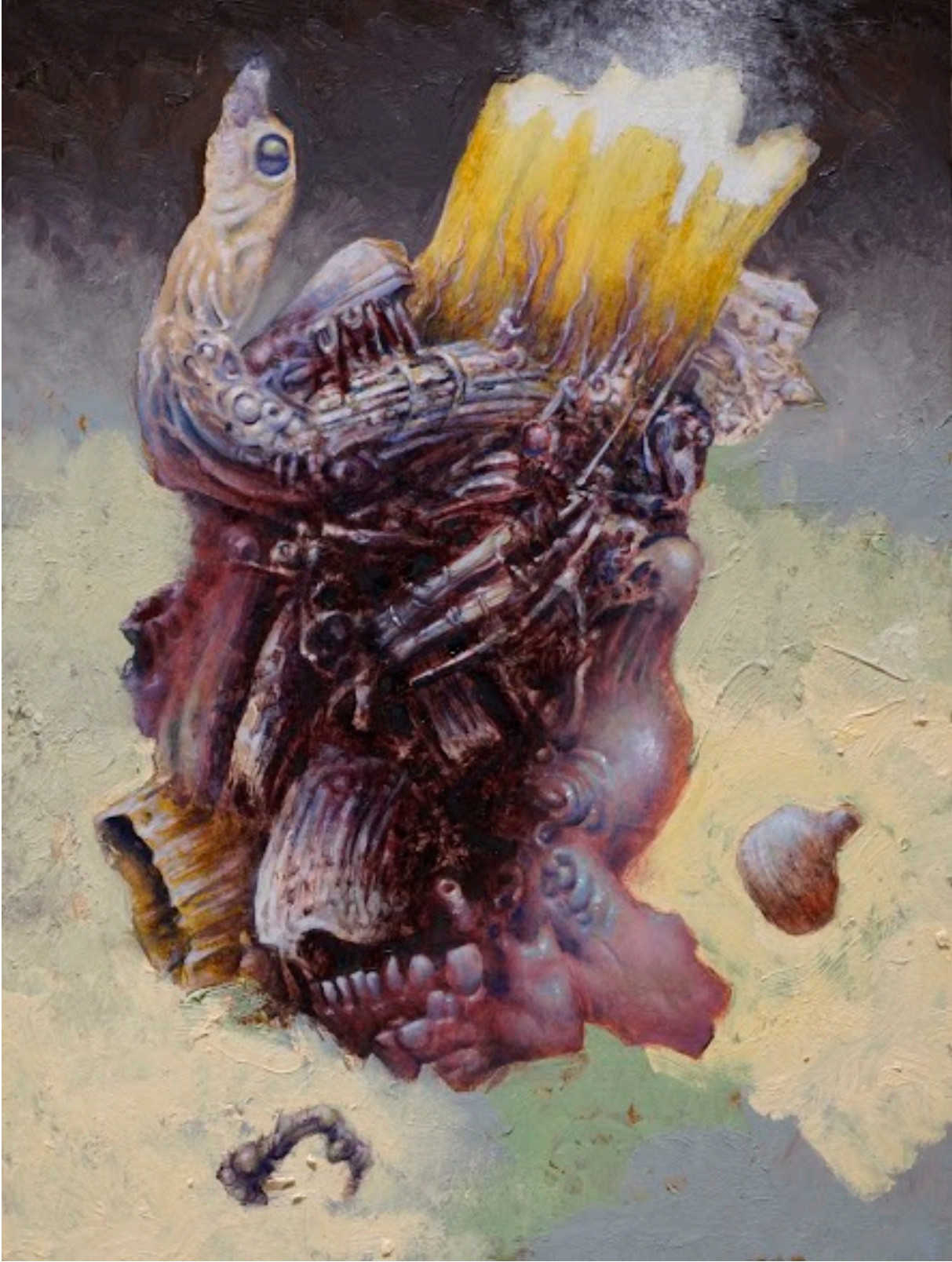
Knot #3 Oil on Panel, 12"x9", 2020