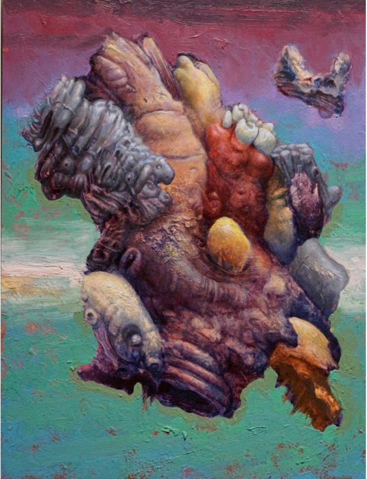
Knot #2 Oil on Panel, 12"x9", 2020