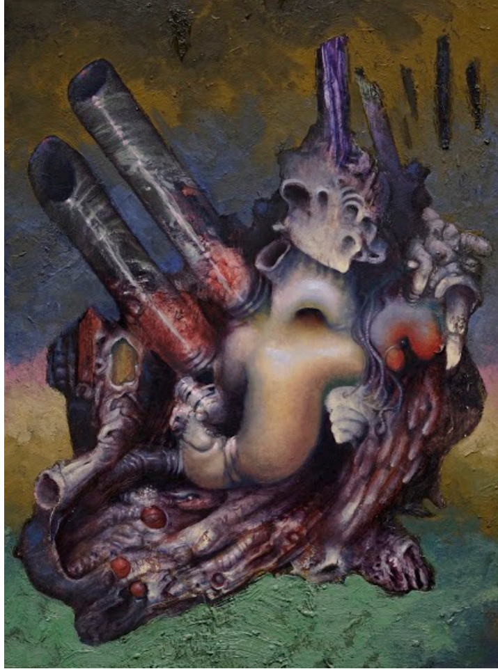
Figure 15. Knot #4. 2020. Oil on panel by Nicholas M. Raynolds