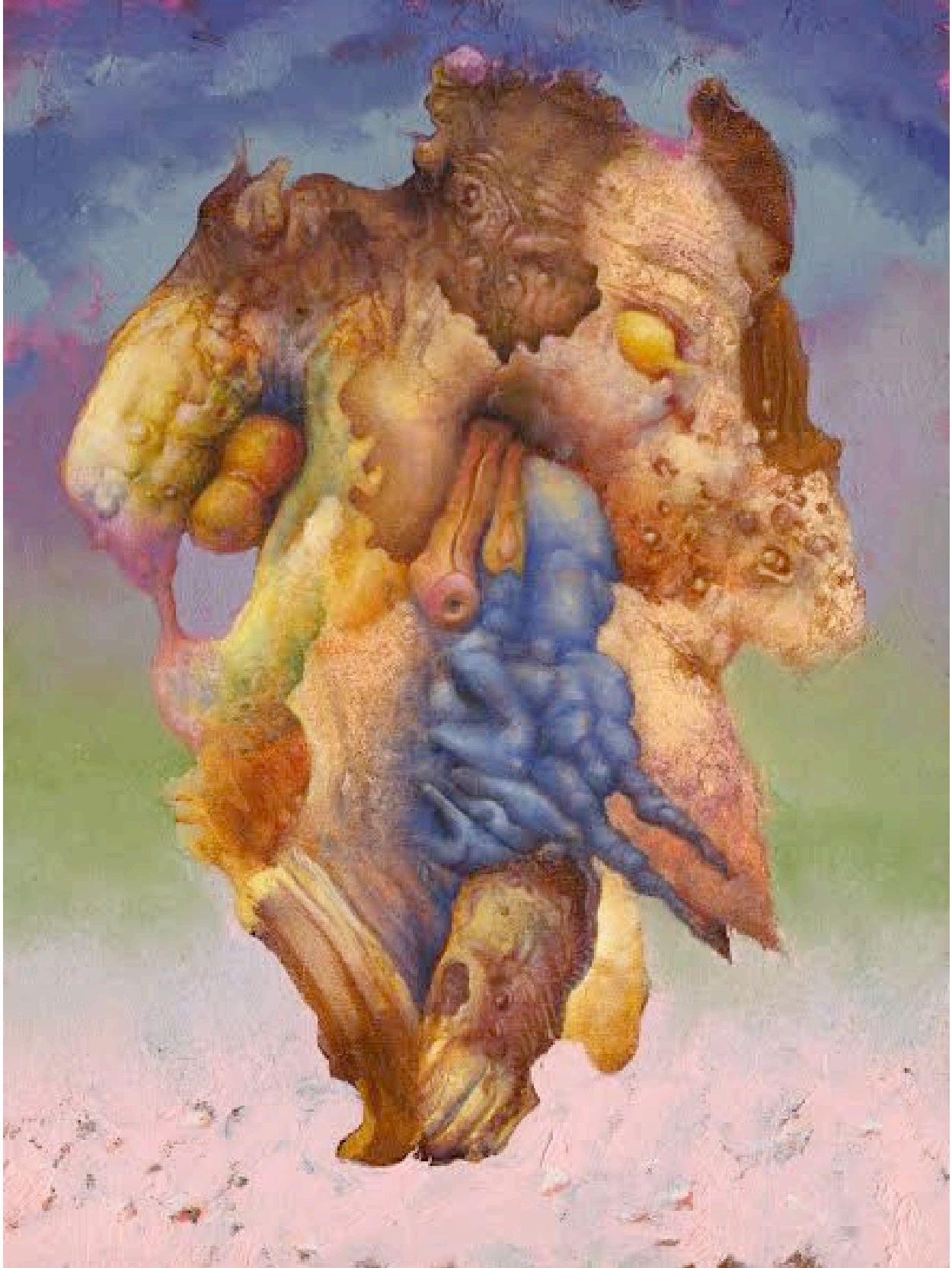
Knot #1 Oil on Panel, 12"x9", 2020