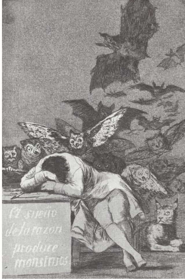
Figure 22. The Sleep of Reason Produces Monsters by Francisco José de Goya y Lucientes