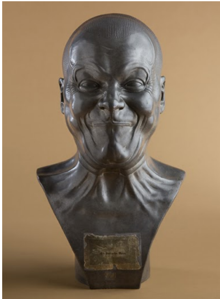
Figure 16. A Strong Man. 1771-83. Tin-lead cast by Franz Xaver Messerschmidt

The selection of portrait drawings serve not so much as studies but as companions to the paintings. Most were inspired by the busts of 17th century Austrian sculptor Franz Xaver Messerschmidt (figure 16) whose extreme facial expressions and posthumously titled works challenged decorum and ventured into new territories of emotional possibility. The portraits in my exhibition, both the drawings and the paintings, are profiles of possible inhabitants of the worlds presented in the larger works. They are also an inquiry into the personality of individuals as perceived through their visages. Layer upon degraded layer, the voyeur of one's own masks