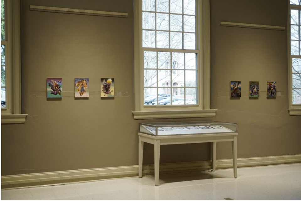
Installation View of the emotional plague