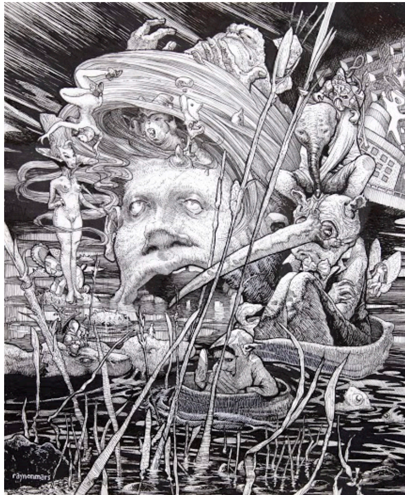
Figure 4. Flotilla . 2018. Pen and ink on paper by Nicholas M. Raynolds

seems to have struck upon some new form of recombinant language; it is both and neither ..... sometimes. His are “. . . deeply personal works that possess a ‘poetic structure’ and a ‘secret that eludes superficial interpretation’ ” (Eisman 240), yet despite this, or perhaps as a result of it, they resonate inscrutably .