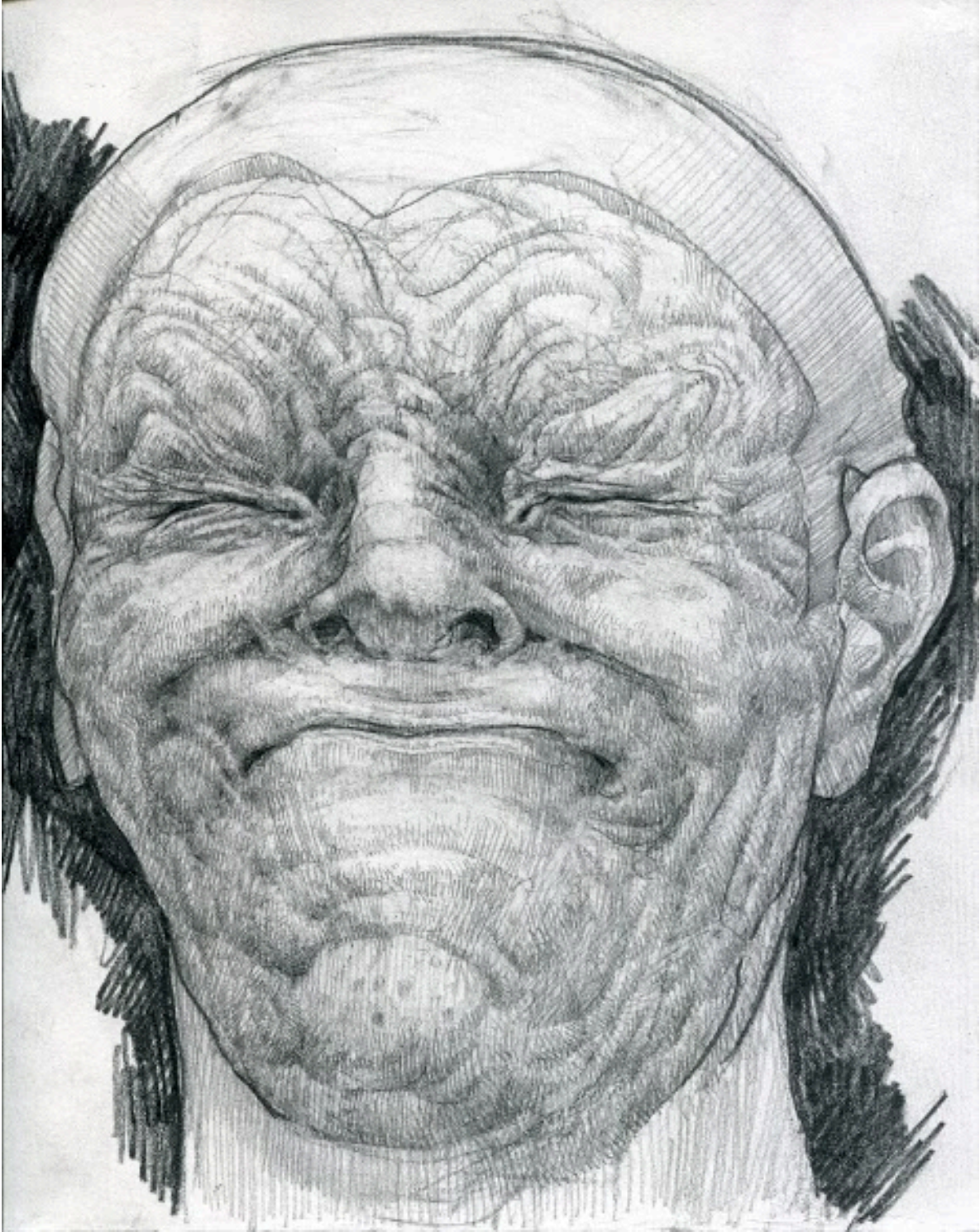
A Man of Implacable Cheer Pencil on Paper, 8.5"x7", 2020