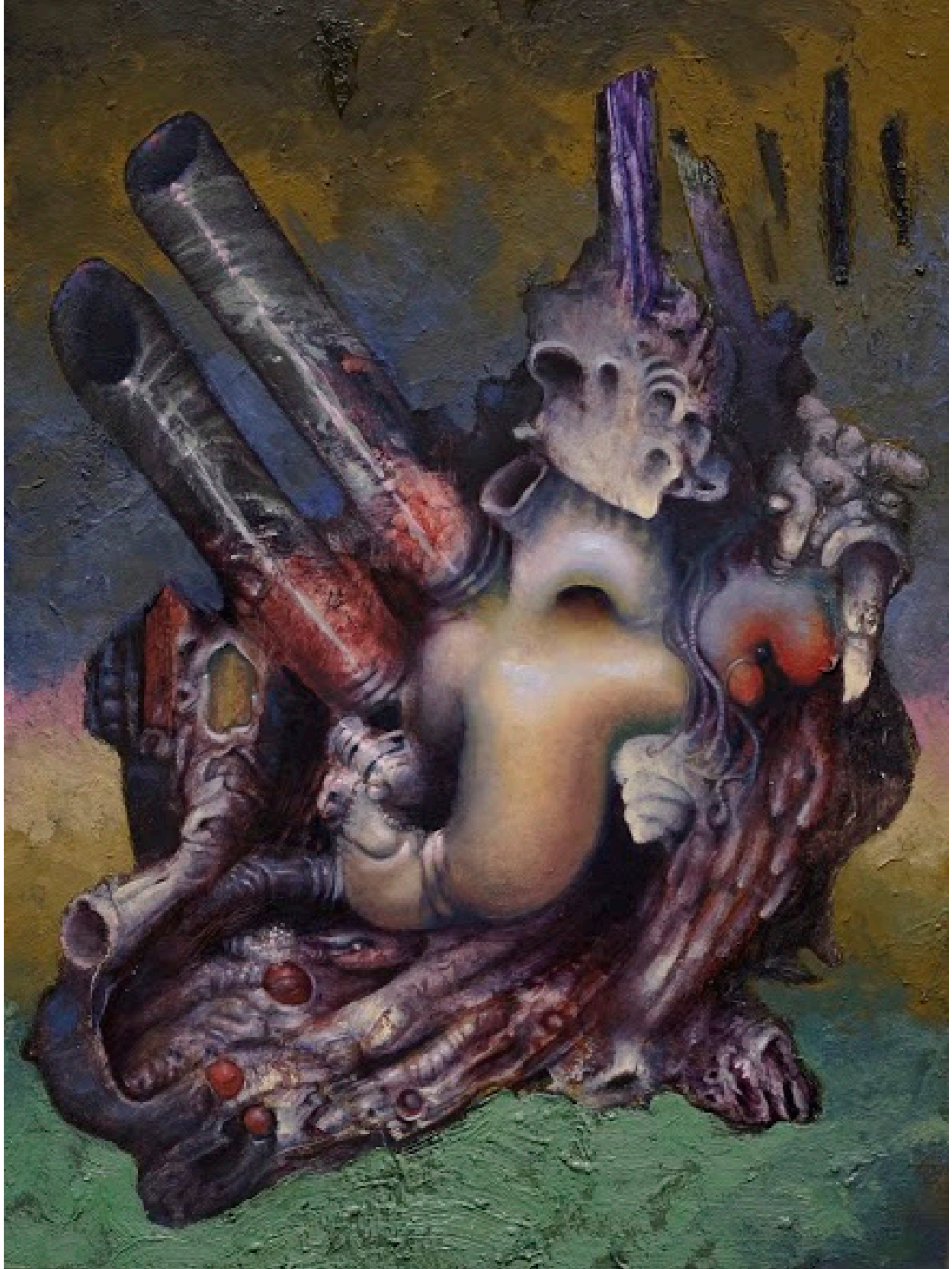
Knot #4 Oil on Panel, 12"x9", 2020