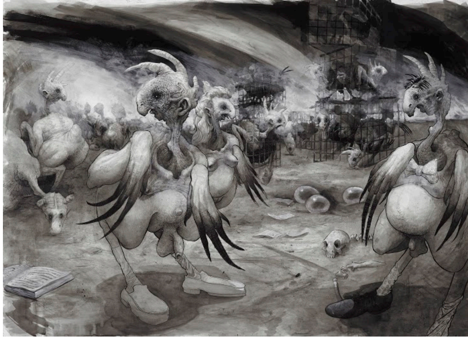
Figure 12. Galluserie. 2018. Mixed media on paper by Nicholas M. Raynolds

similar to how numerous science fiction authors and artists work; a world built to accommodate a specific character. “Plague Flowers” (figure 13) by contrast was the result of characters developed by ‘automatic’ drawings. In a number of my improvisational drawings, I noticed the recurring subject of a kind of abstract plant life. I consciously decided to develop these forms in the drawing of “Plague Flowers”. In that sense, the ‘automatic’ technique was clearly mediated. This drawing offered an insight into the pursuit of invention by applying different strategies to cultivate subjects. In this efflorescence, a story about these plants revealed itself to me. They were a kind of recombinant organism, an amalgam of plant and animal. Often possessing human-like genitals in order to procreate, they are the result of some genetically modified atrocity - Wilhelm Reich’s emotional plague meets Baudilaire’s Flowers of Evil (Baudilaire) - psychic mutations manifest. This malignant weed reflects a human future not of superior intellect, but rather brute survival. Not the mutation into some kind of super-computer but rather a brainless, over-sexed voracious weed whose sole purpose is proliferation.