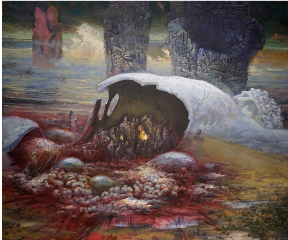
Figure 19. The Drowned Giant . 2020. Oil on canvas by Nicholas M. Raynolds

allegory of the death of the classical gods in our modern age of technological capitalism, part surrealist necrotic fantasy, Ballard chronicles how the colossus is slowly dismembered by the town's inhabitants like a beached whale from an earlier age.