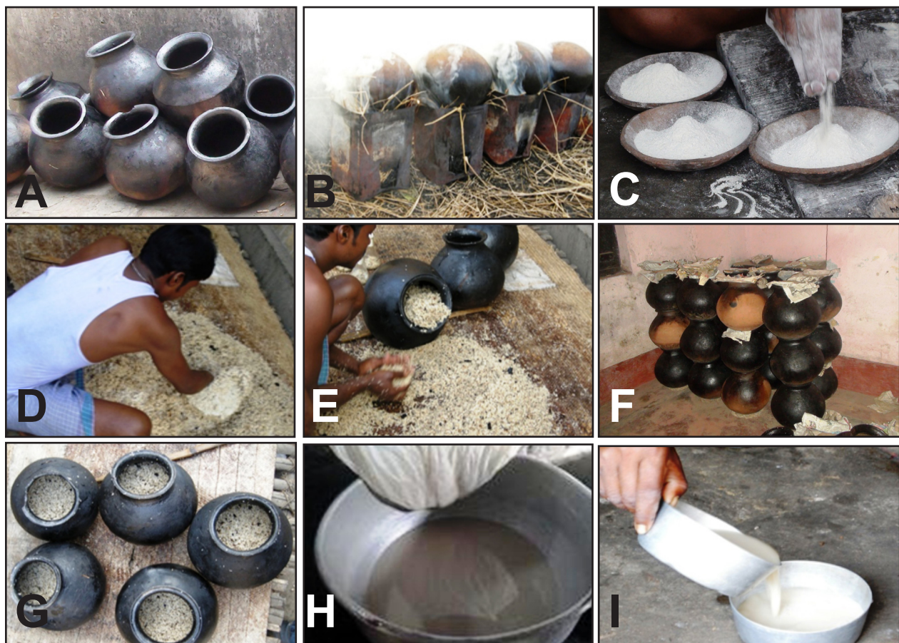
Figure 4. Traditional haria production steps in lateritic West Bengal, India: (A) earthen fermentation pots; (B) batch sterilization of earthen pots; (C) bakhar (starter culture); (D) mixing inoculum; (E) filling inoculated substrate into earthen pot; (F) incubation in earthen pots; (G) post-fermentation; (H) dilution with drinking water and sieving with fine cloth; and (I) serving haria in bowl.