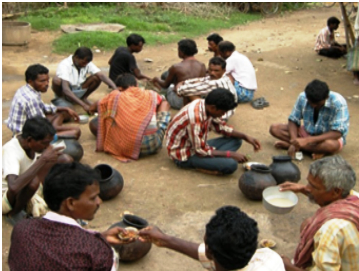
Figure 5. Drinking traditional haria as a finished product in lateritic West Bengal, India.

From our survey it was found that haria is applied as a remedy for many degenerative and infectious diseases. Those surveyed believe that it can protect them from many gastrointestinal ailments, particularly dysentery, diarrhea, amebiasis, acidity, and vomiting. Apart from these, tribal gurus (native physicians) prescribe it as a skin, eye, hair, and heart protective agent.