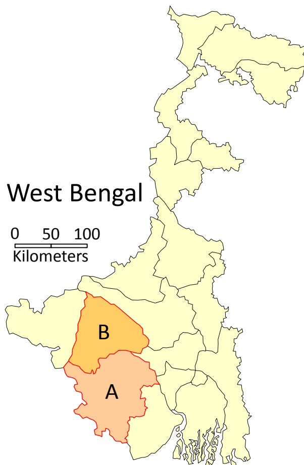
Figure 1. West Bengal, India, with (A) West Midnapore and (B) Bankura districts.

perature (for 3–4 days), and dilution of glutinous fermented material with drinking water for final consumption.