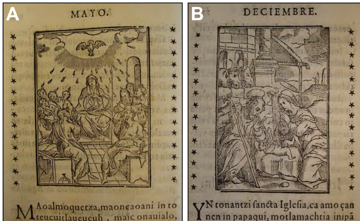
Figure 6. The Psalmodia volume (Sahagún 1583) contained a number of illustrations to accompany the songs. These images, meant for the eyes of the friars during services in indigenous communities and not for the native population, adhered to conventional European Christian iconography, which belied the exotic floral paradise evoked in the song texts. Shown here are the illustrations for Pentecost (A) and Christmas (B), Sahagún 1583:f92v, 229v).

flowers still reverberates strongly down to details such as the canon of species called upon (Sell et al. 2006:190).