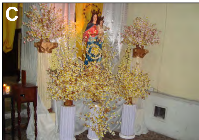
Figure 7. During Los días de las Enhiladeras de Flores the threading of plumeria blossoms becomes a social activity among the participating women in the community of Isla la Flores (A, B; Petén, Guatemala). Some of the completed plumeria 'trees' eventually surround the statue of Virgen Maria in church (C; source: M. Tulio Pinelo; May 2010).

In Lombok's graveyards, plumeria trees were said to 'have always been there'. To this date Sasak of central Lombok believe that plumerias planted around a grave will on the one hand facilitate propitious contact with invisible spirits and carry prayers upwards with their fragrance, on the other hand the plants will deter the attacks of witches by masking the scent of the corpse (Telle 2003:95-97, 101). A similar rationale is at work in Muslim communities in Ternate (Moluccas) where the sweet smell of būnga kambōja (plumeria blossoms) growing around ancestral grave sites, which are also covered with fine-cut leaves of fragrant pondok ( Pandanus sp.), thwart the assault of witches and promote contact with the ancestors (Bubandt 1998, Bubandt 2012 personal communication).