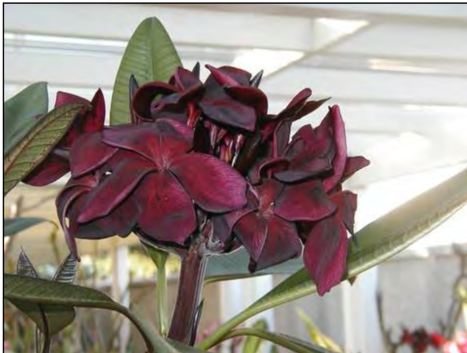
Figure 3. Even if spectacularly dark varieties of plumeria exist, such as the one named 'Black Widow' depicted here, most early descriptions hint at brighter colors, leaving the origin of the name 'raven flower' in question.

1950-1982:(7)81) to white ( iztaccacaloxochitl , iztac , 'white' (Molina 1571:f49r). In fact, there were so many that Hernández would not dare mention them all, so as not to bore the reader (Hernández 1615:45r-45v, Varey 2000:125-126). One particularly interesting plumeria variety received a separate entry: tlahquecholtic was named for its similarity to the roseate spoonbill ( Platalea ajaja L., 1758), an attractive wading bird with coloring from white through pink to magenta on its body (Figure 4, Hernández 1959:(3)146). 30 Finally, there was also a wild occurring yellow-flowered form of plumeria, the 'mountain raven flower' ( tepecacaloxochitl , tepetl 'mountain' (Hernández 1959:(3)197-198, Molina 1571:102v). 31