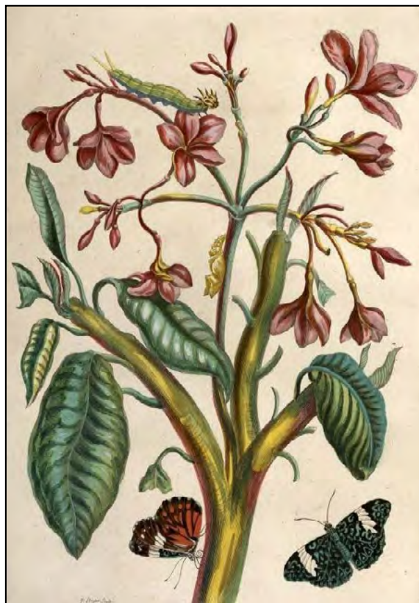
Figure 1. This early and remarkably accurate image of Plumeria rubra L. (Merian 1719:plate 8) was captured in 1699 in Suriname. It also shows the butterfly and possibly the pupa of Hamadryas amphinone L., 1767 as well as a larva belonging to an unidentified species of Brasolididae on and around P. rubra . Merian noted in her legend to this image of the 'West Indian Jasminetree' that it was the same as Hernández' quauhtlepatli . However, the 'fire plant' ( quauhtlepatli ) of Hernández (1615:24r-24v(l)cap. 2.33) is Euphorbia calyculata Kunth. Merian, as others had done before (Varey 2000:123), conflated Plumeria and Euphorbia based on their similarity in appearance and lactescence.

These observations are relevant for this study, since folk nomenclature often used the color of the flower as a dis-