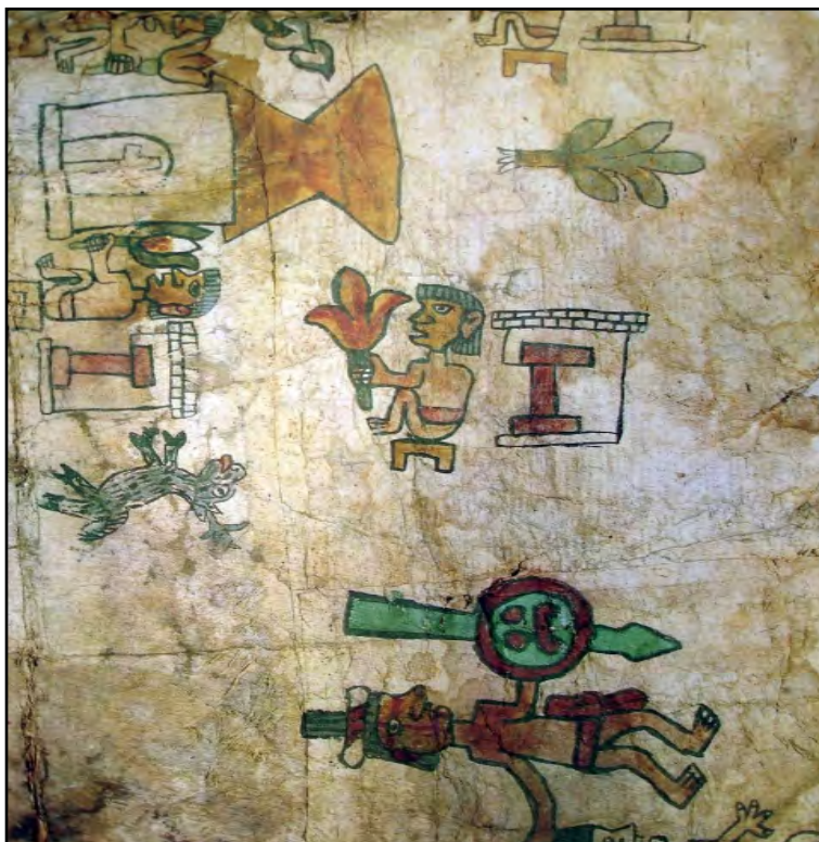
Figure 5. In the center of this fragment from the Códice de Huamantla (Aguilera García 1984) a local ruler dressed in a red loincloth is seen seated. His low stool arranged in front of his 'noble house' and the flower in this hand, identified as a two-colored cacaloxochitl , are marks of his nobility. To his left another noble (facing upwards) holds what appears to be yolloxochitl.

The expression 'flower and song', in xochitl in cuicatl , signified the artistic activity of producing and reciting poetry, which was closely allied to elite social groups. This difrasismo 37 points to the importance of nature, and specifically flowers, but also birds, as an inspirations for Nahua lyrical songs, which were typically performed to the accompaniment of music. It directs our attention to the role of plumeria in a poetic genre, which we know from two early colonial collections of songs (Bierhorst 1985a, 2009). 38