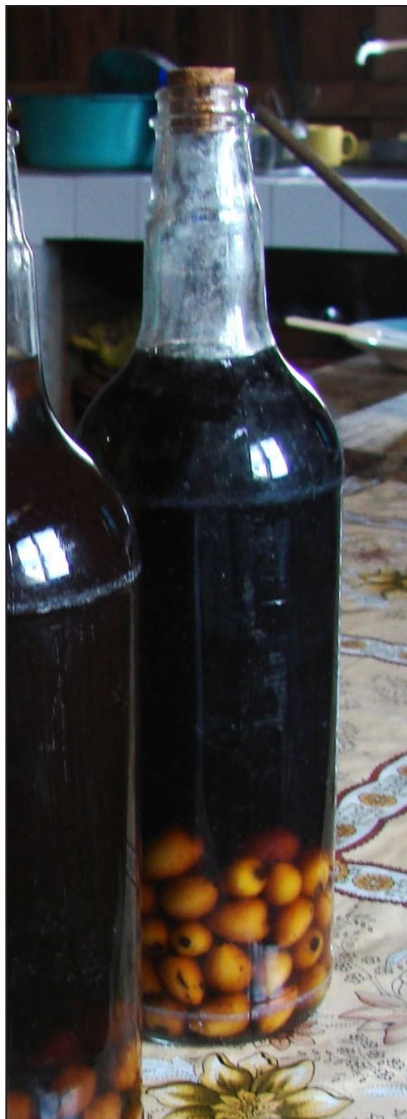
Figure 4. Bottle of Butia catarinensis Noblick & Lorenzini (cachaça de butiá or uísque de bolinha).

namental. The use of the juice could be broadened locally, similar to what occurs in northern Minas Gerais (Faria et al. 2008a) where Butia capitata (Mart.) Becc. juice is a supplement to the school lunch. Thus, the fruit of B. capitata are used as a source of fibers, vitamin A, vitamin C and potassium (Faria et al. 2008a). Genovese et al. (2008) showed that Butia spp. fruit have a significant amount of