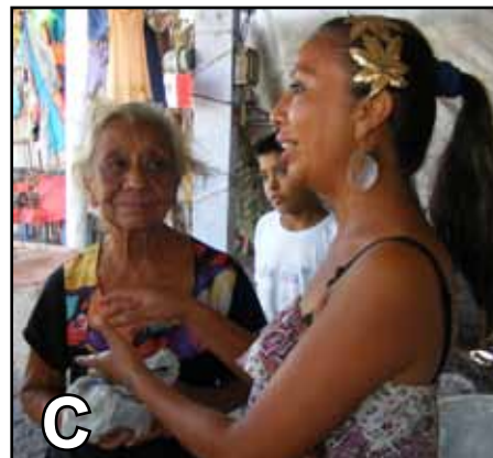
Figure 3. The Totonaca culture. (A) Totonacan men exhibiting the flying man ceremony. (B) Pyramid of the Niches, a 6-12 th century Totonacan temple. (C) People of a Totonaca cultural group showing how to cook piñon manso ( Jatropha curcas L.).