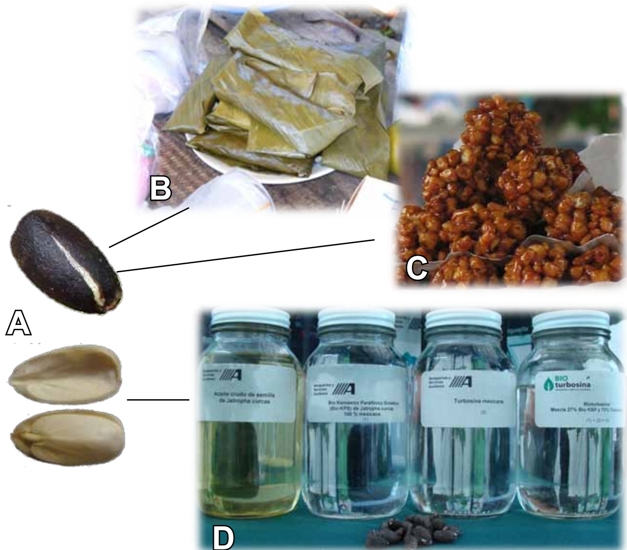
Figure 5. Possible uses for non-toxic piñón manso ( Jatropha curcas L.) cultivated by the Totonacas. (A) J. curcas seeds, (B) Tamales, a dish made from ground J. curcas seeds, (C) Pepitorias , a desert made from J. curcas seeds, and (D) Biofuels produced from J. curcas seed oil.