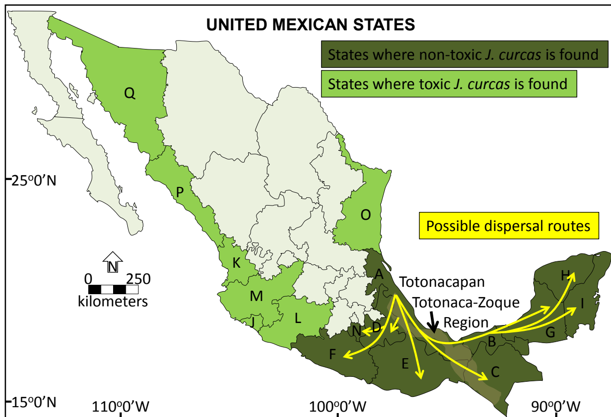
Figure 4. Possible routes of dispersal of non-toxic Jatropha curcas L. in Mexico and its association with the Totonaca culture. States with J. curcas : (A) Veracruz, (B) Tabasco, (C) Chiapas, (D) Puebla, (E) Oaxaca, (F) Guerrero, (G) Campeche, (H) Yucatán, (I) Quintana Roo, (J) Colima, (K) Nayarit, (L) Michoacan, (M) Jalisco, (N) Morelos, (O) Tamaulipas, (P) Sinaloa, and (Q) Sonora.