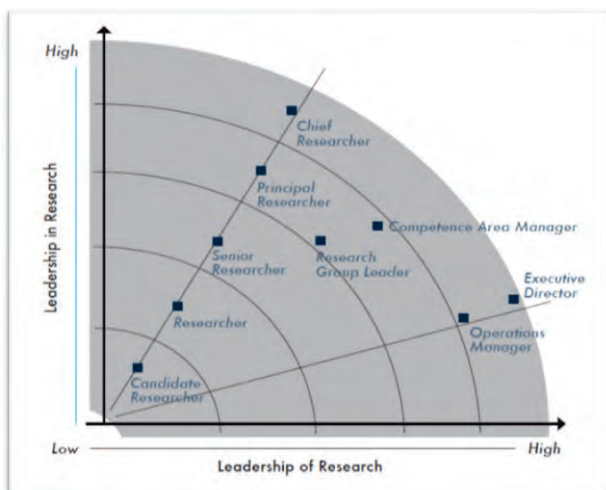
Figure 2. The Research Career Ladder of the CSIR, South Africa (Van Wilgen 2006; used with permission).

However, early career scientists can carefully plan where they end up in the research career ladder (Figure 2) and can, therefore, avoid the frustrations of leading scientists without the adequate track record required to provide sound leadership of science. A dilemma of whether to continue with research or move towards research management often confronts young scientists, and decisions at this phase can drastically alter careers in science. The biggest questions for any scientist who has aspirations to manage research or lead researchers are: