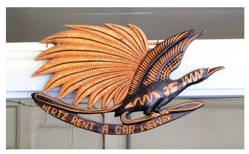
FIGURE 6 An Eastern Iatmul carving hanging above the counter in a car rental agency in town. (Wewak, 2010)

Reports of masculine inadequacy are common in postcolonial Papua New Guinea (eg, Clark 1989; Zimmer-Tamakoshi 1997; Lipset 2009). In Tambunum, this predicament calls to mind a myth about a lonely ancestor named Migaimeli who carved himself a spouse. But the wooden figure remained inanimate. Worse, Migaimeli was shamefully caught in the act, as it were, with his sculpture. Out of sheer pity, a nearby village offered him a human wife. Like Migaimeli, men in Tambunum feel unmanned, vulnerable, and frustrated. But unlike Migaimeli, men today know well what to do with their wood carvings: sell them to tourists. If only they could. Instead, and like Migaimeli again, they are largely unable today to transform their sculptures into viable sociality.