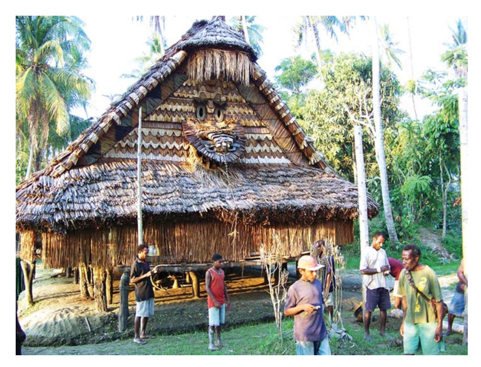
FIGURE 11 Preparing a platform in front of a new men's house for an opening ceremony scheduled for the yet-to-occur Sepik Cultural Diversity Show. (Tambunum, 2010)

perform at other festivals throughout the country and even overseas. Last, the singsing would so impress the visiting dignitaries that the local-level government would fund the construction of a "traditional art gallery" in the village. This, too, would "pull" tourists as well as "anthropologists" and "geographers," whose writings, speeches, and universities would likewise bring the village acclaim, tourists, and "development."