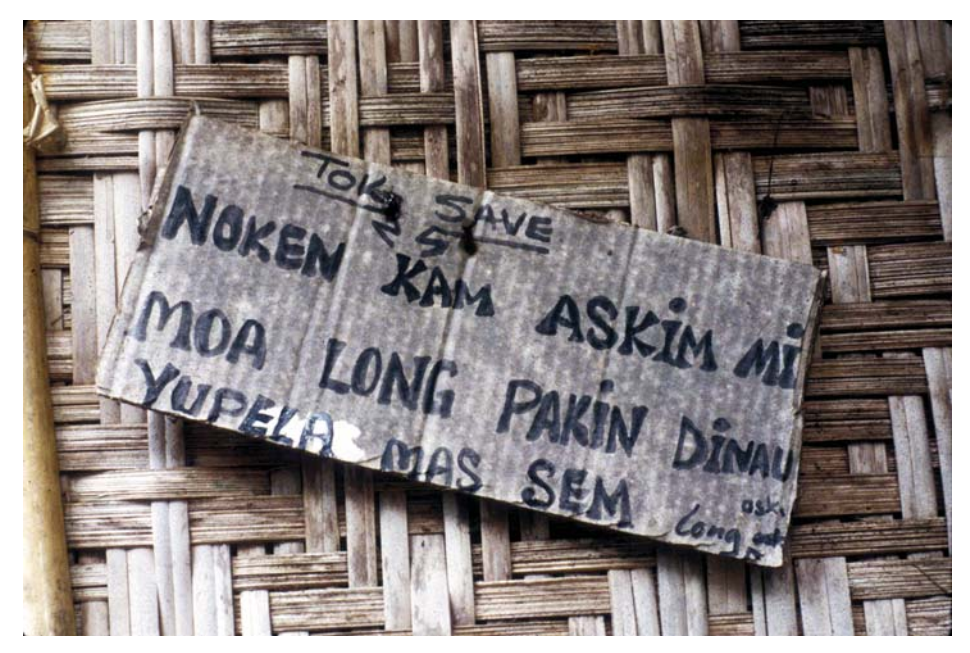
FIGURE 4 Typical tokpisin sign affixed to a tradestore declaring "Announcement: Do not ask for any more credit. Have some shame." (Tambunum, 1994)

diktsson 2006). Eastern Iatmul women sell baskets (figure 5). In the past, men earned greater income than women, since wood carvings fetch higher prices than basketry. The decline in tourism, however, deprives men of this revenue. Papua New Guineans themselves find little appeal in Sepik wood carvings. At best, men try to sell carvings to stores (figure 6). But this is a limited market. The main outlet for wood carvings remains overseas dealers and especially tourists. By contrast, many Papua New Guineans carry hand baskets, allowing local women who reside in town entrée into the cash economy not regularly afforded to their male kin. Were men embarrassed, I asked a group of women in Wewak? An older woman, silent until now, angrily yelled, "They should be!" A few weeks later, Dangi, one of the two wives of my village brother, derisively compared men to dogs: "All they do is laze around and eat."