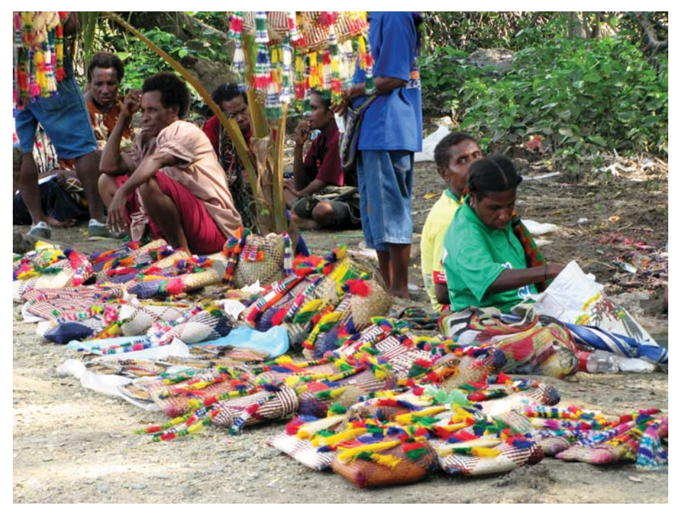
FIGURE 5 Women from Tambunum selling baskets by the side of the main road in town. (Wewak, 2010)

as a patrilineage or smaller "branch," but the nuclear family—a social unit that lacks a vernacular term. In the famili , as I Corinthians II:3 declares, the husband/father serves as the "head" who provides his dependants with food, clothing, school fees, and other commodities (see also Sykes 2001). The decline in tourism, however, undermines this moral ideal of modern manhood.