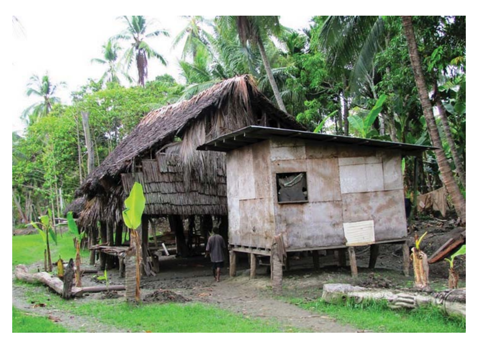
FIGURE 3 Former tradestore—empty and shuttered—in front of the owner's dwelling. (Tambunum, 2010)

much to my astonishment, some people in 2010 reported walking to town and floating downriver on makeshift rafts to Angoram. Nothing like this occurred in the late 1980s.