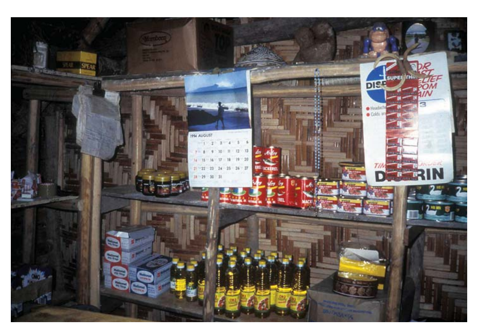
Figure 2 Typical array of tradestore goods in the late-1980s and mid-1990s. (Tambunum, 1994)