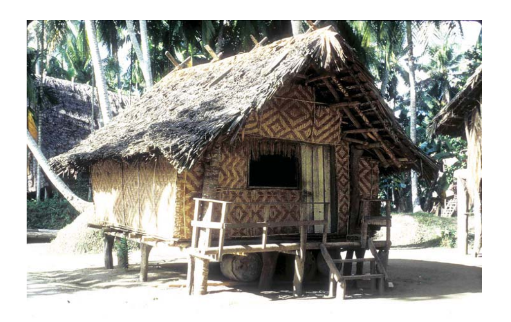
FIGURE 1 Typical village tradestore. (Tambunum, 1989)