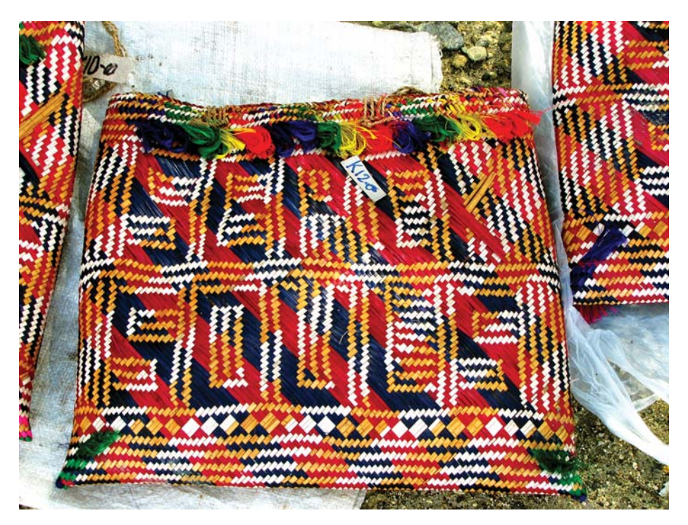
FIGURE 9 "Sepik Souls" basket sold in the town marketplace for K12.00 (US$5.76). (Wewak, 2010)

Men similarly carve, beneath variations of the national emblem, phrases such as "I Love the Lord My God," "God Bless Our Home," and "Hail Mary Pray for Us." We can also read these slogans as local attempts to affirm cross-cultural similarity despite the enormity of global and touristic inequalities—to negotiate relations of "commensurate differences," to draw on Deborah Gewertz and Frederick Errington (1991), in a world system predicated on "incommensurate differences."