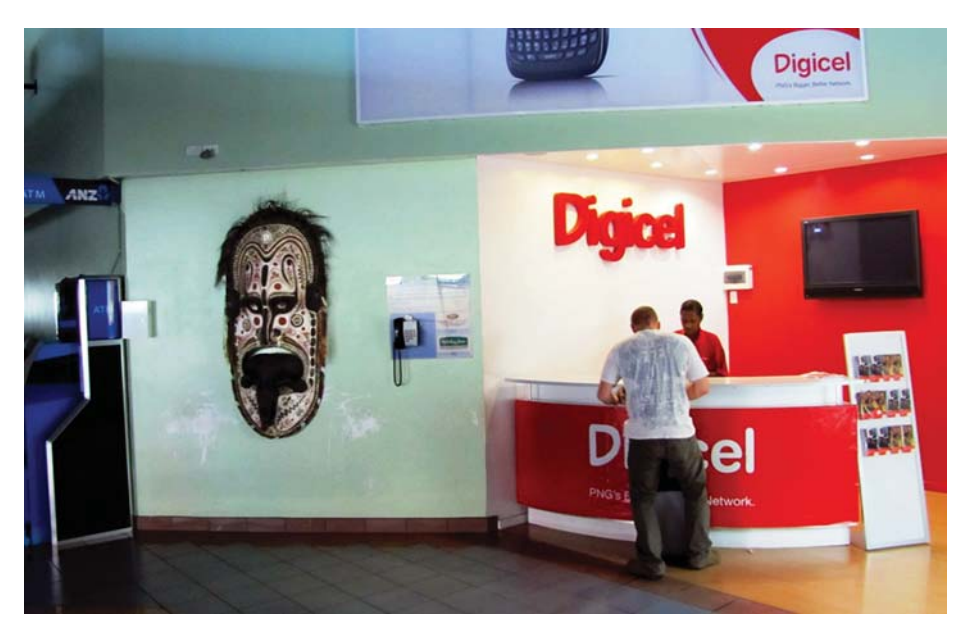
Figure 10. A Sepik crocodile mask hanging in Jacksons International Airport. (Port Moresby, 2010)

International Terminal at Jacksons International Airport in Port Moresby, sandwiched between an automated teller for the ANZ bank and the kiosk for Digicel mobile phones (figure 10). The emerging crocodile on this gargantuan mask seemingly seeks a place for Sepik identity amid two salient forms of modern magic: mobile telephony—which does not yet fully reach the village—and the dispensing of cash from an unseen source inside a machine.