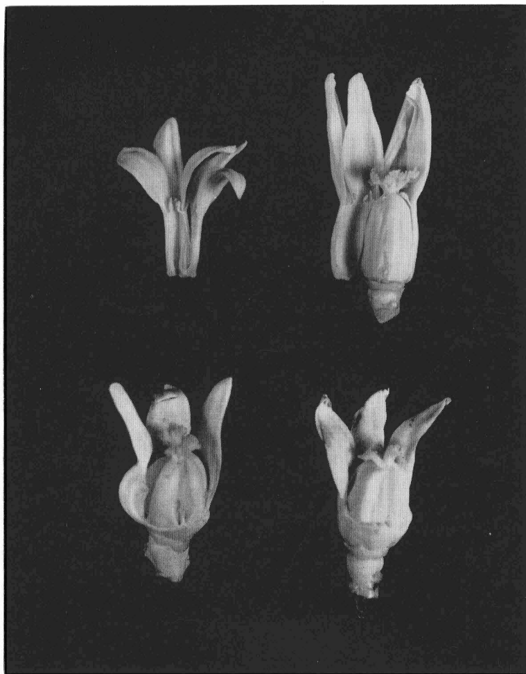
FIGURE 1. Floral types produced by hermaphroditic papaya trees. Upper left , type 4+; upper right , type 4; lower left , type 2; and lower right , type 3. See text for description.

Type 4+ . This type of flower has 10 functional stamens but lacks a functional pistil, although a vestigial pistil lacking a stigma is invariably present. This type of flower is the most staminate of the hermaphroditic types of flowers described here.