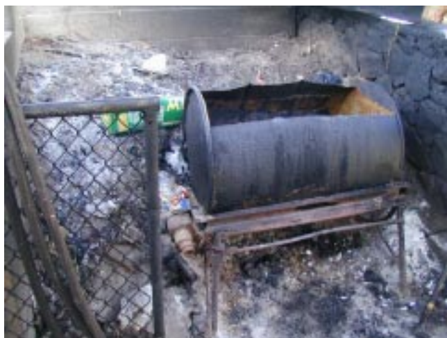
On-farm cooking of food discards