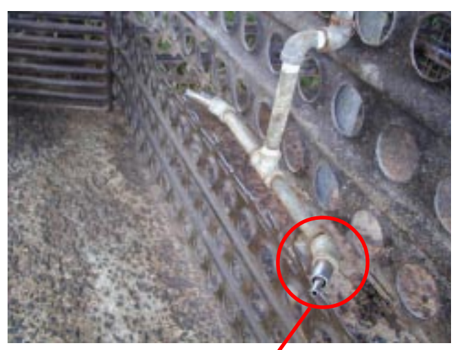
Water nipples provide a constant water supply with no mess.

Water is often neglected as a critical part of the pig's survival and must be supplied in unlimited amounts for optimal growth and performance. Even with free access to automatic watering devices, make sure low flow rates do not restrict water pigs need.