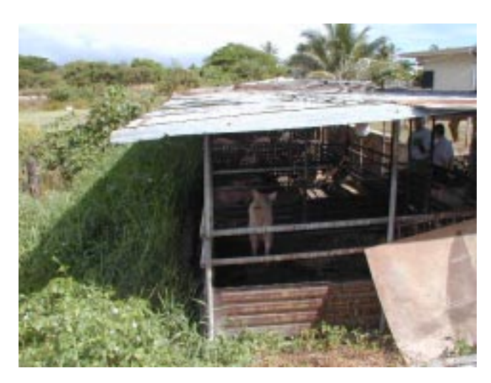
Extend eaves beyond the back wall to keep rain water out of waste trough.