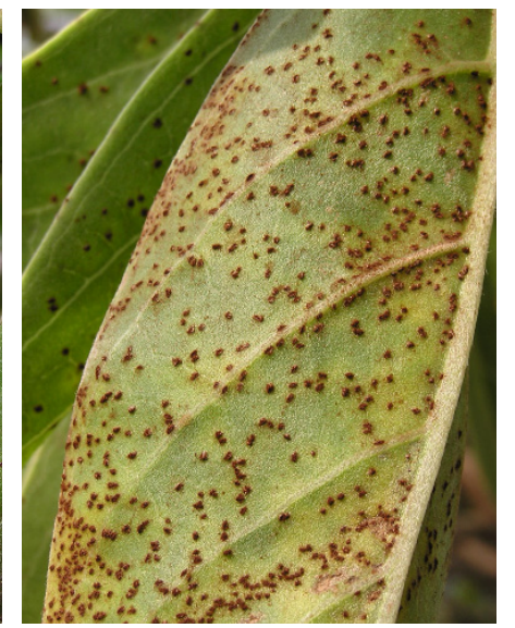
Left: Powdery cinnamon- to dark chocolate-brown erumpent uredinia scattered on top and bottom of leaf surfaces. Middle: Rust pustules surrounded by yellowing leaf tissue. Right: Touching the pustules will leave a powdery brown residue on the skin.