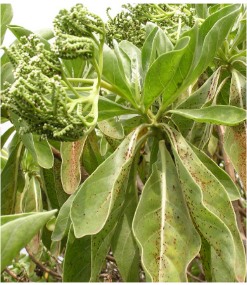
Tournefortia argentea is the only reported host for Uredo wakensis , the cause of this conspicuous foliar rust disease.

Tournefortia argentea grows as a shrub (1–5 m tall) or small tree (6–12 m tall) in coastal strand environments. In Hawai'i, it is often found with naupaka ( Scaevola taccada ), hau ( Hibiscus tiliaceus , beach hibiscus), milo ( Thespesia populnea , Portia tree), pōhuehue ( Ipomoea pes-caprae , beach morning glory), nanea ( Vigna marina , beach pea), and other Hawaiian beach plants. These strand plants thrive in the thin, shallow, well-drained, and infertile soils of coral-sand beaches and the rocky coral-limestone outcroppings of the Pacific Islands. The resilient T. argentea withstands intense sunlight, strong winds, salt spray, and submersion of roots in saltwater tides. The trees' arching, spreading canopies cast valuable shade upon the beaches and coastlines of all