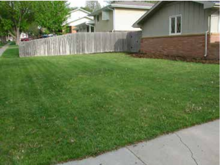
Which landscape do you prefer? Landscape at top offers year-round beauty, shade, interest, habitat, privacy, separation from the street, etc. (Before and after photos courtesy of Eric Berg.)