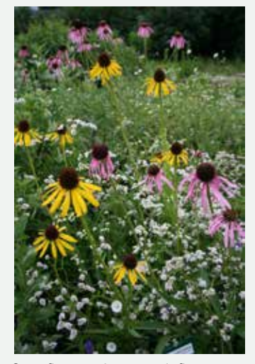
Coneflower—it grows; it flowers; looks great with grasses & fine without