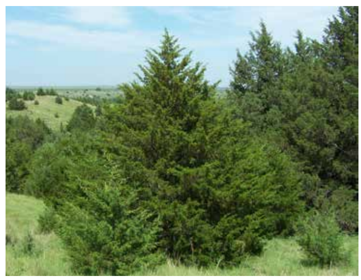
Photos of dandelion, white clover, common milkweed and eastern redcedar. All photos are from Nebraska Statewide Arboretum unless otherwise noted.

and/or aid biodiversity include things like pink smartweed, plantain, lambsquarters, pigweed, fleabane, goldenrod and aster, among others. Letting some of these plants grow here and there, even unintended, is not a bad thing. And it's a good excuse for being a bit lazy with the landscape. When the neighbors ask why you're not battling some of your weeds, just tell them you're doing your part for the environment. It's true!