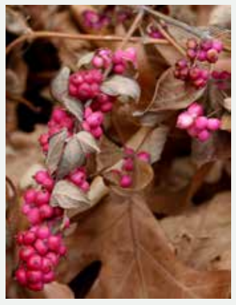
Chenault coralberry—great filler plant and wonderful for partshade; easy to use in & around trees