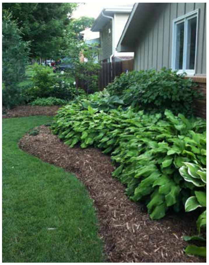
A simple v-edge cut into the lawn can separate lawn from perennial beds and allows for easy mowing.

There are seemingly endless edging options, but one of the best is simply to dig a shallow v-shape trench along the edge. It's the least expensive and allows for easy changes in bed size and shape. Plus you can mow right over the edge with no concerns for damage to the mower or edging. It