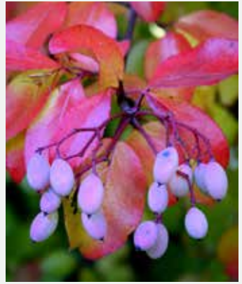
Viburnum—multi-season interest; love the fall color combinations of leaf & berry