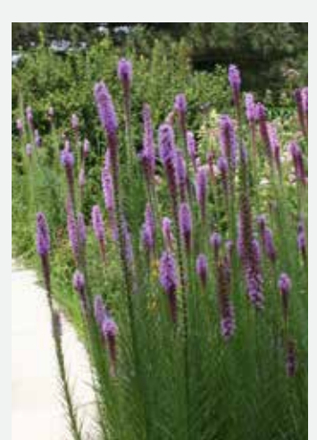
Gayfeather—tough as nails & long-lived; don't overwater