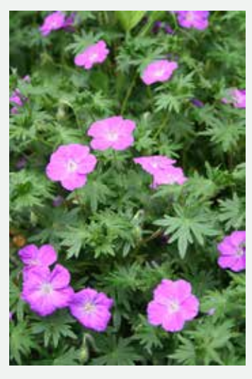
Geranium sanguineaum—for part-shade