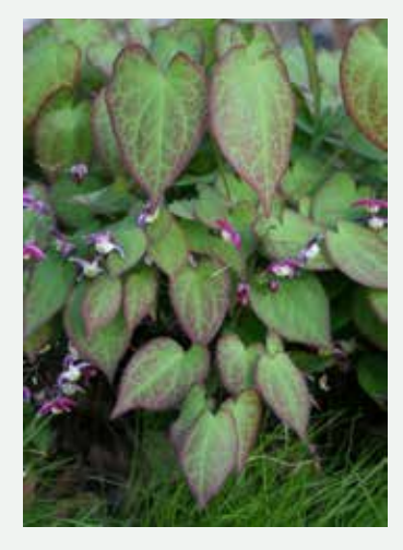
Epimedium—good replacement for hostas; perform well in dry shade; spread but not aggressively