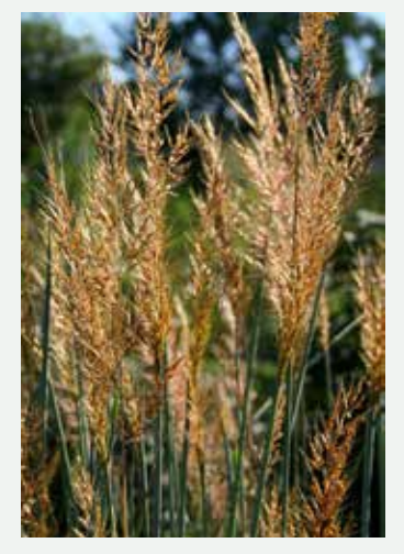
Indiangrass—for back of the border