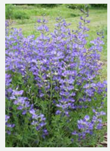
Blue false indigo—effective as a medium-size shrub

More at: pinterest.com/nearboretum/favorite-landscape-plants/