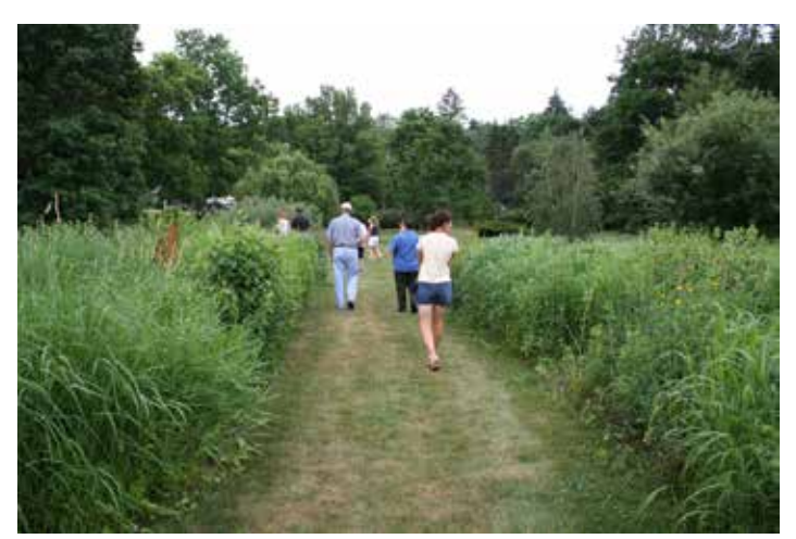
Grasses are the mainstay of prairie plantings (photo opposite), helping to keep aggressive wildflowers upright and in check. A mowed pathway makes prairie gardens more accessible and attractive.