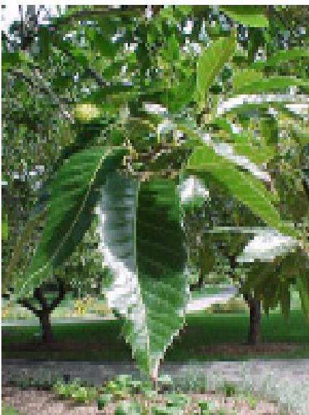
The glossy, chestnut-like leaves of sawtooth oak ( Quercus acuttissima ).