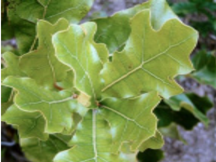
The thick, leathery leaves of blackjack oak ( Quercus marilandica ).