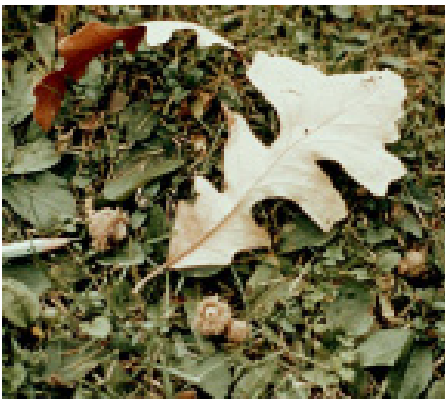
The distinct shape of bur oak leaf ( Quercus macrocarpa ) in autumn.