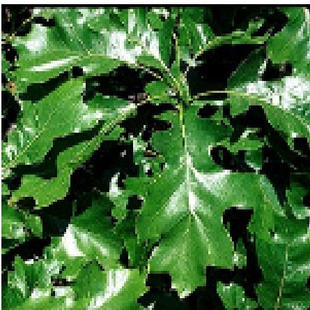
The handsome, lustrous foliage of black oak ( Quercus velutina ).