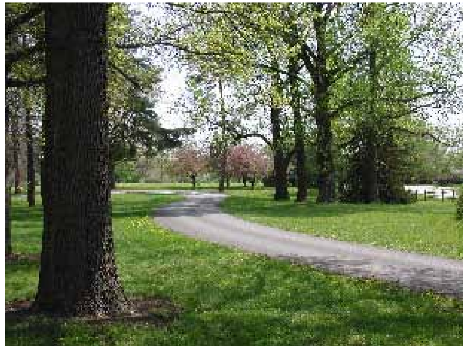
Large trees frame roads in Nebraska City's Steinhart Park.

Another disturbing problem facing community forests is the lack of species diversity. If any lesson should have been learned in the wake of Dutch elm disease, it is that a broader diversity of tree species is vital to the health of a