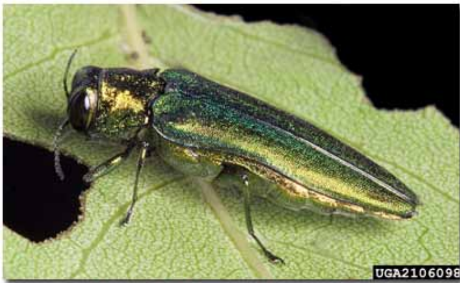
Emerald Ash Borer (Adult)

Pine wilt has already killed thousands of otherwise healthy Scotch pine in southeast Nebraska and also