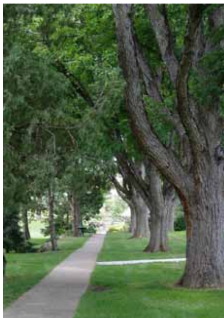
From top: Large-growing trees are important even in very urban settings, such as this plaza in downtown Kansas City. Trees shade a bench in Atchison, KS. Kentucky coffeetree is one of the most beautiful and adaptable large-growing trees for Nebraska. Here they grace pathways at Harmon Park in Kearney.

"A single great tree can make a kind of garden, an entirely new place on the land, and in my mind I was already visiting the place my maple made, resting in its shade. I knew it wouldn't happen overnight, probably not even in my lifetime, but wasn't that precisely the point? To embark on a project that would outlast me, to plant a tree whose crown would never shade me but my children or, more likely, the children of strangers? Tree planting is always a utopian enterprise, it seems to me, a wager on a future the planter doesn't necessarily expect to witness."