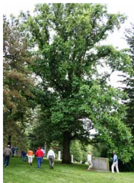
Forest Lawn Cemetery in Omaha is home to many stately trees, including this large tuliptree.

Below is a list of some of the wonderful trees I've observed or grown. Generally they remain confined to arboretums and parks, but in my opinion they have a lot of potential and have proven they should be planted more. These trees have stood the test of time. It's time to get them out of the arboretum and into our home landscapes.