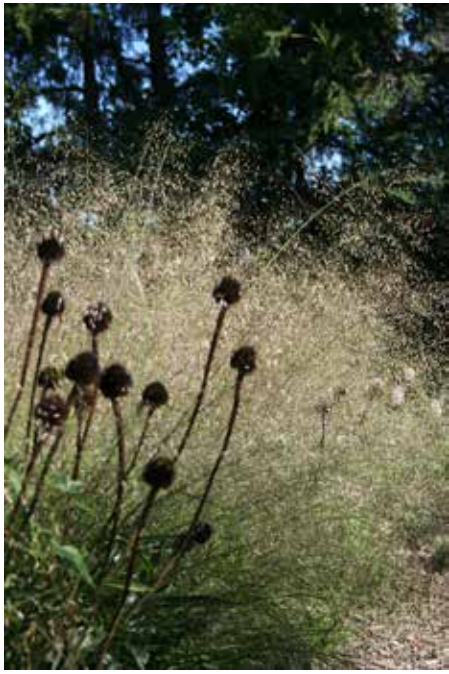
Grasses are the mainstay of the prairie garden, whether at home in the garden or in natural areas (below, Fort Robinson State Park).

“The valley of the north fork is without timber; but the grasses are fine, and the herbaceous plants abundant... the whole country resembled a vast garden.”