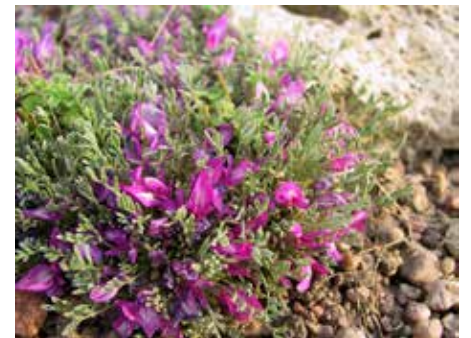
Penstemon and Barr's milkvetch (bottom).

"I'm a little prejudiced toward the penstemons not only because of their beauty but also because I have the pleasure to work with them. There is such a great variety of types and sizes and colors and they're constantly changing throughout the season. Husker Red is one of my favorites as well as Penstemon grandiflorus . Like many people, I associate my favorite wildflowers with people I have met. In my work with wildflowers I've met a lot of really great people, people who have a passion for wildflowers. Since I'm a native of Nebraska, I feel a special connection to our native plants."