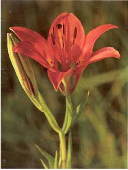
Western red lily and Turk's cap lily (above and below, NEBRASKAland Magazine/ Nebraska Game and Parks Commission photos by Jon Farrar from his book Wildflowers of Nebraska and the Great Plains .)

"There is no way I could pick just one wildflower as a favorite. Each is special in its own way, especially when you consider how it evolved to prosper in its own niche in the world. And not just the showy, spectacular flowers are appealing. Who isn't captivated by the inconspicuous flowers of fog-fruit, if for no other reason than its charming name. But when I think back to the three-year hunt for wildflowers to photograph for the Wildflowers of Nebraska field guide I wouldn't hesitate to name two that were most memorable. Early on a foggy morning on July 7, 1989 I found myself in a meadow on Hay Creek northwest of Cody, only a few miles from South Dakota, surrounded by the neon-bright, red-orange blossoms of western red lilies and nodding plumes of cottongrass. Two days later I photographed the spectacular blooms of the Turk's cap lily in the Elkhorn River valley north of Scribner. It was a grand slam of Nebraska's showiest wild lilies."