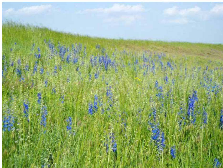
Rudbeckia with larkspur; a sea of prairie larkspur; and pathway into Toadstool National Monument in western Nebraska.