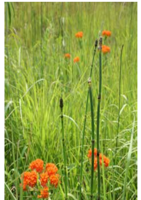
Restored prairie at Lincoln Creek Prairie near Aurora (top photo courtesy of Bill Whitney, Prairie Plains Resource Institute). Butterfly milkweed brightens the landscape.

Fire is another method of removing old prairie thatch. In natural prairie ecosystems, fire not only gets rid of accumulated thatch, it also helps reduce woody plant invasion and stimulates the growth of many native grasses and wildflowers. Rotation between prescribed burns and cutting is ideal for prairies and savannas. Keep in mind that a controlled burn is a useful maintenance tool, but requires some expertise. Be certain to check local regulations and permit procedures and, when burning, always use caution.