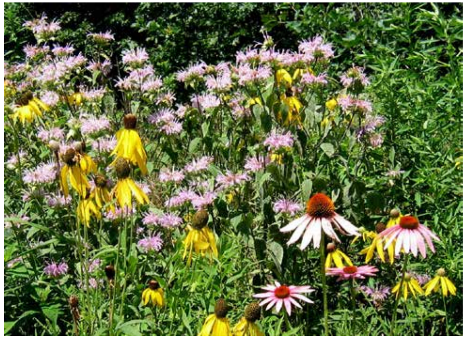
There are lots of wonderful wildflowers to choose from; here prairie and purple coneflower and beebalm contrast and complement.

Most of the native prairie plants were a victim of the plow. Today we can only imagine the beauty of the prairie as seen by our ancestors. Pioneers were stunned by this world of grass and flow-