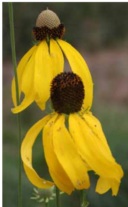
Homestead National Monument near Beatrice and prairie coneflower, Ratibida columnifera .