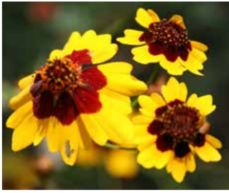
Plains coreopsis (above); prairie in Red Willow county; gayfeather and prairie coneflower (top right).