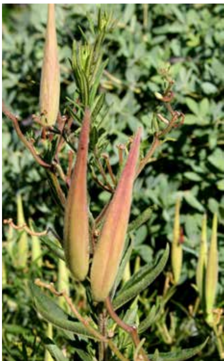
Seedheads of butterfly milkweed, one of Gladys Jeurink's perennial favorites.

Right now (mid-April), my favorite is bluebells, the Mertensias that are in bloom. They do well in dark shade. They're fun in that they die down in early May. Mine are growing under a cottonwood tree. I love to sit under a cottonwood tree so I have my furniture under one, but in early March I move the furniture out and let the bluebells take over. They make a solid blue mass. I'll move my furniture back in when they die down.