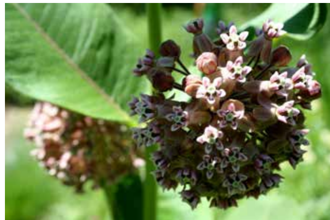
Pioneers Park Nature Center prairie (top); leadplant in bloom with close-up of foliage inset; milkweed in flower (bottom).

Plains Indians used white sage for both medicinal and religious purposes burning it in bunches as incense. It was sometimes used as a towel. Among settlers, it was occasionally used to prepare a hair rinse to prevent baldness.