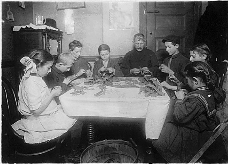
Figure 2: National Child Labor Committee Photographs taken by Lewis Hine, ca. 1912 - ca. 1912, National Archives Catalogue.

In 1912, Lewis Hine photographed a Jewish family working in their home. With the permission of the National Archives Catalogue, Figure 2 shows Hines' photograph. The photo included six children, along with an older woman and man sitting at a cramped table. In the