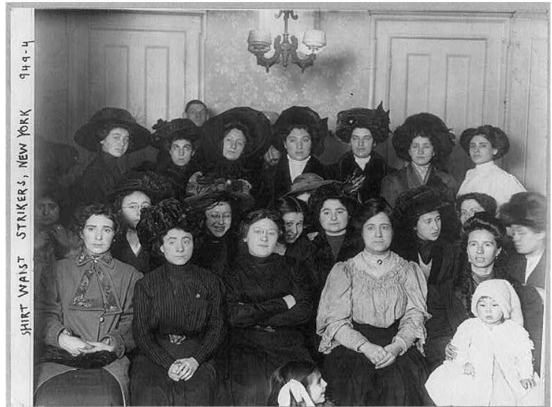
Figure 4: Group of mainly female shirtwaist workers on strike, in a room, New York, Library of Congress Prints and Photographs Division Washington, D.C. 20540 USA

The working conditions from other proprietors, including the Triangle Shirtwaist Company, remained satisfied with their workplace conditions and salaries