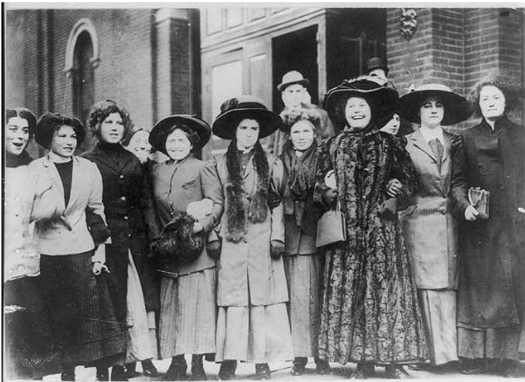
Figure 3: Group of striking women - shirtwaist workers. NYC. 1909

A glimpse of the women's working conditions was told by Clara Lemlich Shavelson, a 23-year-old garment worker. 38 Shavelson revealed the working conditions of the Triangle factory. She chose to enclose her experience working at the factory to a former newspaper company, New York World . Shavelson stated, "The girls at all the other rows of machines back in the shops have to work by gaslight, by day as well as by night. Oh, yes, the shops keep the work going at night, too. The shops are unsanitary—that's the word that is generally used, but there ought to be a worse one used." 39 Shavelson explains that the factory never stops running. It is