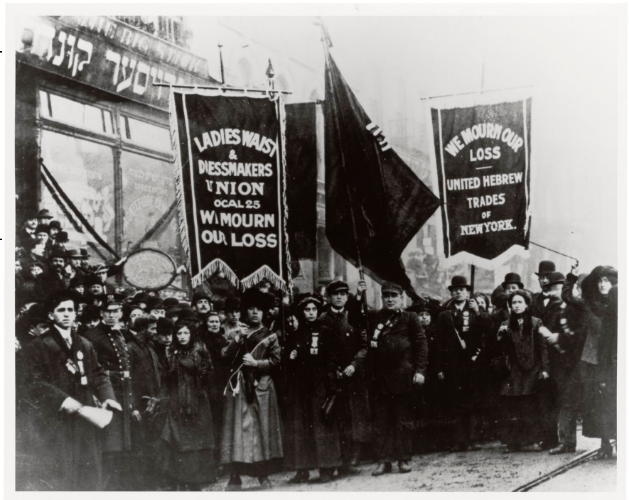
Figure 5: National Archives, 1911, "Demonstration of Protest and Mourning for Triangle Shirtwaist Factory Fire of March 25, 1911". Photographic Prints of Occupations, Labor Activities, and Personalities, 1940 - 1970

The faces of the growing crowds during the fire carried a mixture of confusion and astonishment. In the crowd, "Thousands witnessed the fire firsthand; tens of thousands