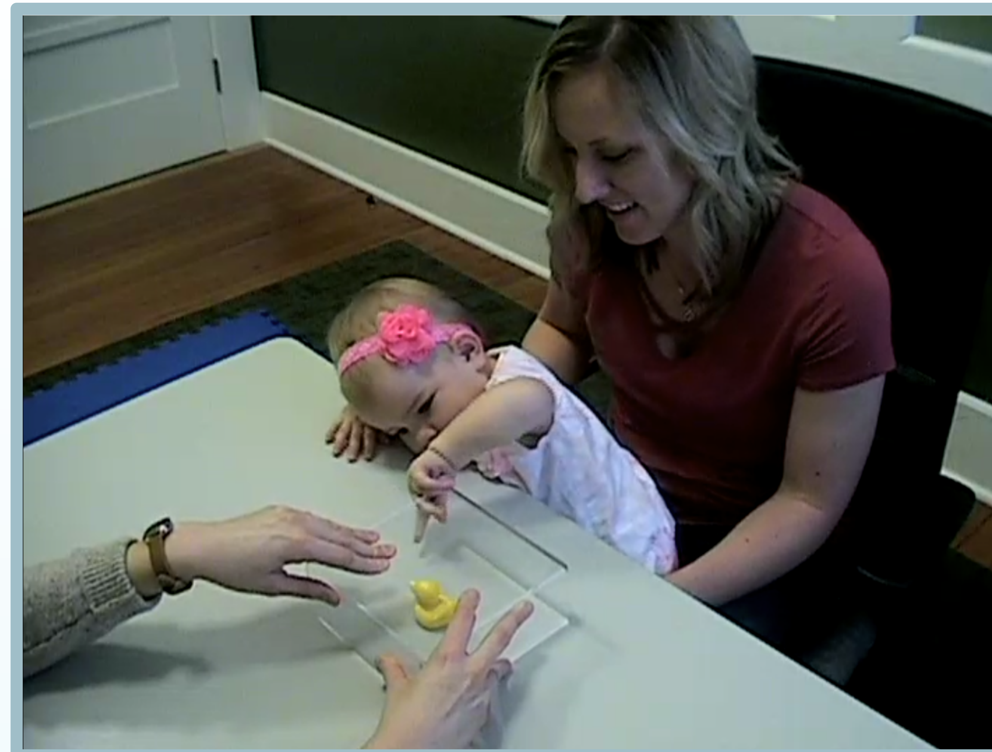
Figure 1. Infant and mother during Bayley Scales of Infant Development.