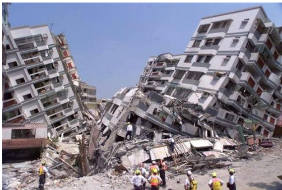
921 Earthquake, Dazhi

On the former site of Guangfu Junior High School, which sits directly on the fault line, lies the 921 Earthquake Museum of Taiwan guoli ziran kexue bowuguan jiueryi dizhen jiaoyu yuanqu 國立自然科學博物館九二一地震教育園區. It opened on 13 February 2001 in remembrance of the victims who perished. The museum has five fine galleries: Chelungpu Fault Gallery, Earthquake Engineering Hall, Image Gallery, Disaster Prevention Hall and the Reconstruction Records Hall. But it is in the grounds of the building and the second and fifth halls that the museum serves as public history. 36 No attempt has been made to reconstruct the buildings – apart from securing them – or to clear debris following the initial quake.