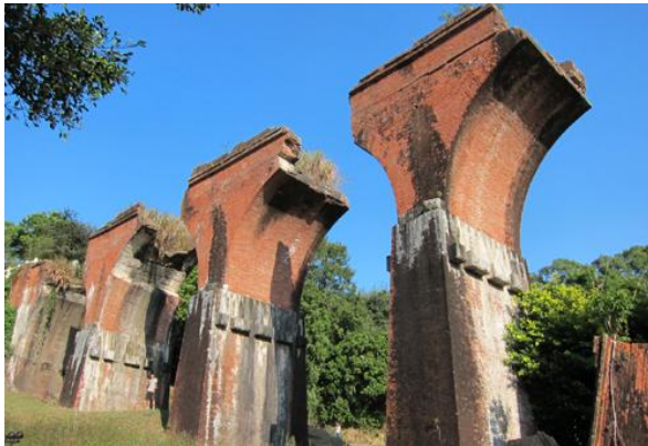
Longteng Bridge