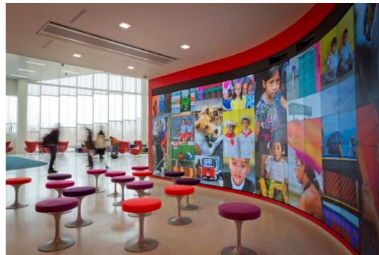
.Figure 4: Learning space at the Hunt Library (North Carolina State University)("HUNT LIBRARY. Find Inspiration.,")

Libraries have to provide a feeling of customization for the readers along with serving as locations for cooperative efforts. Thus in the United States such libraries have been developed, which function as a combined location for thinking, creativity, and comfort.