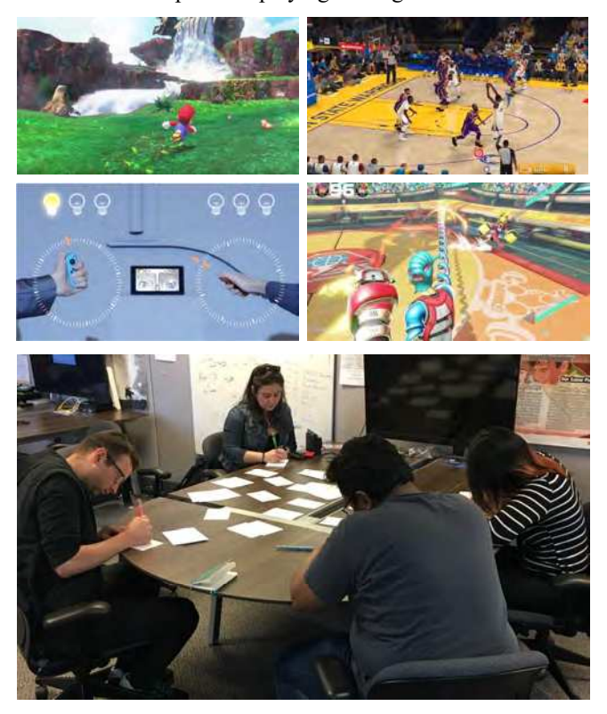
Figure 2 - Novice brainstorm (first of two sessions) and selected Nintendo Switch games. Top: Games included; clockwise from top-left: Super Mario Odyssey, 2K19 NBA, Arms, and 1-2-Switch. (Bottom) Brainstorming participants. Participants were given a presentation about haptic technology, brainstormed factors affecting haptic experience, played several games on the Nintendo Switch that involved a variety of vibrotactile feedback, then revisited their brainstormed factors, and finally voted on the most important factors.

gender, were two male and two female participants. The age ranged from 21 to 28 years in the first workshop, and 21 to 35 years in the second workshop. Across both groups, there was variation in participants' field of study, including fine arts, psychology, engineering, and computer science, as well as variation in experience playing video games.