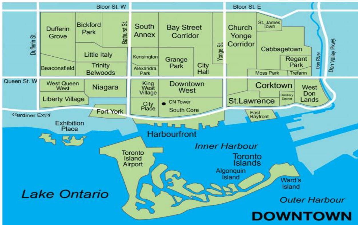
Figure 3.1 Map of Downtown Toronto.