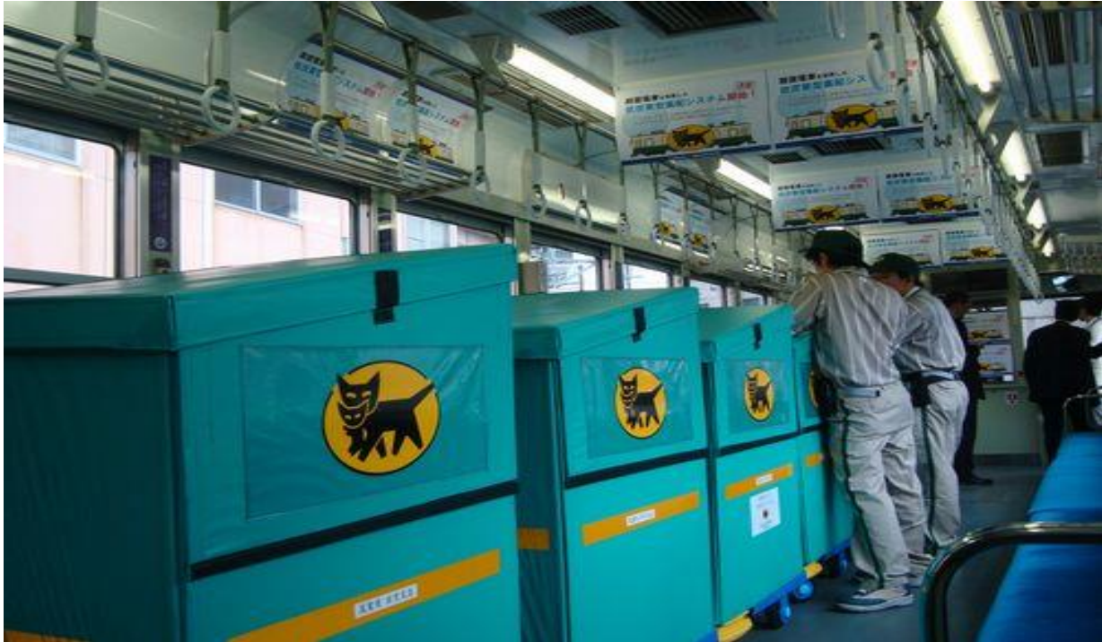
Figure 2.4: Yamato company using streetcars for low carbon parcel transport