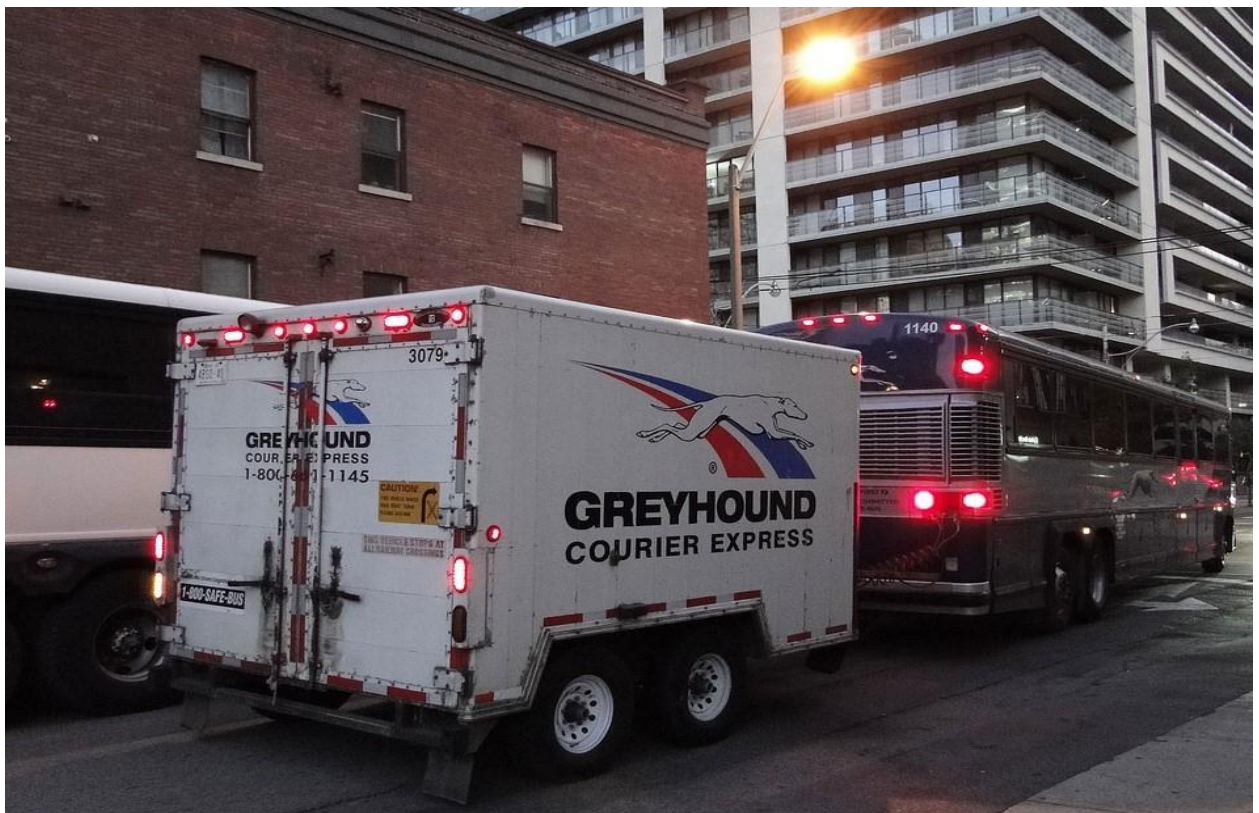
Figure 2.3: Greyhound Courier Express