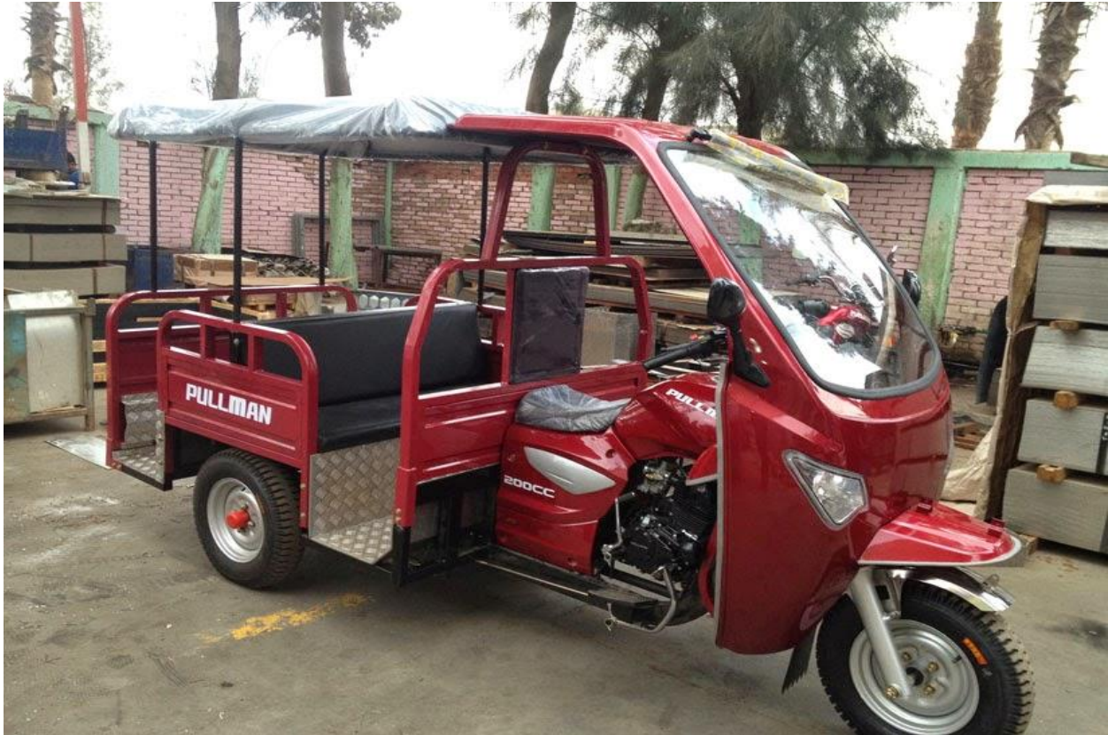
Figure 2.2: A three-wheeled motorcycle