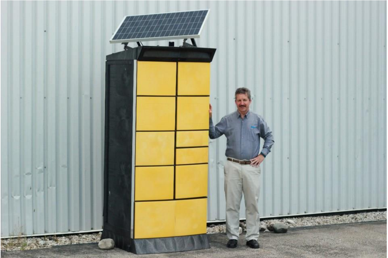
Figure 4.1: A hive where parcels are stored for pickup