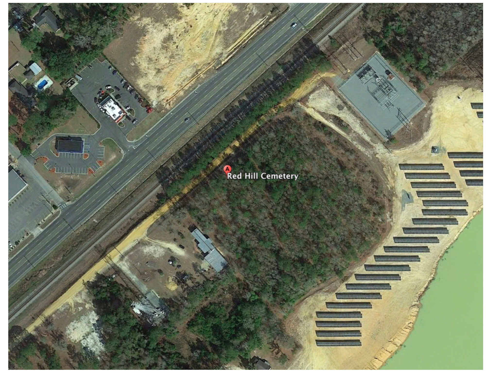
LiDAR GoPro ArcMAP

College of Arts and Sciences Center for Instruction and Research Technology Department of History Department of Economics and Geography Department of English Department of Sociology, Anthropology, and Social Work Office of Undergraduate Research Okefenokee Heritage Center/ Black Heritage Committee