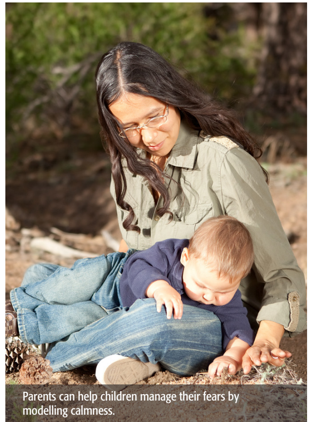
Parents can help children manage their fears by modelling calmness.

During the COVID-19 outbreak, some children who need mental health treatment may no longer have in-person access to their practitioner. To address this, many practitioners are doing their best to provide services by telephone or video conferencing. To help support more children who may be in need of treatment during times of social distancing, we feature five successful interventions in the Review article, including treatments for anxiety, attention-deficit/hyperactivity disorder and depression — all of which can be self-delivered. 🖐️