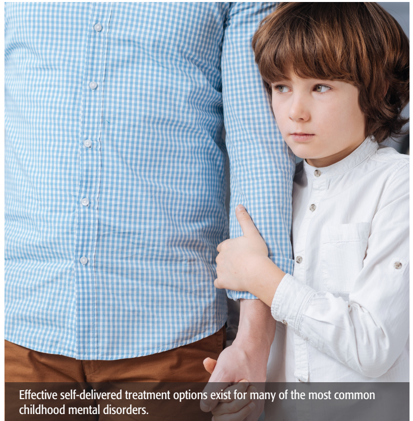
Effective self-delivered treatment options exist for many of the most common childhood mental disorders.

The three RCTs of anxiety treatments were similar in several ways. Children had to meet diagnostic criteria for a primary anxiety disorder according to Diagnostic and Statistical Manual of Mental Disorders IV standards. 21 All three treatments used cognitive-behavioural therapy (CBT), including providing education about anxiety, challenging unhelpful thinking, and practising facing feared situations. 11, 14-15 As well, all three included components for both children and parents.