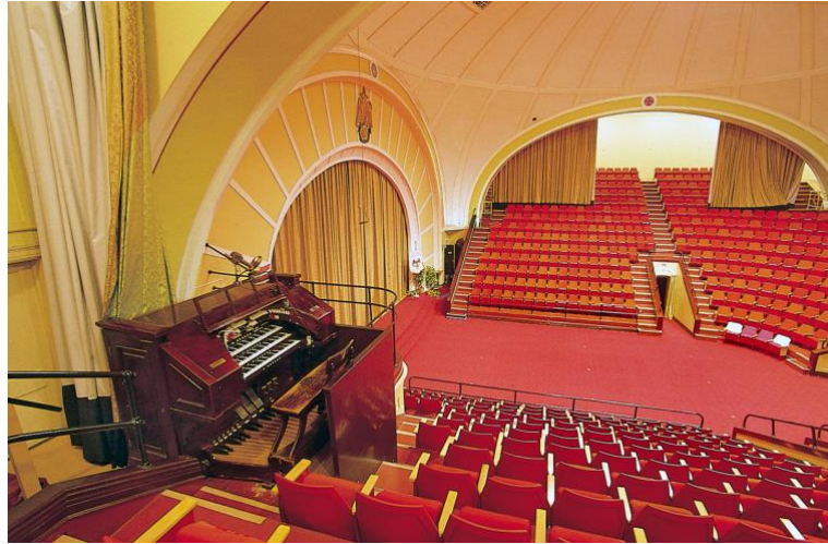
Figure 16. The Denver Scottish Rite Temple.

With a seating capacity of around 1,000, the Denver Scottish Rite is significantly smaller than St. Louis, and features a semi-circular seating area as seen in the photograph above. The Great and Accompaniment divisions are hidden in the ceiling of the west end and the Solo division is located in the ceiling of the east end of the auditorium.