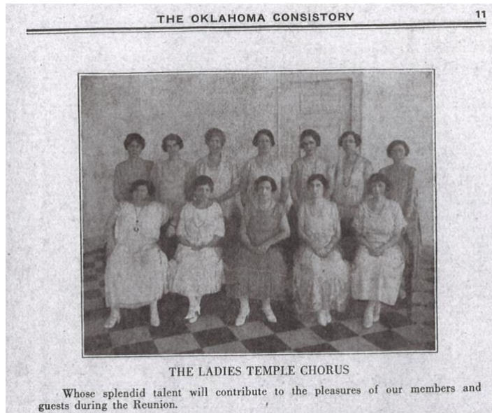
Figure 5. The Guthrie Ladies Temple Chorus, circa 1924.

music is only specified for five degrees: 3°, 5°, 17°-18°, and 32° and was played— ironically—by “Mrs. Hill.” 98