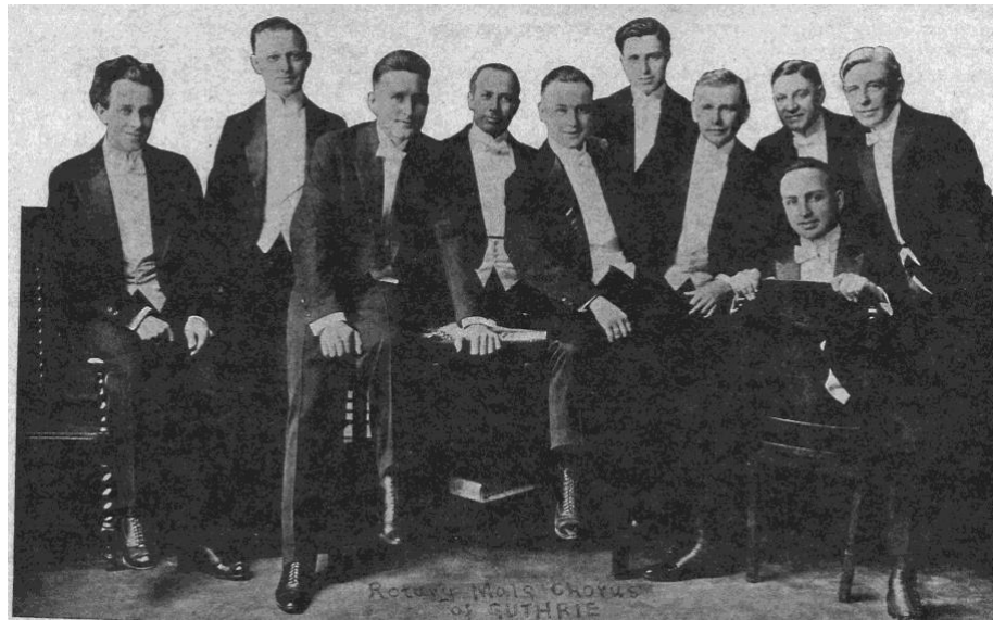
Figure 6. The Guthrie Men's Chorus, circa 1920.