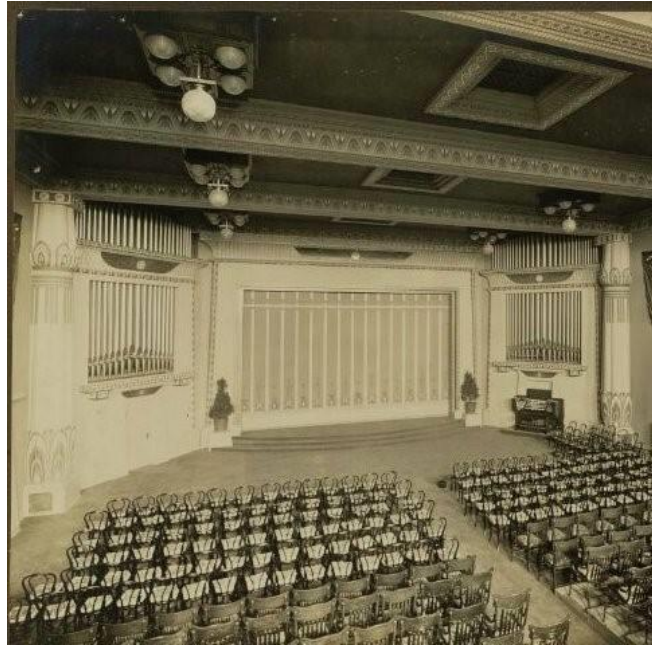
Figure 11. The Hook & Hastings Organ at the Dallas Scottish Rite, circa 1915. Photo in the Public Domain.

pipes. Some of the unusual features in this organ may be found in them, but no instrument that has yet been built combines all the features that make this organ the most complete and extensive in range of tone and register in the world.” 117