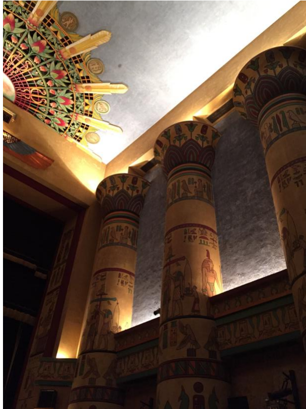
Figure 3. Detail of the McAlester Scottish Rite. The temple was designed to be reminiscent of the Temple of Karnak. Photo taken by the author.