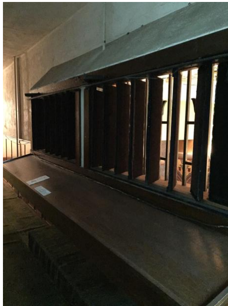
Figure 8. Detail of the McAlester Scottish Rite Choir Loft.

them when they were to sing, while an organ console and tone chute 105 were also installed to accompany them. Though organists were typically Freemasons, this arrangement facilitated female organists, should the need arise. A choir room adjacent to the loft doubled as a lounge and provided the women a space to relax between degrees without descending the long staircase to reach the main level.