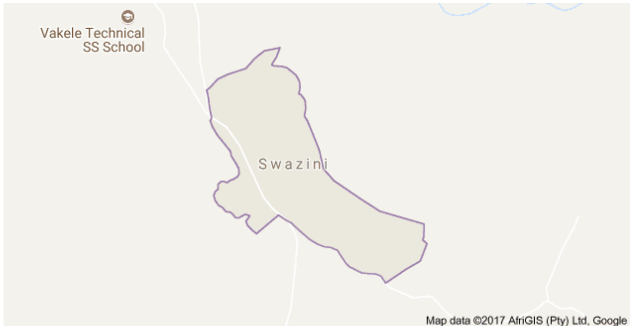
Figure 4. 1 Swazini administration map