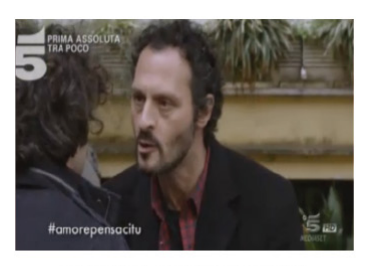
Overprint. Amore Pensaci tu, Fiction, Canale 5, Italia.