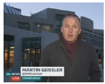
Second level ITV News, ITV, UK.