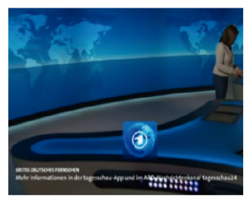
First level Tagesschau, ARD, Germany.