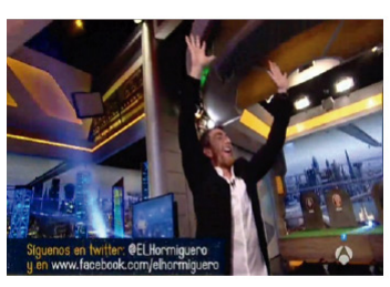
Overprint. El Hormiguero 3.0 , Infoshow, Antena 3, Spain.