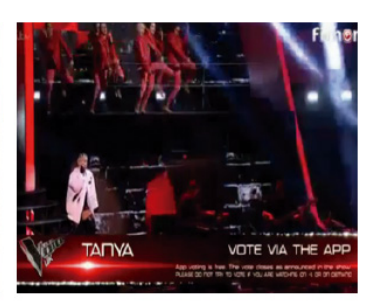
Third level The Voice, ITV, UK.