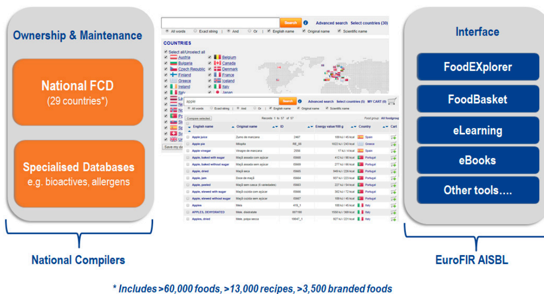
Figure 2. EuroFIR Food Information Platform.

values and includes both reference and published datasets. Most European compilers have existing FCDMS but many are outdated and can be difficult and expensive to update in line with current operating systems and software. Food Content and System Environment (FoodCASE) is a food composition database management tool, developed in partnership with ETH Zurich and PremoTec (Zurich), that is fully compatible with the EuroFIR technical annex and thesauri, as well as other classification systems and thesauri. Functionality also includes the possibility to publish data directly to a web interface, e.g., the Swiss food composition database [36]. FoodCASE is being continually developed to meet the needs of food composition data compilers worldwide and is a low-cost option available to use subject to a licensing agreement.